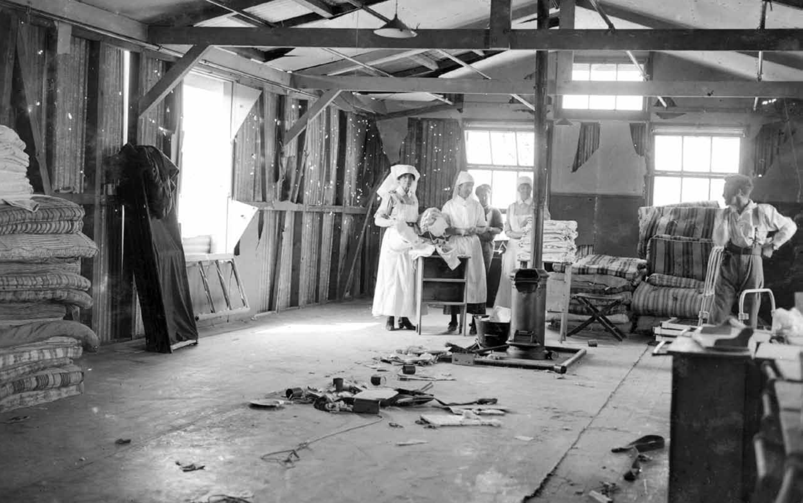
Canadian nursing sisters cleaning up ward of hospital after an unidentified bombing raid. Note the multiple perforations in the tin wall caused by the bomb blast.