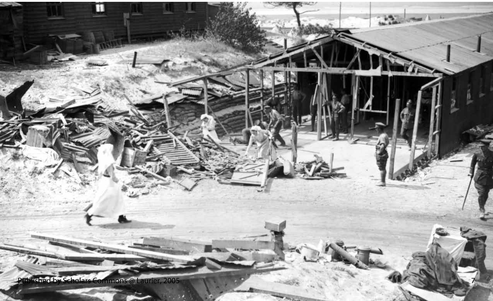
Canadian Nursing Sisters working amongst the ruins of the No.1 Canadian General Hospital, which was bombed by the Germans, killing three nurses, June 1918.

When preparing the recommendation for a gallantry award, normal practice asked submitting officers to designate the appropriate award. As the Canadian nursing sisters were officers with the relative rank of lieutenant, it therefore seemed clear to the Canadian authorities in France that they should make out the recommendation for