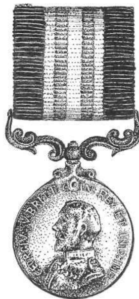
The Military Medal

The distribution of military honours following the Dieppe Raid is but one instance of how such awards were made. Authorities were concerned with striking proper balances; restrictive policies might leave courage unrecognized; excessive generosity risked dilution of the honours themselves. There were unwritten rules designed