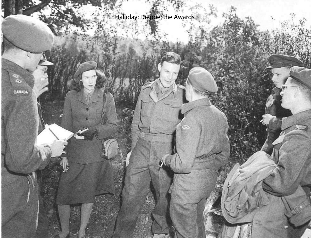
Lieutenant-Colonel C. C. Merritt, VC, being interviewed by correspondents shortly after his release from a prisoner of war camp, 21 April 1945. The award of a decoration, even a VC, to someone who had been taken prisoner was unusual.