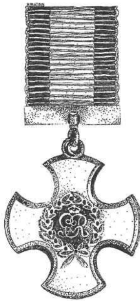
The Distinguished Service Order

In the case of the Camerons of Canada a recommendation for one additional DSO to a prisoner cannot be dealt with while the officer remains in enemy hands.