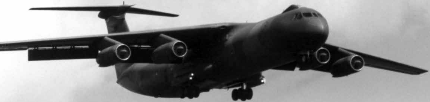
C141 Starlifter of the United States Military Airlift Command on final approach to CFB Goose Bay on its return flight from the Persian Gulf.

touched off an international crisis. It is equally well known that the US sought to aid its primary ally in the Persian Gulf by rapidly deploying forces to the Kingdom of Saudi Arabia in the event that Iraqi forces might invade. On 6 August 1990, at a meeting with high level political and military representatives from the United States, King Fahd granted permission for American and other forces to assist in the defence of Saudi Arabia. The Commander-in-Chief of CENTCOM, General H. Norman Schwarzkopf, US Army, requested that forces begin moving immediately to Southwest Asia (SWA). 17 Such speed meant that they would have to be airlifted. CONUS-based forces would be moved through Europe to SWA, and this meant 'polar circle' routes would be used.