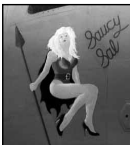
Above left & right: An RAF Victor aerial refuelling aircraft, nicknamed "Saucy Sal."