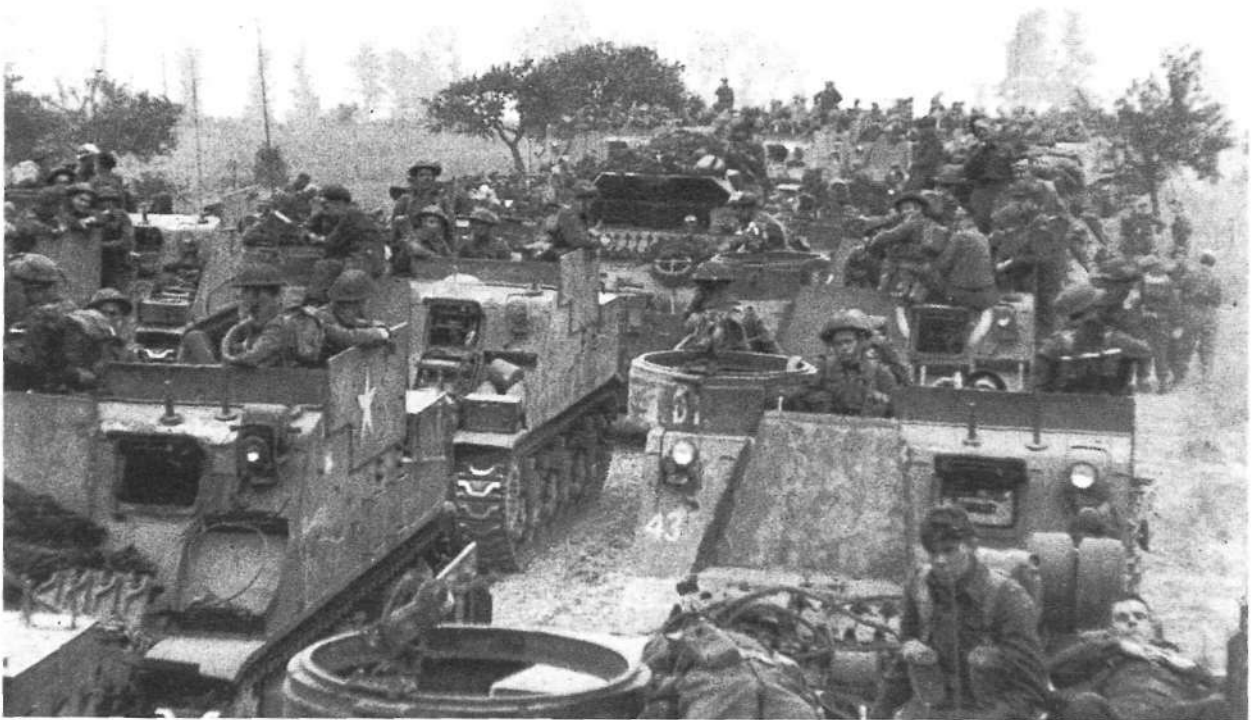
A column of "defrocked Priests" carrying troops of the 4th Canadian Infantry Brigade line up in preparation for Operation "Totalize," 7 August 1944.

"AWD Kangaroo" established itself in two fields near Bayeux on 2 August. By that evening 14 vehicles had been stripped. Armour plate was obtained from a "help-yourself" park of "W" Crocks (tanks beyond repair); mild plate was found south of Caen and also cut from landing craft stranded on the Normandy beaches. Although a work schedule had been made, most of the maintainers found themselves working around the clock. By 2000 hours on 5 August, 72 carriers had been completed and six more were ready by noon on the 6th, 5 although Stacey states that a total of 76 were ready by the 6th. 6