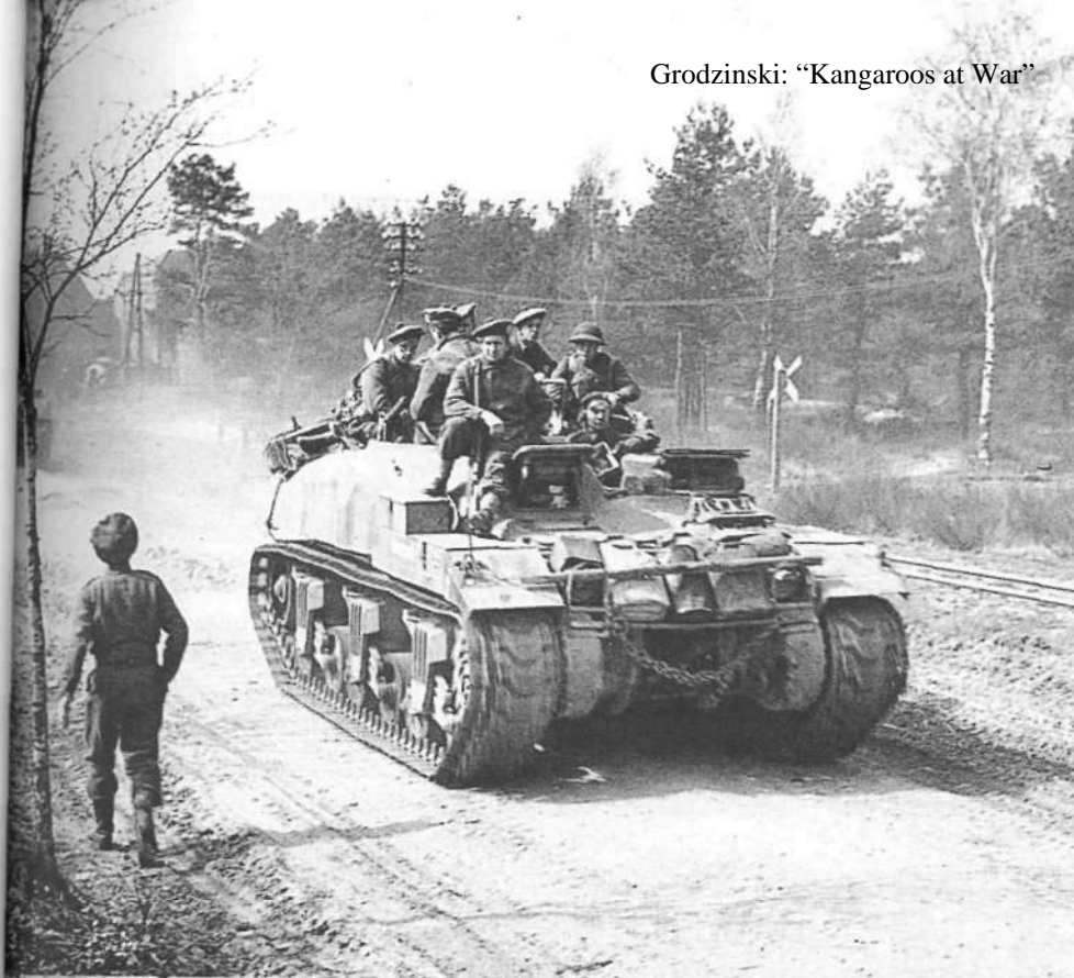
Ram Kangaroos in Action.

Left: Soldiers of the Argyll and Sutherland Highlanders being rushed forward in convoys of Kangaroos, 11 April 1945.