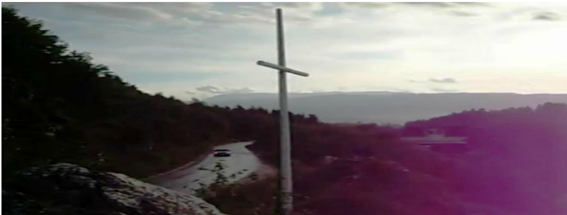
Figure 5.3 Cross on Zlatište prior to being taken down.

Beyond Prijedor, competing memorialization practices abound. 138 For example, in September 2014 in Sarajevo a makeshift cross was erected to the Bosnian Serb victims killed in the city (see Figure 5.3 ). The location of the cross, on Zlatište, an area on Mount Trebević, is particularly significant as it was the stronghold of the Bosnian Serb Army during Bosnia's 1992-1995 war and used for shelling the city of Sarajevo. The area is now in the Bosnian-Serb entity of Republika Srpska (RS). The cross is believed to have been put in place as a monument by the Union of Camp Prisoners of RS to commemorate the deaths of Bosnian Serb civilians in the city. The cross has been dismissed as an instance of political manipulation as it was put up about a month prior to the 2014 elections.