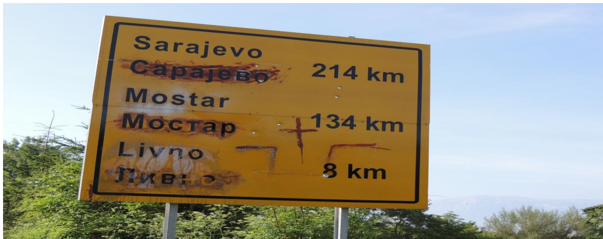
Figure 5.2 Image of a dual script road sign approaching Livno.

became more prominent. Road signs in the Federation will often have the Cyrillic version painted over or scribbled over as is the case of the sign below (image) near Livno. A university student in Banja Luka explains that these vandalized road signs in parts of the Federation are clues and powerful reminders sending the message, “Serbs are not welcome there” (Personal communication, June 5, 2012). By crossing out the Cyrillic script local populations contest the presence of the symbols of the Serb community despite the official attempts to signal a shared Bosnian state. At the same time, in the RS, the use of the Cyrillic script is perceived by several Croat and Bosniak interviewees as an attempt to entrench Serbian identity in places that prior to the war had few Serbs. Though many, particularly older interviewees of Bosniak and Croat background, acknowledge that they read Cyrillic, everyone admits that following the war it is seen as the Serb script. 123 Regardless of who paints over the signs, or puts up the new signs what is important here is how individuals interpret them and how they shape their uses of space or sense of attachment to the particular place.