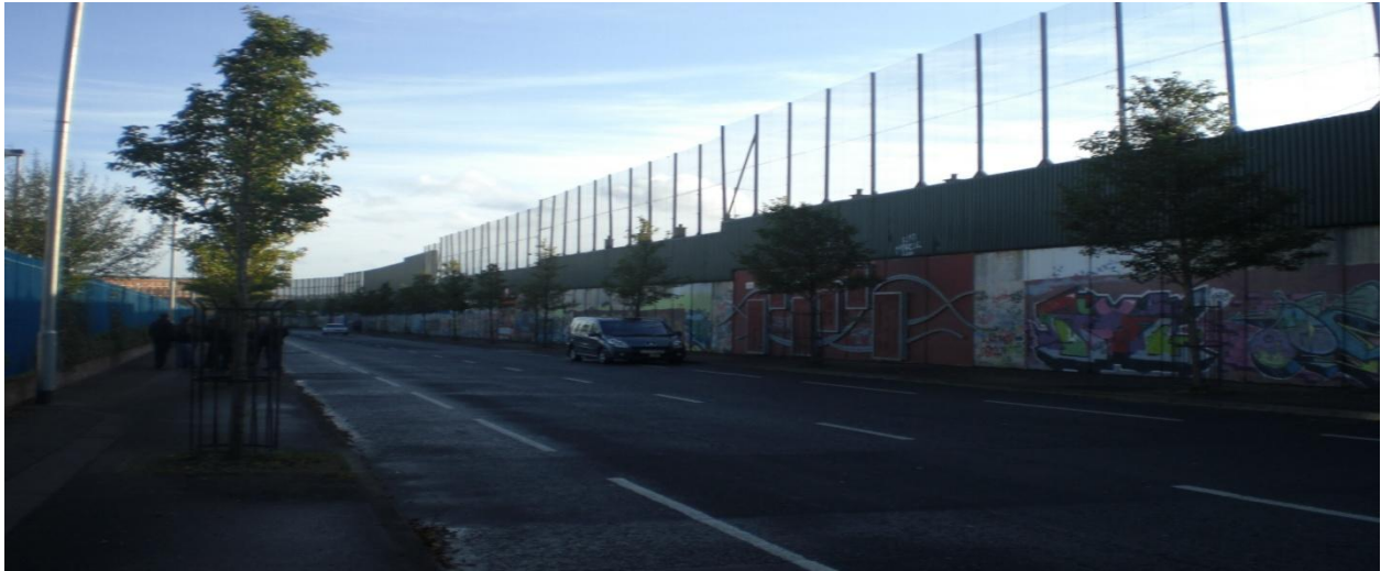
Figure 4.2. Peace line along Cupar Way, Belfast. The wall divides a predominantly loyalist area of Shankill Road from the predominantly nationalist/republican area of Springfield/Falls Road.

This distrust is further supported through everyday narratives of the past conflict and current violence. Peter Shirlow and Brendan Murtagh suggest that, “Interfaces are also an enduring ‘aide-memoire’ of harm done and threat unstated” (2006, p. 9). Interestingly, as Shirlow notes in his research interviews with individuals living in the interface areas, violent acts by members of the other community are highlighted while the intra-community disagreements and violence tend to be omitted (2001, pp. 71-72). In this way, the focus is on the “other” community as the cause of the insecurity and as the reason for the barriers. Local residents that lived in these areas often pointed out the need for the barriers to remain.