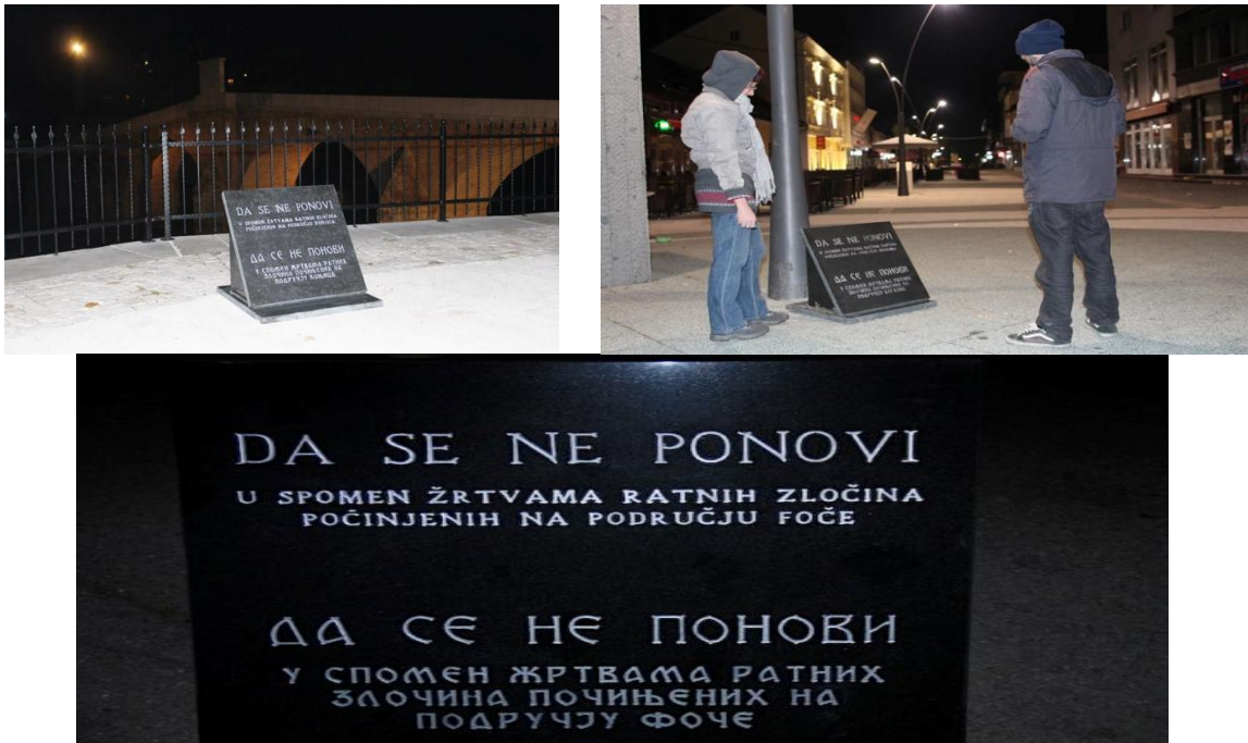
Figure 5. 4 Photos of the memorials, in Foča, Konjic and Bugojno. Taken from the Facebook page of the Jer me se tiče organization.