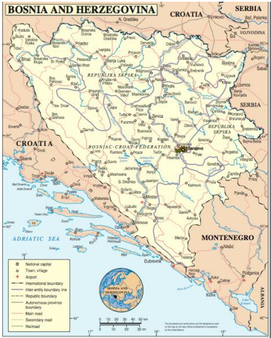
Figure 5.1 Map of Bosnia and Herzegovina.

has led to the increased salience of ethnic identity in the politics of the country and the citizenship structures.