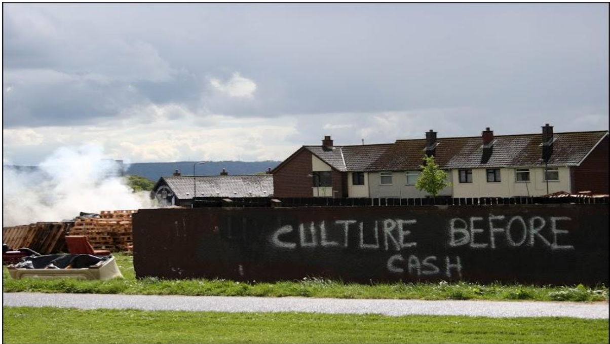
Figure 4.4 Culture before cash mural.

One member of a peacebuilding organization in Belfast points to the consequences of the bonfires, parades and riots on the community relations: