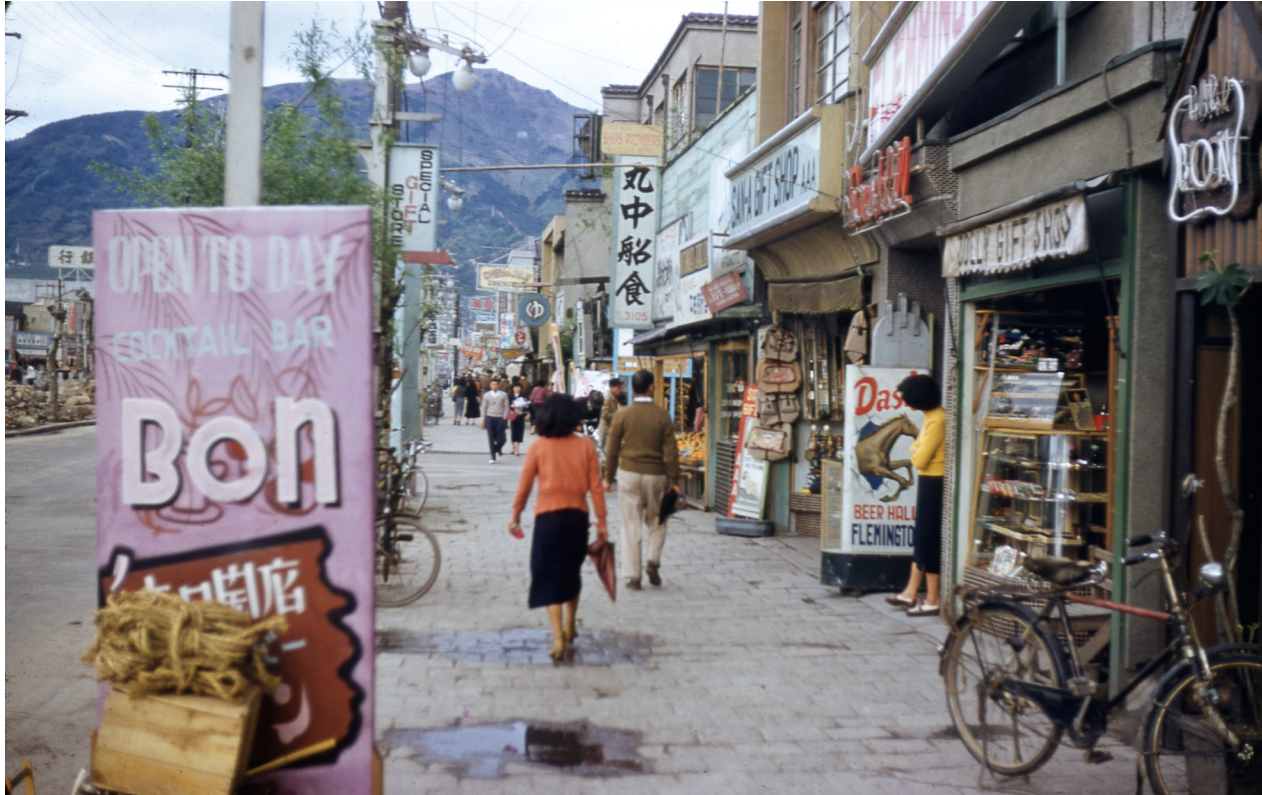
Shops catering to UN soldiers near the Australian zone of Kure, April 1953.