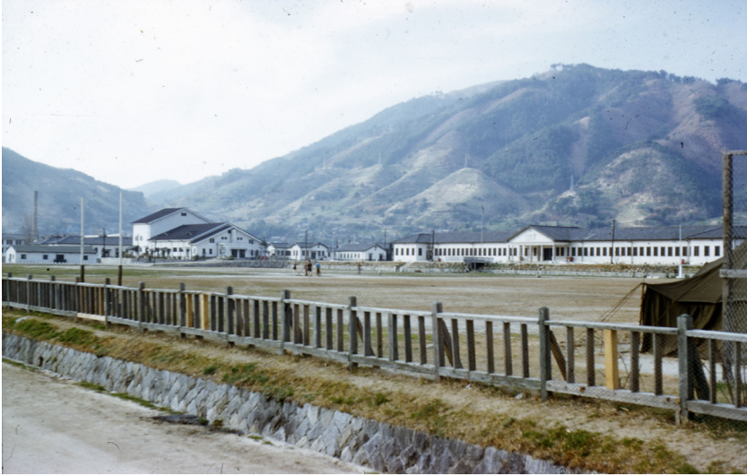
The Canadian transit camp at Hiro, in the southern suburbs of Kure, April 1953.