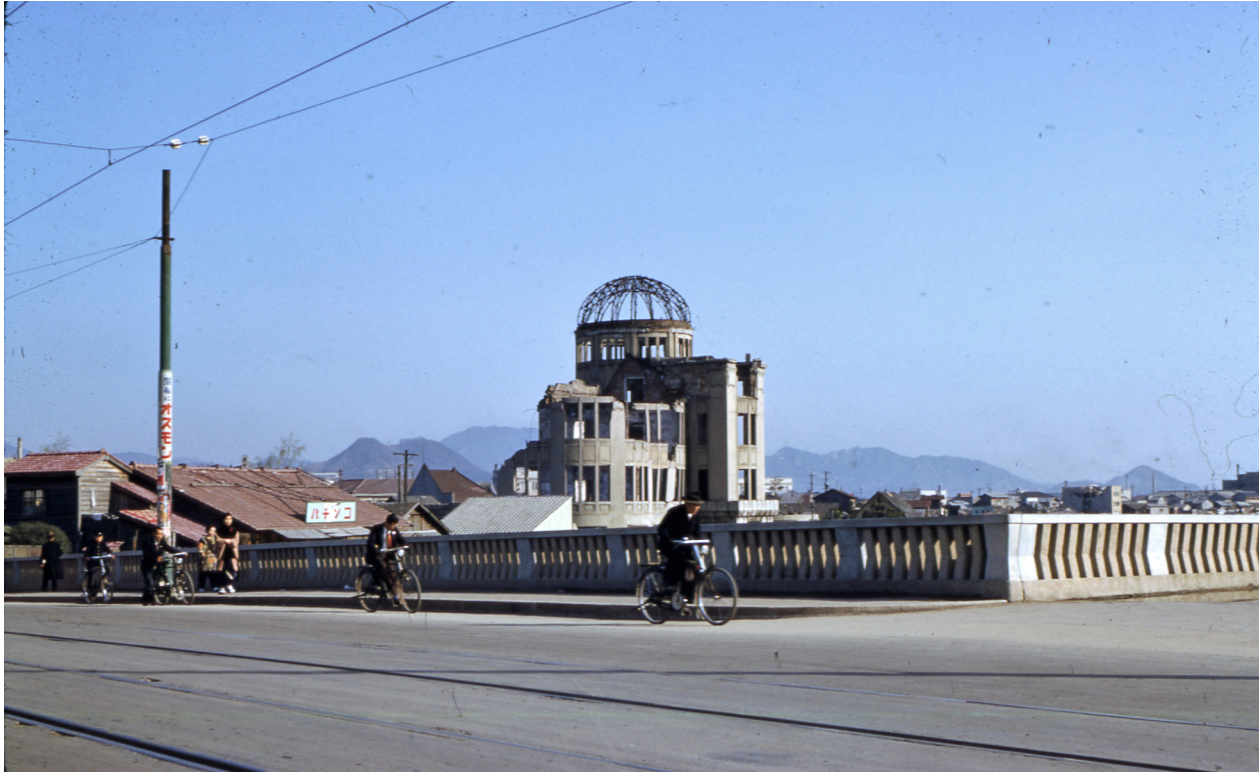
“Absolute horror.” The broken dome of the Hiroshima Peace Memorial stands over a city still scarred by signs of the atomic bombing, April 1953.