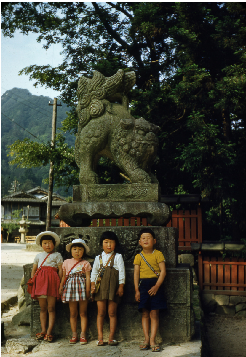
Japanese children pose for a Canadian soldier on Itsukushima, 1953.