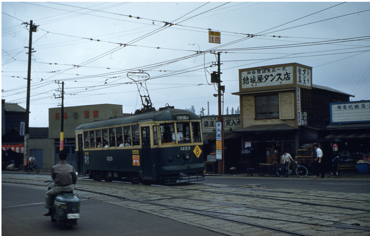
A tramcar passes along the streets of a rapidly rebuilding Tokyo, as photographed by a Canadian soldier in the early 1950s.