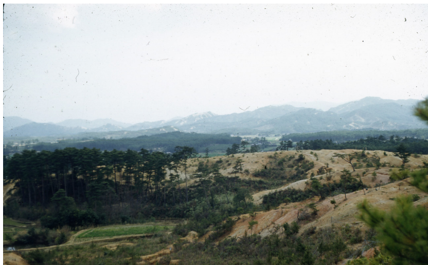
The hills of Haramura, near the Commonwealth Division Battle School, April 1953.