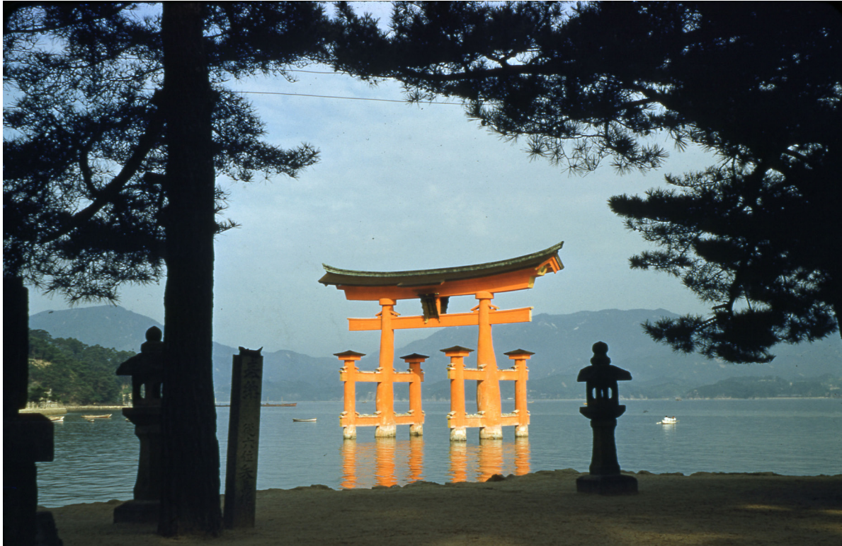
“Boat trip to Miya Jima...” The famous floating torii of the Shinto shrine at Itsukushima, as photographed by a visiting Canadian soldier, 1953.