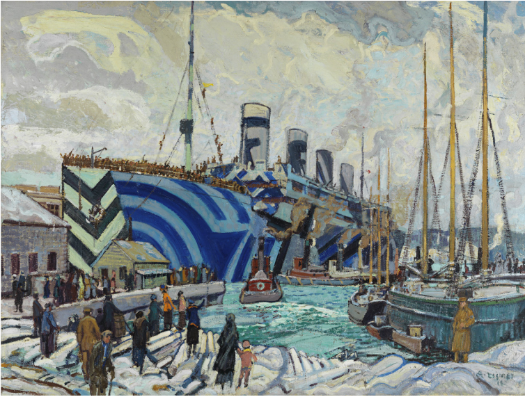
Olympic with Returned Soldiers by Arthur Lismer.

never publicly talked about his wartime use of photography. The few mentions in his war diaries are drowned in the flood of references to sketching and making drawings. 18 And where one might expect reference, for example in relation to his Belsen compositions for which we now know he took a series of photographs, there is none.