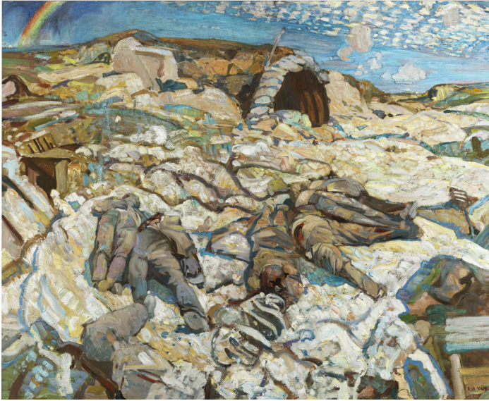
The Sunken Road by Frederick Varley.

that the authorities issued cameras to Second World War artists increasingly encourages a search for images on the part of scholars.