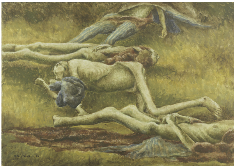
Bodies in a Grave, Belsen by Alex Colville.