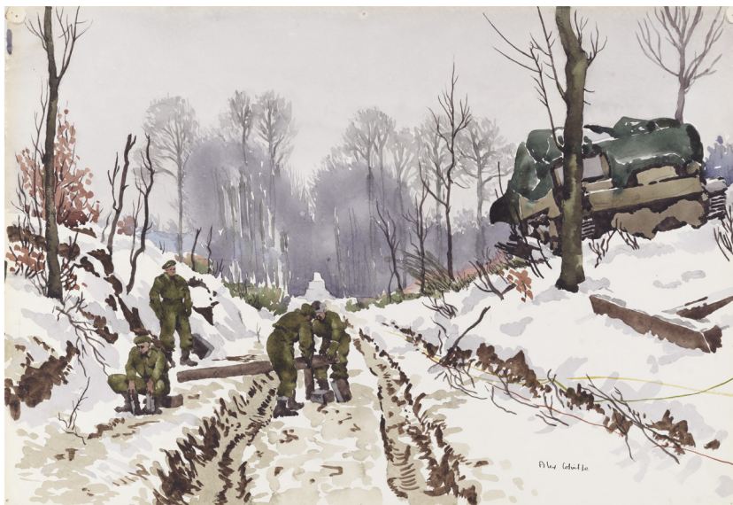
Cutting Firewood near Nijmegen by Alex Colville..