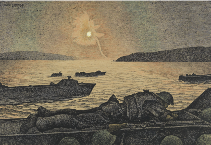
A German Flare Goes Up by Alex Colville. [Canadian War Museum, Beaverbrook Collection of War Art, 19710261-1676]

by the nature of conflict, conditions that encompassed frequent movement across challenging terrain, some degree of danger, and a requirement for portability. However, these conditions and materials were constraining when it came to on-the-spot work, making a camera essential. As a result, Colville worked on his paintings (oils were never painted in theatre) in more tranquil surroundings behind the lines, utilizing a mix of quick pencil sketches, more leisured watercolour studies, and photographs, as we shall see. 14 This shows in the precision of line and form and the overall flatness of works like A German Flare Goes Up , a dramatic depiction of a nighttime sea landing in southern France in 1944, the kind of tense wartime situation that would never have permitted sketching. 15