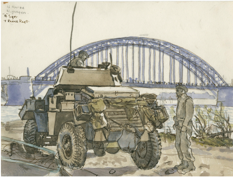
Canadian Troopers Guarding the Nijmegen Bridge by Alex Colville.

and 25 negatives of wartime scenes photographed by Colville himself. Several were included in the Summer 2015 blockbuster exhibition Alex Colville at the Gallery. 16 The exhibition made it clear that these photographs formed the basis of paintings previously assumed to derive from a traditional sketching process involving field notes and compositional studies, as my 1995 article argued. Of the seven images