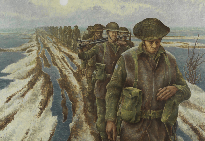
Infantry Near Nijmegen by Alex Colville.

discussed in detail in my article, three, Infantry near Nijmegen , Bodies in a Grave , and Cutting Firewood near Nijmegen , also originate in photographs Colville took himself. In the case of Cutting Firewood near Nijmegen , the compositions are notably similar. 17