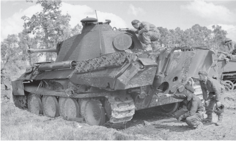
Destroyed 2nd Company SS Panzer Regiment 12 Panther Mark A being inspected by the Durham Light Infantry near Rauray, France, 27 June 1944.

staff group and light repair groups. The second, main supply group consisted of transport vehicles that carried fuel and new equipment from army-level depots back to the panzer regiment. The last group was a rear group, whose duty was supplying the needs of the workshop platoon. 73