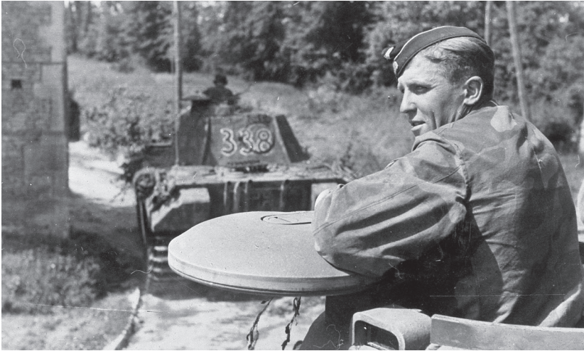
3rd Company SS Panzer Regiment 12 Panthers involved in a road march during June 1944.

battalion urgently conducted repairs and maintenance which had been neglected for some time. 61