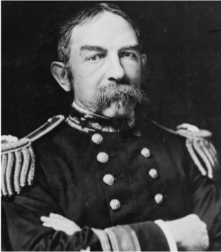
Arent S. Crowninshield, Chief of the Bureau of Navigation.

that, although perhaps never formally stated in orders, such was its office from the beginning. It possessed neither original nor executive powers. 42