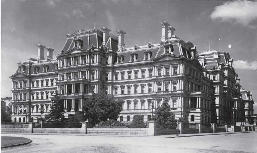
The Naval War Board met in the State, War, and Navy Building in Washington, DC.

expected to play the decisive part in the management of the war effort ... In doing so, he laid the foundation for the modern presidency.” 8