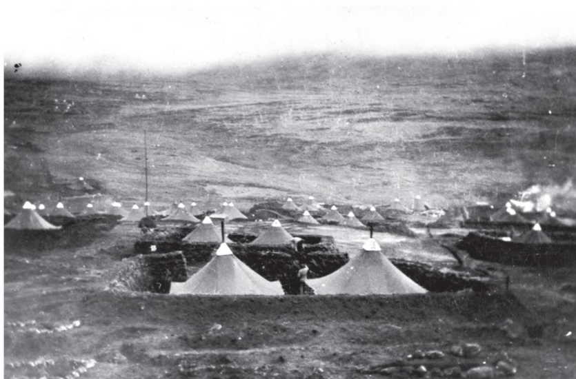
Canadian Army camp at Kiska in the Aleutian Islands, August 1943.