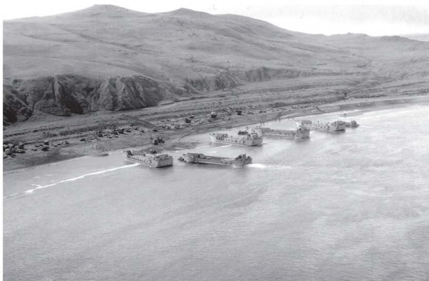
Canadian and US forces landing at Kiska, August 19437.