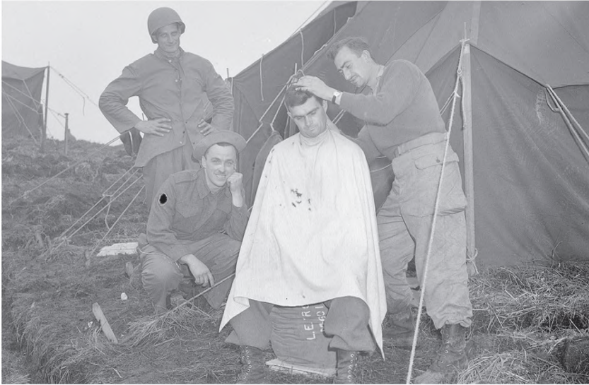
An unidentified infantryman of Le Régiment de Hull getting a haircut, Kiska, Aleutian Islands, August 1943.