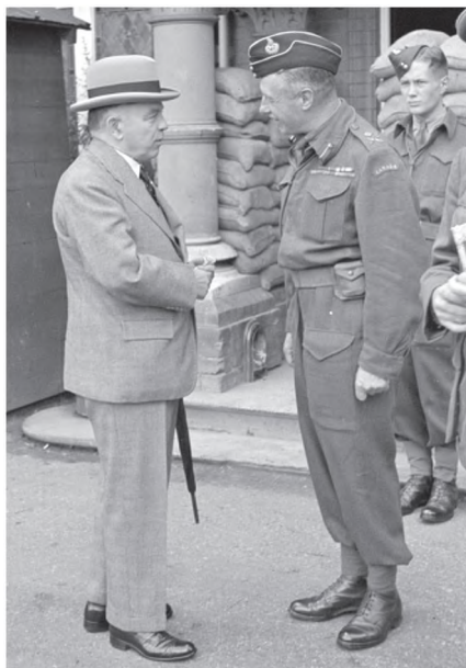
Rt. Hon. W.L. Mackenzie King talking with Major-General G.R. Pearkes during a visit to the 1st Canadian Infantry Division.