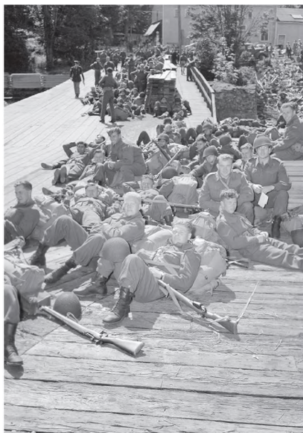
Infantrymen of Le Régiment de Hull waiting to board ships taking part in Operation COTTAGE, the invasion of Kiska, Aleutian Islands. Nanaimo or Chemainus, British Columbia, Canada, 12 July 194.

between all officers” in 14th FCT regardless of language, as it had been “sometimes difficult to keep racial and language friction under control” among ORs, “teams should be made up as far as possible from either all English speaking or all French speaking personnel.” 94