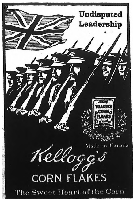
"The Sweet Heart of Corn." Kellogg's ad in the Regina Leader, April 1915.

THEY LOVE FOR NATIVE LAND IF FINAL VICTORY IS TO BE ASSURED." 26 Two days later, he was in Camp Hughes signing his attestation papers. The effect of such messages must have played some role in his decision to take a commission in the CEF. Why else would a thirty-eight-year-old successful, newly-wed, Quaker take up the call to arms? That his design would one day memorialize the battle that may have led him to join the CEF seems all the more fitting.