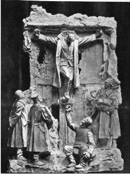
Derwent Wood, "Canada's Golgotha." (1918). Photo appeared in Saturday Night, 15 February 1919.