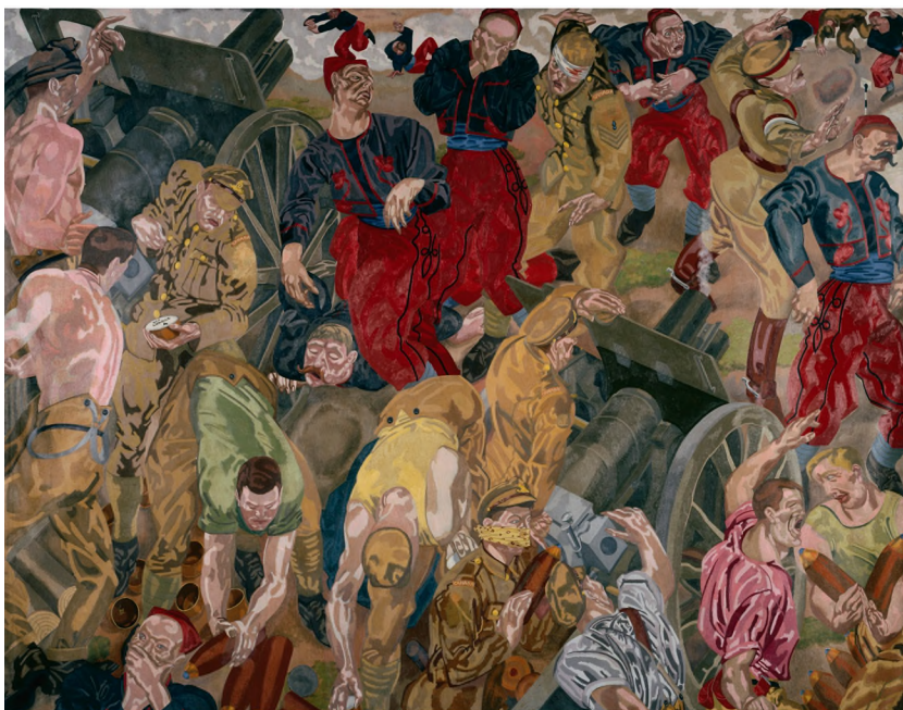
William Roberts, The First German Gas Attack at Ypres . (1918). [National Gallery of Canada 8729]

himself. The Germans play the role of the Sadducees and Pharisees, and they stand scorning God's covenant with man. 62