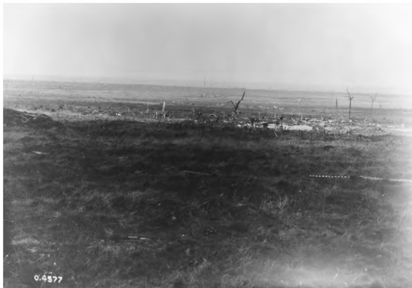
General view of ground over which Germans advanced after releasing gas, 22 & 23 April, 1915. Photographed in May, 1919.

training. But was I ever proud of them? If they had been trained for ten years they couldn't have acted better. To think of these kids that had been pulled from all over the country, and the way they behaved in a murderous fare like that. I never felt so proud of a bunch of boys in my life."