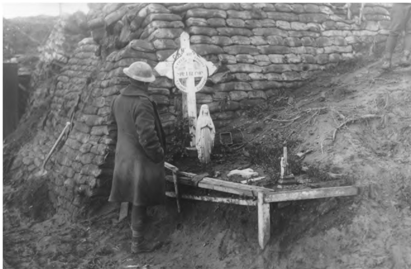
A Canadian at the graveside of a Canadian who was killed in 2nd Battle of Ypres - November 1917.

achievements had brought the Canadians immense gain in stature, for had they not proved themselves more than a match for the enemy and not less than the equal of their Allied comrades in arras. In their first major operation of the War Canadian soldiers had acquired an indomitable confidence which was to carry them irresistibly forward in the battles which lay ahead.