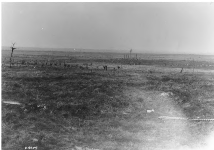
General view of ground over which Germans advanced after releasing gas, 22 & 23 April, 1915. Photographed in May, 1919.

another German force would cross the Canal and circle southward to cut off the line of retreat at Vlamertinghe while the Salient was driven in. It was to be the gravest threat to the security of General Smith Dorrien's Second Army.