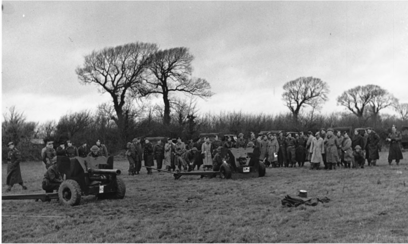
A Canadian anti-tank regiment training in England prior to the Sicily invasion.

of North Africa was quite foreign to the British – and therefore, Canadian – generals of 1942. 8