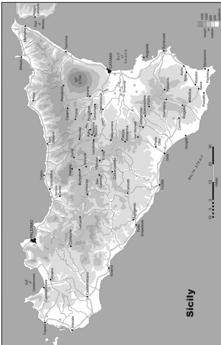
Map drawn by Mike Bechthold ©2014.