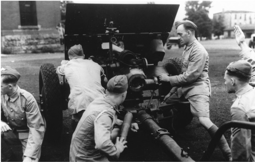
Gunners drill in Canada before being sent overseas in 1940.

Mediterranean involved a torturous voyage from Scotland to the south-eastern tip of Sicily. En route, three ships were sunk by a German U-boat resulting in vehicles, communication equipment, and artillery pieces being sent to the ocean floor. Despite this setback, the 1st Canadian Division landed on the beaches near Pachino during the early morning hours of 10 July 1943. The division formed the extreme left (western) flank of both 30 Corps and Eighth (UK) Army commanded by General Bernard Montgomery, and was flanked further to the West by Seventh (US) Army, under General George Patton. Together, Seventh and Eighth Armies comprised the Fifteenth Army Group commanded by British General Harold Alexander.