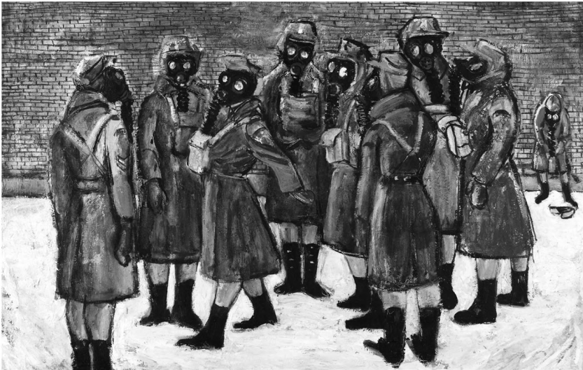
Gas Drill. A group of women try on black gas masks. All looking in different directions, the women appear curious but not sure what to do with the masks.