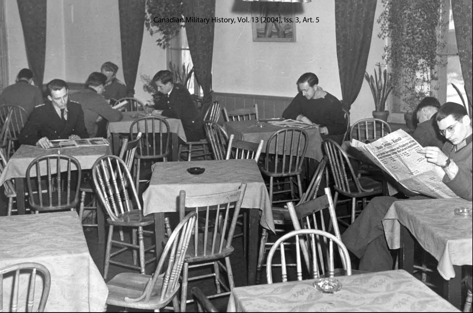
German prisoners of war relax in a reading lounge at Camp Grande Ligne.