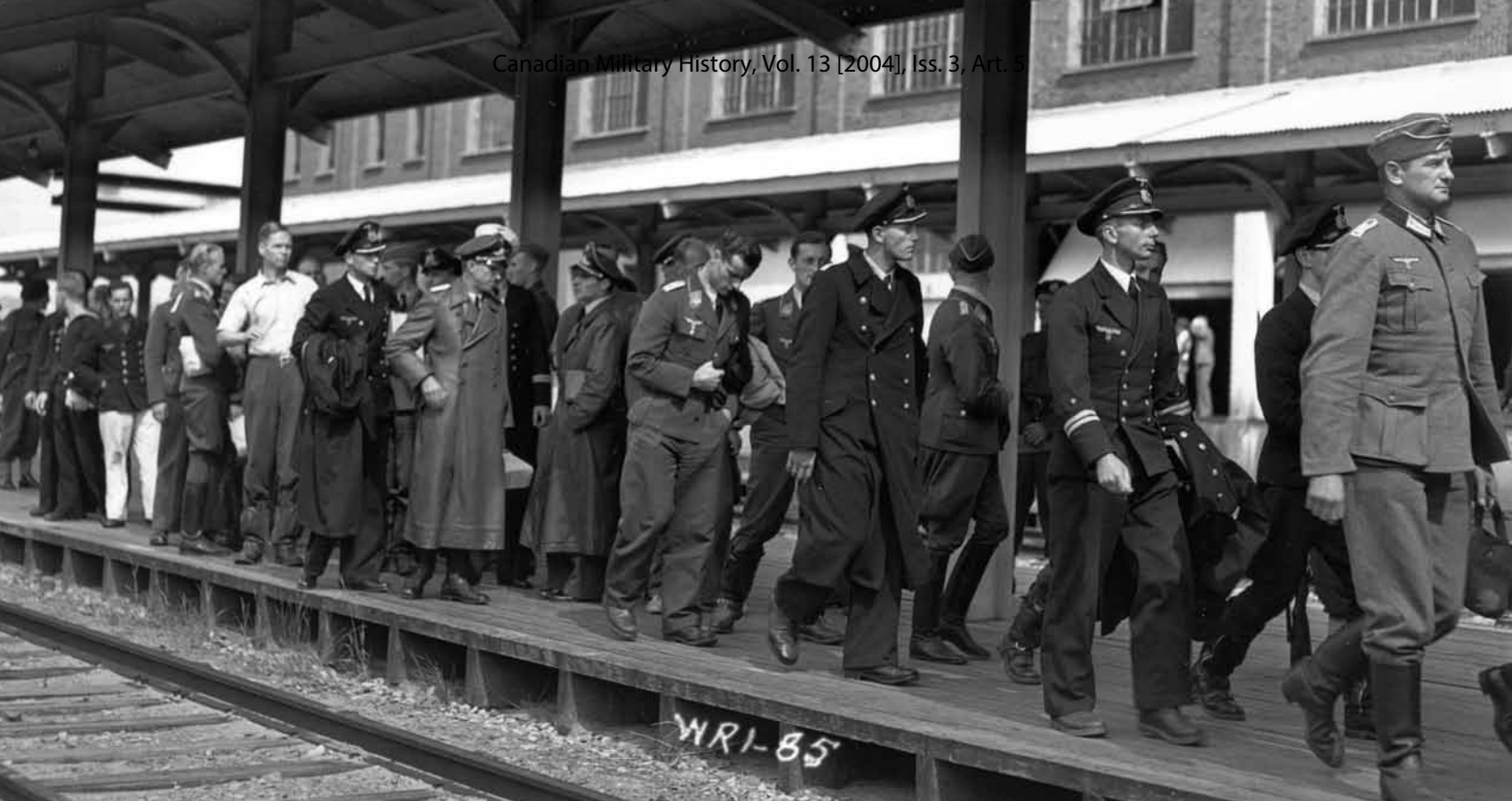
German prisoners of war arrive at the train station in Quebec City, July 1940. This group primarily contains German officers from the Kriegsmarine (navy), Luftwaffe (air force) and Heer (army).

Intelligence section to listen to American, British, Canadian, and even German radio broadcasts and to remain abreast of international events. The inmates also attempted on several occasions to use the camp mail system to transmit valuable information to Nazi Germany. To avoid detection by Canadian censors, letters were encoded or written in various types of 'invisible inks' made from milk, oranges, potatoes, urine, and other natural products. 20 Furthermore, the intelligence section kept detailed records of the movements of camp guards and the number of trains arriving at the local railway station. 21