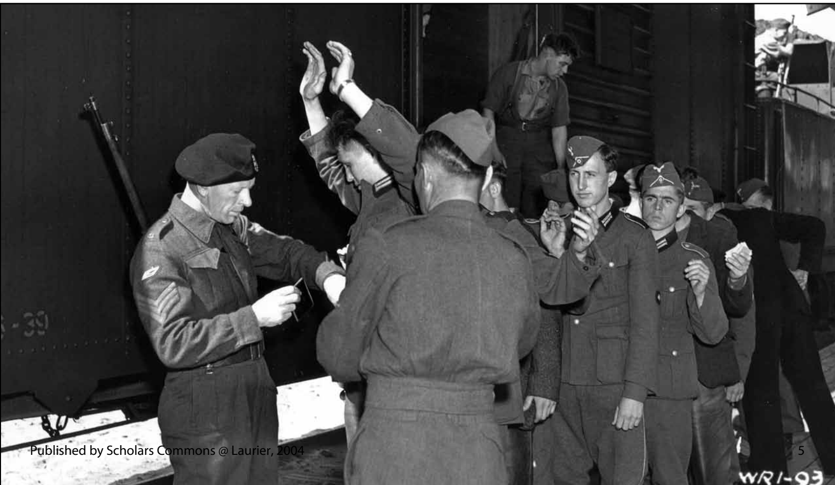
German POWs are searched upon their arrival at the train station in Quebec City, July 1940.

Nothing reflected more on the dominance of Nazism at Grande Ligne than the establishment of the HARIKARI Club. The D-Day landings of 6 June 1944 had a tremendous impact on the POWs. The realization that Allied military forces might soon crush Nazi Germany, combined with feelings of anger and uselessness, incited the Nazis to become more ruthless and rabid. 30 The HARIKARI Club was created in the early summer of 1944 by some of these POW as a means of continuing the war behind Canadian barbed wire. Although not much is known about the roots of this secret organization, we do know that it operated under the chairmanship of three