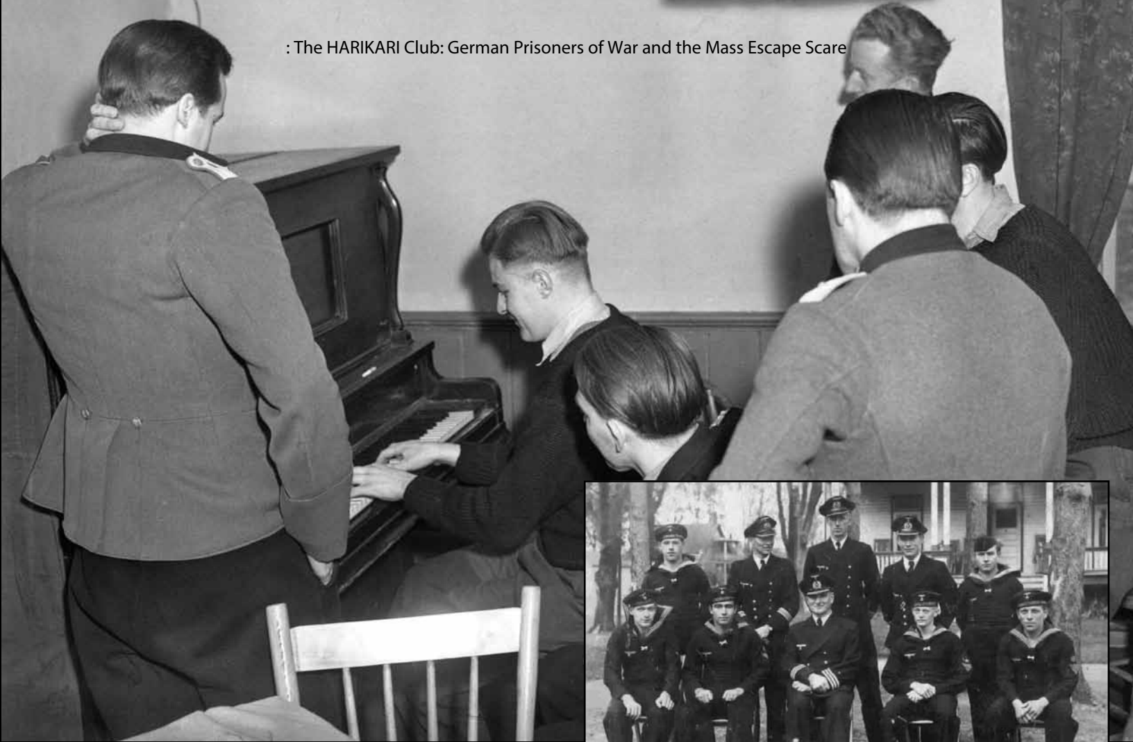
Above: German prisoners gather around a piano at Camp Grande Ligne. Right: Crew members of the German submarine U-35 at Camp Grande Ligne, 1944.