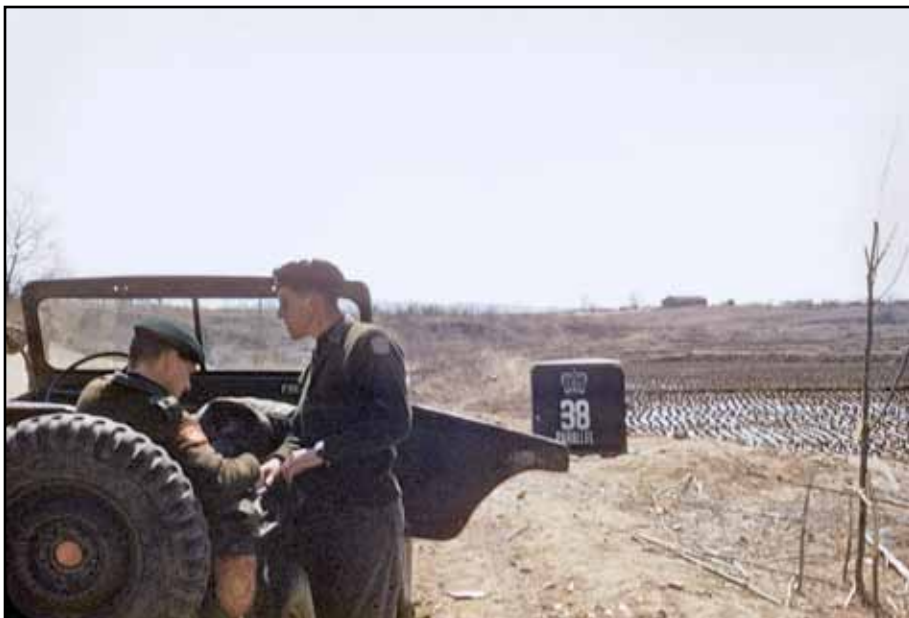
A trip to the 38th Parallel.

The Officers' Mess at the headquarters was British run and the meals were somewhat of a comedown from the unit where we had lavish US Army rations. In those days British catering was less than inspiring. The cooks did their best with what they