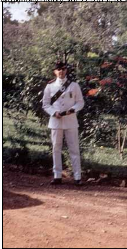
The author in Ghana.