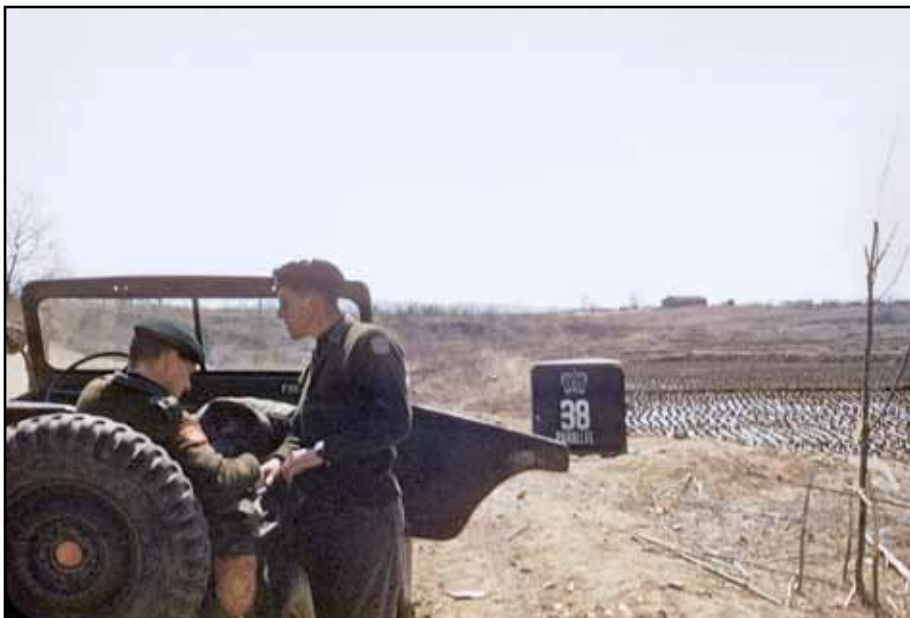
A trip to the 38th Parallel.

The Officers' Mess at the headquarters was British run and the meals were somewhat of a comedown from the unit where we had lavish US Army rations. In those days British catering was less than inspiring. The cooks did their best with what they