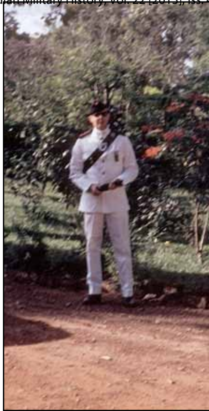
The author in Ghana.