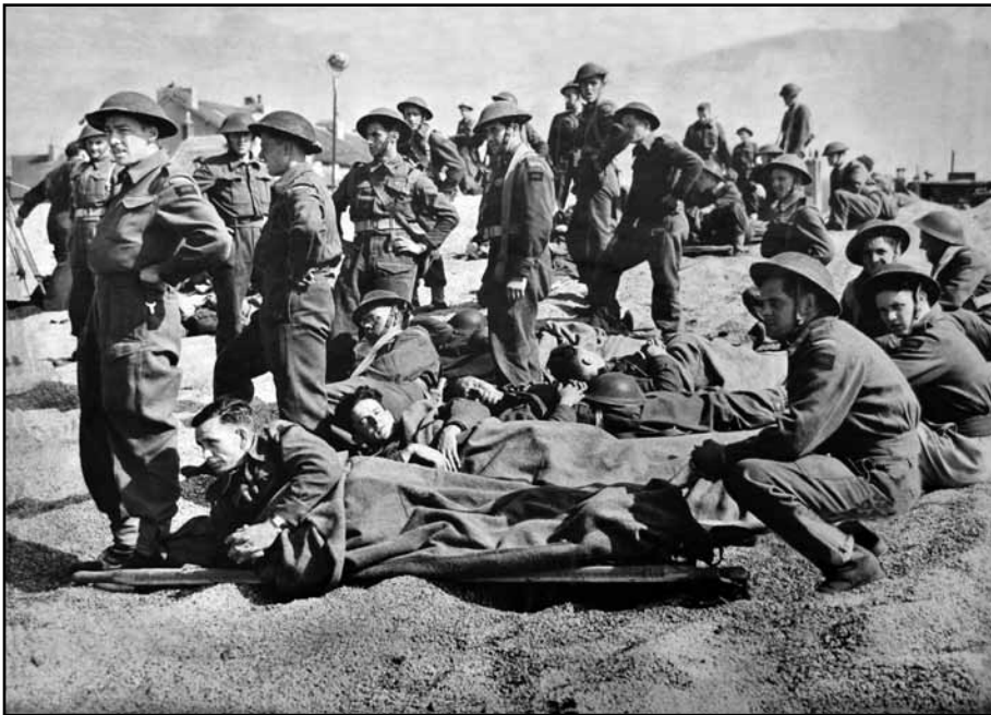
Top left: FMR soldiers await evacuation from the beach following the conclusion of Exercise Yukon.