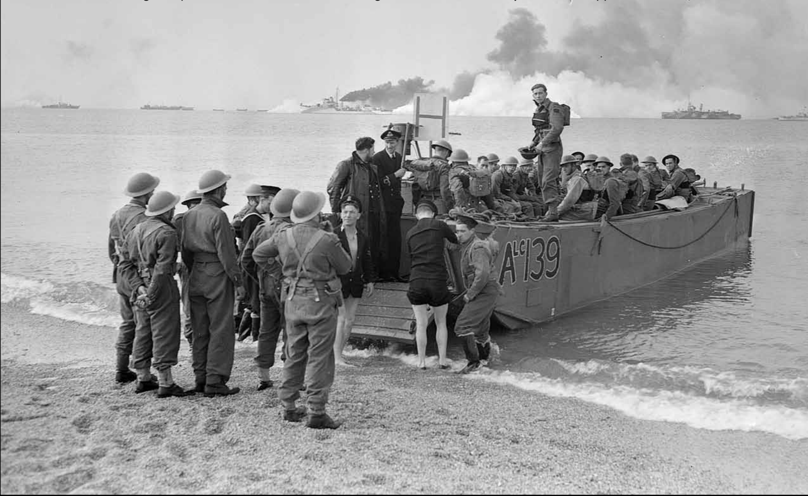
Canadian troops practice assault landings, July 1942.

another unit. Indeed, the FMR were ordered during Operation Jubilee to disembark and support the attack of the Essex Scottish Regiment at Red Beach near the tobacco factory. This role involved flexibility, initiative, and instinct by junior leaders to avoid the beach becoming a killing zone under enemy fire. However, this was never practiced during the Yukon exercises. 67