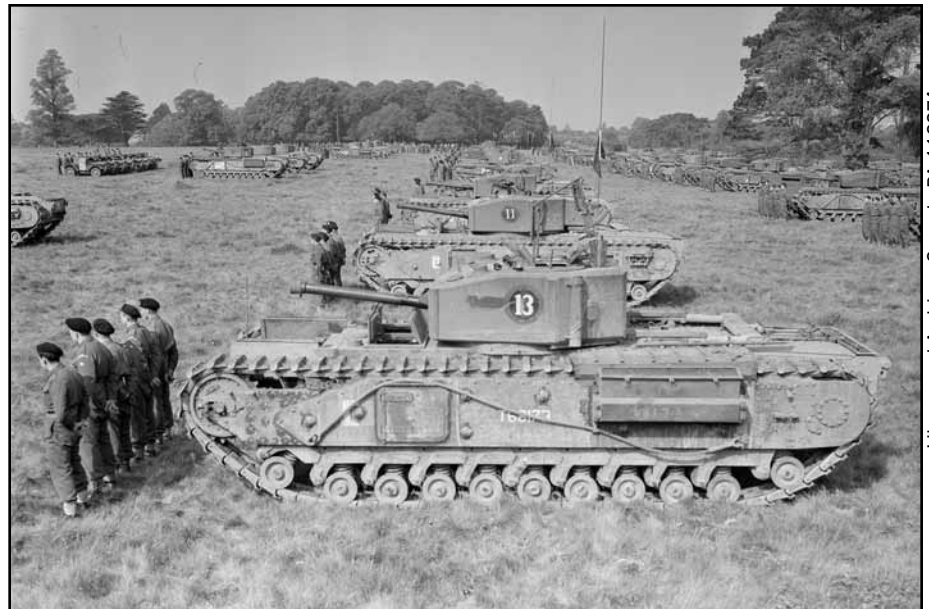
Library and Archives Canada PA 116274

more theoretical training where men became familiar with the concepts related to amphibious operations while including progressively practical exercises. In the case of the FMR, emphasis during this period was placed on landing and embarkation exercises, demolition and heavy explosives, and village fighting in addition with battle drill. Like other units of Simmer Force – 2nd Division's name for this operation – special attention was paid to physical fitness, the aim being the ability to walk nearly 18 kilometres in full assault kit in 120 minutes. However, on 28 May, the training