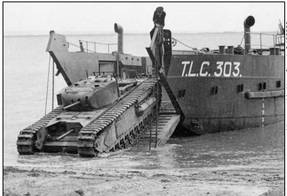
Library and Archives Canada C-138689

Though tanks played an important role in Operation Jubilee, little combined arms training took place before the raid.