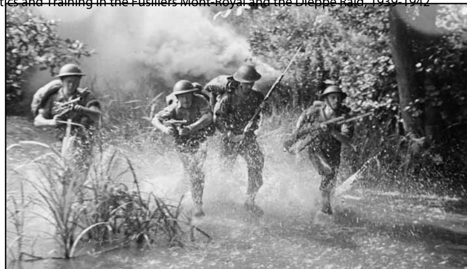
Library and Archives Canada PA 132456

Battle drill was a method of teaching minor infantry tactics and fieldcraft that emphasized fire and movement and was directly aimed at section, platoon and company leaders. It was a flexible type of training where soldiers rehearsed situations encountered on the battlefield. The acquisition of a tactical instinct was the fundamental objective of battle drill so that junior officers and NCOs were able to adapt to circumstances faced in real combat. As such, battle drill broke down manoeuvres into a series of basic movements – a very important aspect that made it different from other training methods. In practice, the objectives of battle drill were to enhance the physical capabilities of individual soldiers; to show them