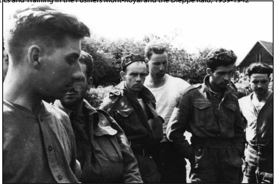
National Defence Photo PMR 86-252

On the other hand, the faulty communication system between the beaches, the RAF, ships, and tanks during the operation had resulted in a lack of fire support for the FMR from the various services, causing a significant number of losses even before they arrived on the beach. This same failure forced the unit and sub-unit commanders to improvise and work without direction from their superiors. Above all, the operational role assigned to the FMR in Operation Jubilee necessarily implied that the senior and junior leaders possessed great flexibility and initiative since the unit may have been required to strengthen any vital sector of the Red and White Beaches. Thus, the question is whether these officers were ready to lead their sub-units on the beach and to improvise leaving the beach as quickly as possible. Speed, initiative and instinct was therefore imperative to allow companies to spread out as