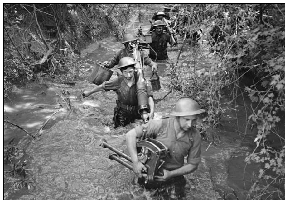
Library and Archives Canada PA 177140

how to use the ground, to maximize the use of small arms and to teach them teamwork from the section upward. Battle drill also implied improved realism in the exercises and the introduction of battle inoculation to prepare troops for the sights and sounds of war. 44 Both theoretical and practical exercises of increasing complexity were introduced on topics as varied as village fighting, street fighting, river-crossings, attacks of all sorts and night movement. 45