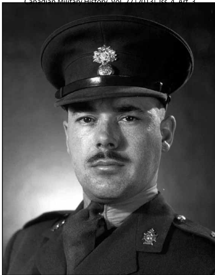
Canadian Forces photo ZK-28

Six FMR officers attended battle drill courses from November 1941 to May 1942 and the unit began battle drill training from January 1942 onward. This new type of training worked well and was received positively by men as additional officers returned from battle drill courses to share what they had learned. 48 The unit war diarist noted at the beginning of March 1942 that "More and more, a greater number of officers are sent on these courses (Battle Drill) from where they come back with new and better ideas from which the Unit will greatly improve. It is hoped that this Battalion will shortly arrive to a very high standard of training." 49 The introduction of battle drill allowed the dissemination of a common understanding of the doctrine at lower command levels. For the men and officers of the FMR, it was a welcome change to the dull training regimen that had been in effect since 1939. Moreover,