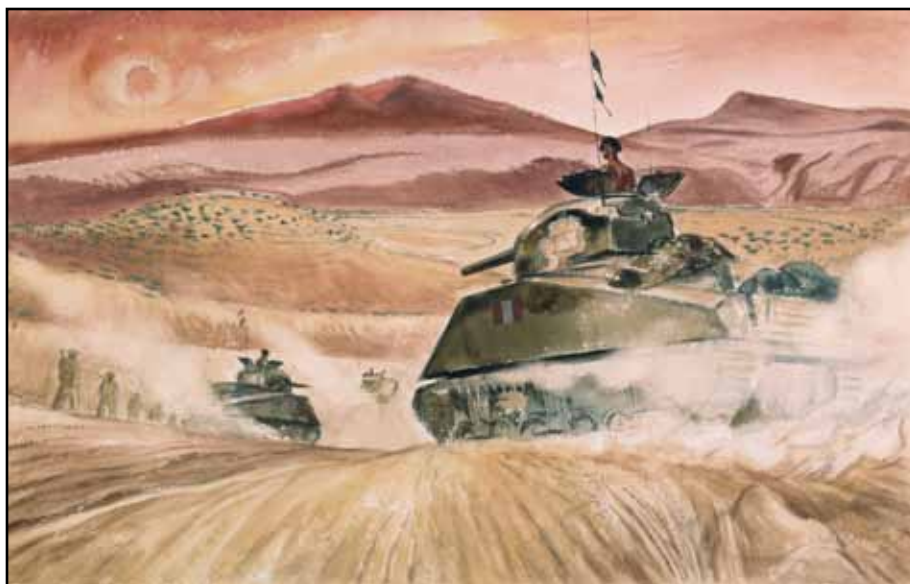
Canadian War Museum 19710261-4800

The heat was brutal and the dust rose so thickly that it became an almost palpable barrier through which men thrust their whitened bodies with an actual physical effort. It gathered thickly on their sweating faces and hardened into a heavy crust. Their feet sank ankle deep in dust as if in a tenuous slime. There was no water; the occasional foul well along the route dried up when the first few platoons fell upon it. The sun was an implacable enemy, and there was no escape from its brutality. Steel helmets became brain furnaces. The weight of the battle equipment,