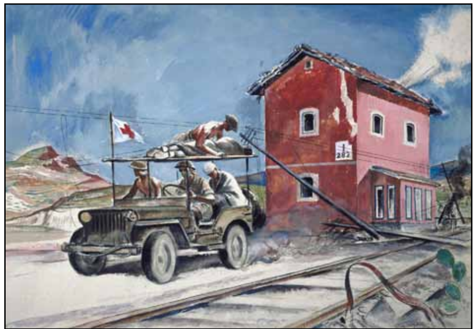
Canadian War Museum 19710261-4596