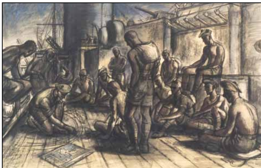
Above: His Majesty's Transport Circassia - 1st Canadian Division.