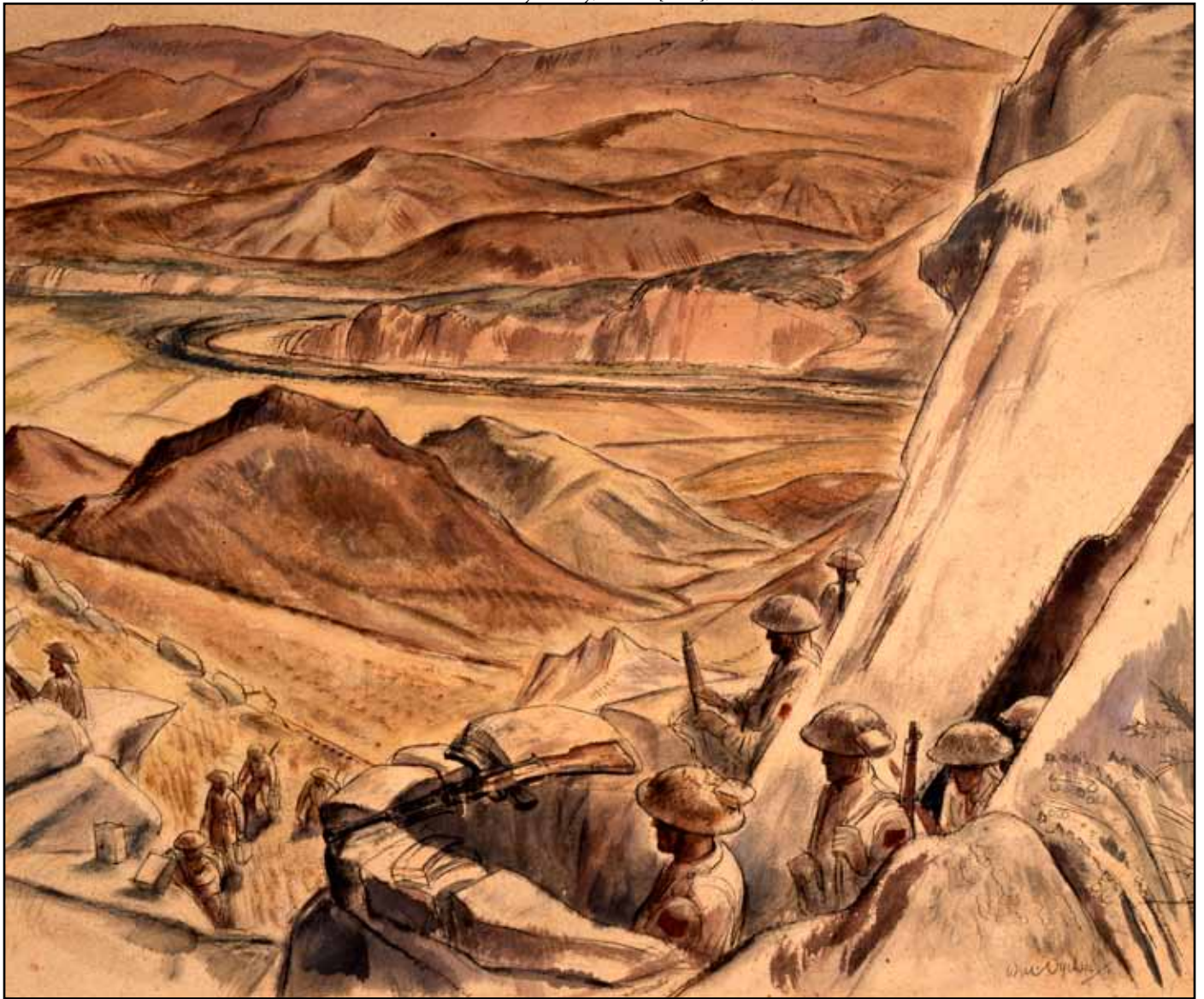
Canadian War Museum 19710261-4640