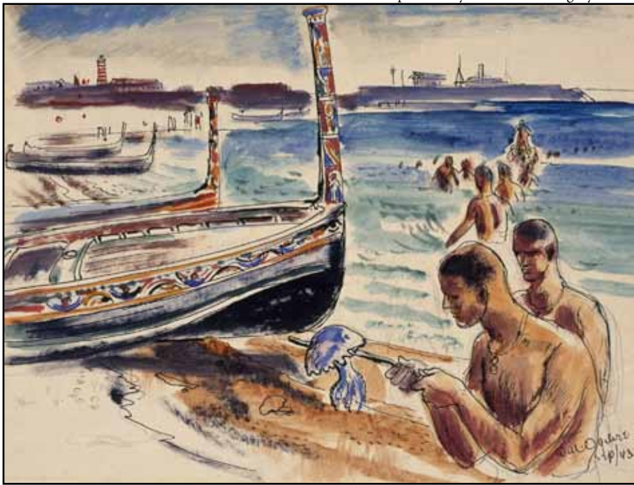
Beach Scene, Catania, Sicily.

contact with those at every level of the military hierarchy. While there can be little debate that artists and historical officers benefitted from the practicality of their own transportation after the campaign in Sicily, perhaps there was something lost in the added convenience.