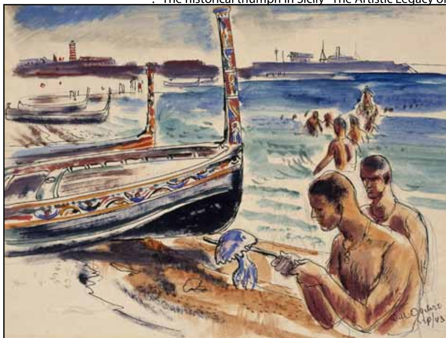
Beach Scene, Catania, Sicily.

contact with those at every level of the military hierarchy. While there can be little debate that artists and historical officers benefitted from the practicality of their own transportation after the campaign in Sicily, perhaps there was something lost in the added convenience.