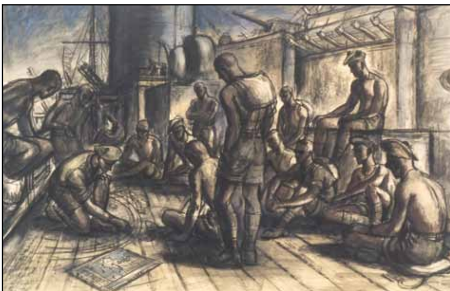
Above: His Majesty's Transport Circassia - 1st Canadian Division.