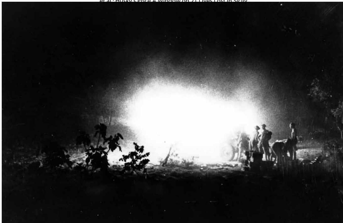
A Canadian 25-pounder crew firing on Nissoria, Sicily.