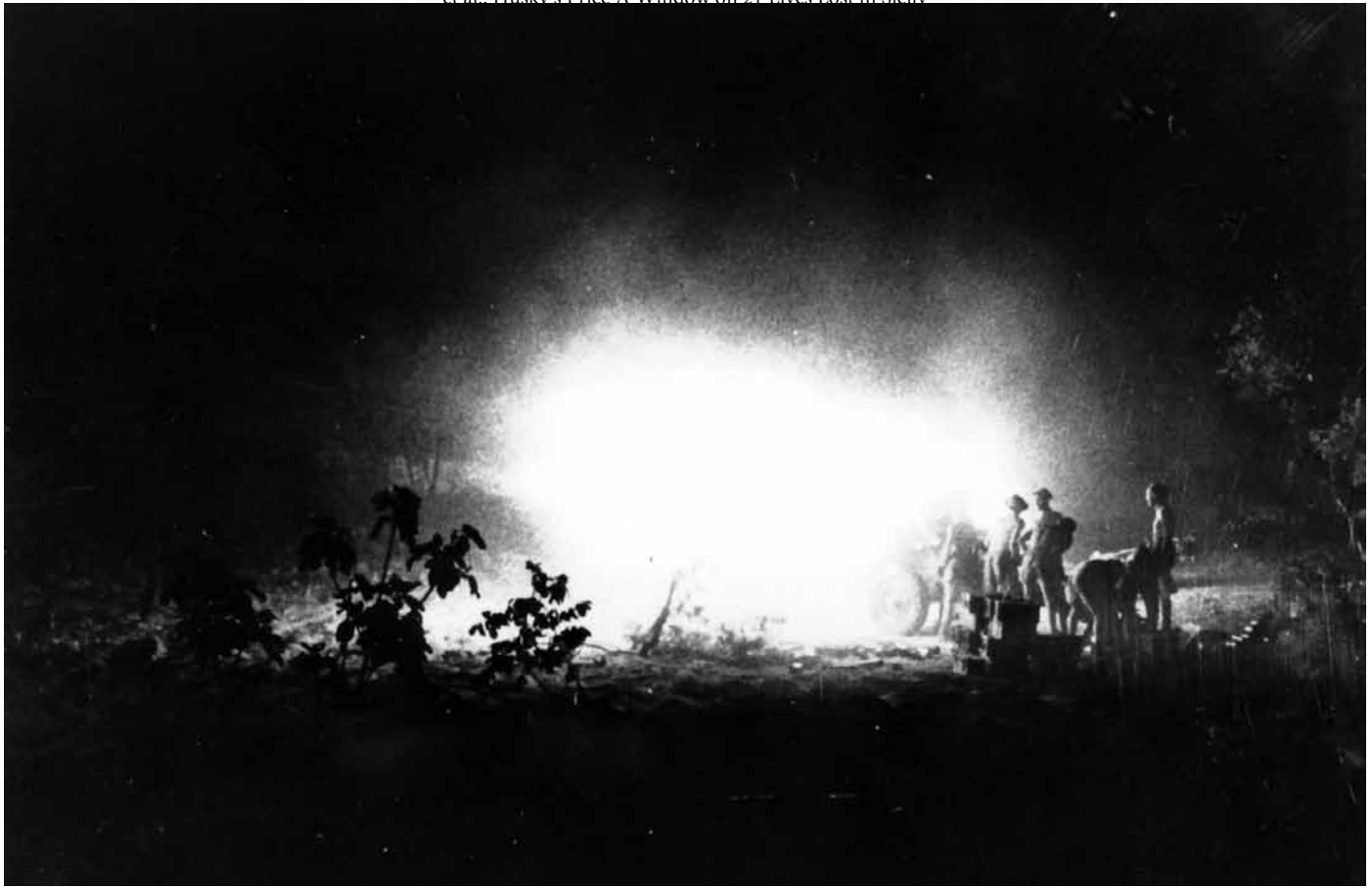
A Canadian 25-pounder crew firing on Nissoria, Sicily.