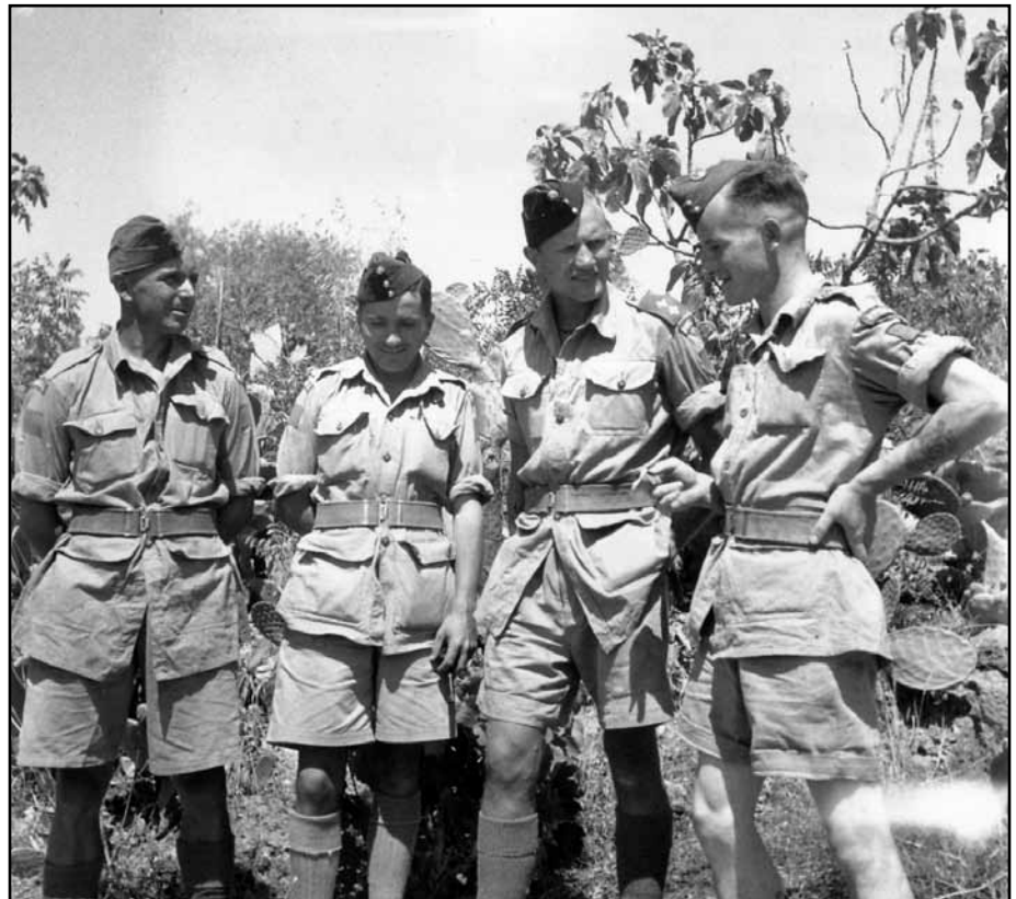
Canadian soldiers in Sicily.