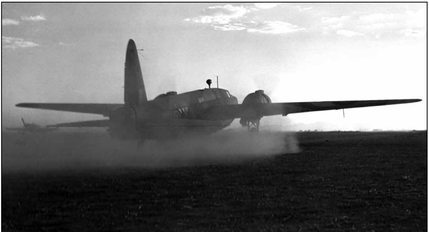
A 331 Wing Wellington departs from its Tunisian base for a mission over Sicily.