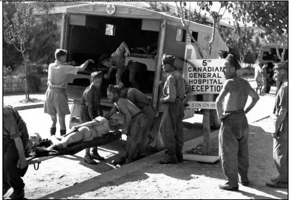
Library and Archives Canada PA 193890

The training included practice landings from assault craft, a demonstration of operating-room technique by one of the field surgical units, lectures on combined operations, the packing of unit equipment on assault scales, and, for drivers, a course in water-proofing vehicles. The methods of setting up an advanced surgical centre and a beach dressing station, using full tentage and equipment, were also studied. The culmination was a small