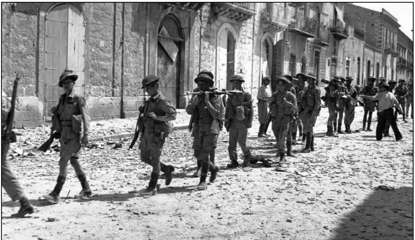
Soldiers of the Princess Patricia's Canadian Light Infantry march through the streets of Valguarnera, Sicily.