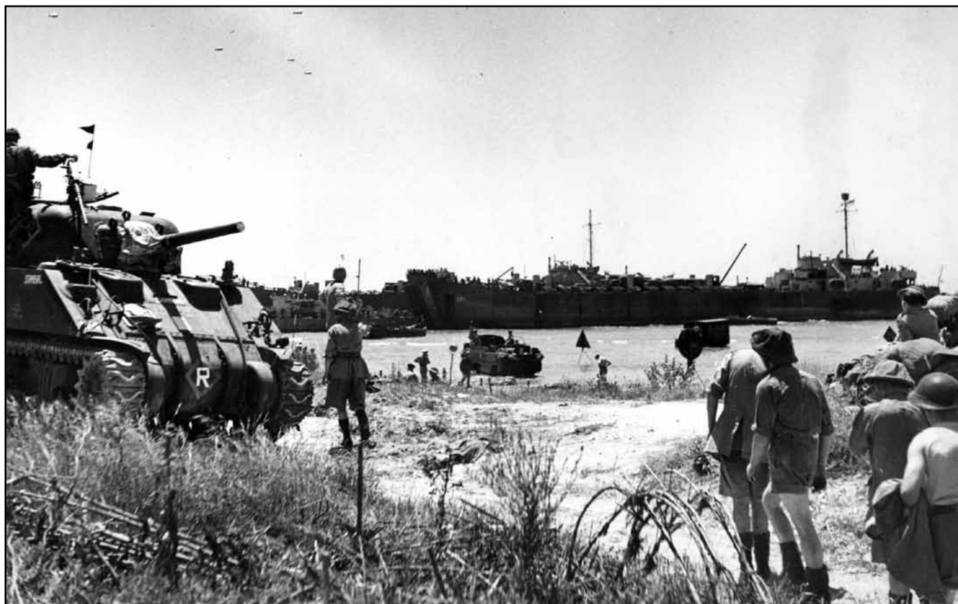
Canadian troops land in Sicily, 19 July 1943.