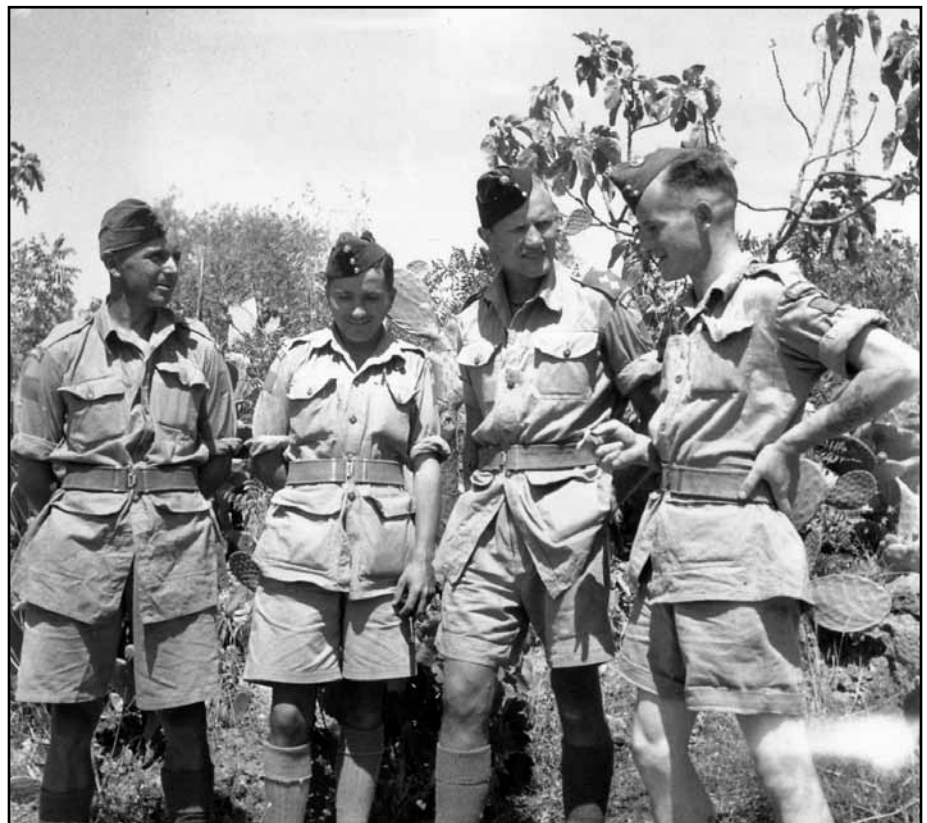
Canadian soldiers in Sicily.