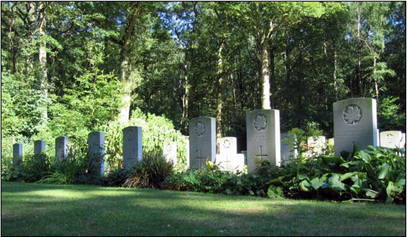
Headstones of Canadian soldiers killed in the Ypres Salient, 1916. Rifle House Cemetery, one of three Commonwealth cemeteries in Ploegsteert Wood.

Somme. It is immortal honour"; "Mort à Vimy à l'âge de trente ans en combattant pour la grande cause"; "Killed near Passchendaele"; "Killed in action at Cambrai"; and one more that reflected the renown won by the Canadians in spearheading the war-winning offensive that began at Amiens on 8 August 1918 – "Tomorrow will be Canada's day." 44 Other epitaphs no less proudly record the soldier's courage in the performance of his duties or the esteem in which his comrades held him: "Died for King and country while keeping line open under shell fire"; "Killed leading an attack at Regina Trench"; "Mentioned in despatches for gallant and distinguished conduct;" "Beloved by officers and men"; "His captain said 'No braver soldier ever led men into battle'" 45 – this last being one of several examples indicating that letters of condolence to next of kin