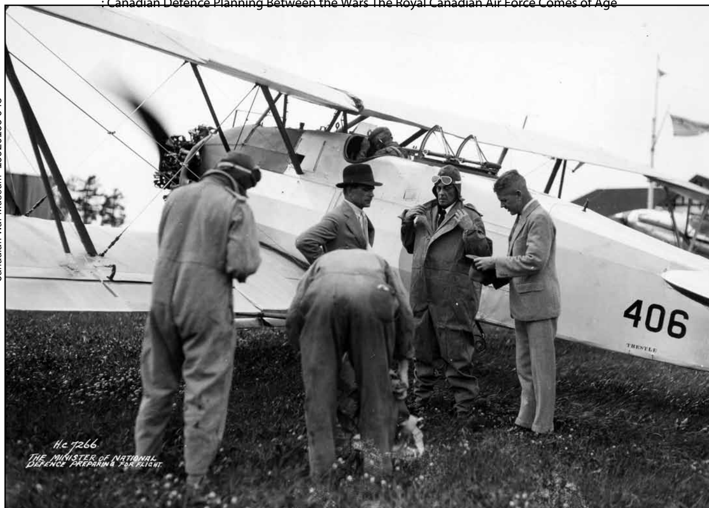
The minister of National Defence, Grote Stirling, prepares for a flight in an Armstrong Whitworth Atlas.

planning throughout the remainder of the 1930s concentrated. Coastal defence included, Walsh noted, "protection of important localities and ports from air raids, defence of the Pacific and Atlantic coasts by means of coast reconnaissance, anti-submarine patrols, co-operation with coast defence artillery, and protection of empire Air Routes and Convoys." 31 Seven Permanent Force squadrons were required to carry out the tasks, four of them controlled by Group Headquarters at Halifax and Vancouver, each with one bomber and one flying-boat squadron. The others were one army cooperation squadron which would maintain contact with the latest doctrine and equipment in the United Kingdom and provide a training cadre for Non-Permanent army cooperation squadrons required on