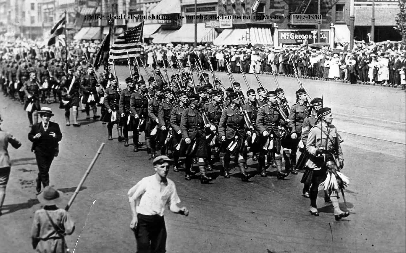
A marching contingent from the 48th Highlanders of Canada is greeted by large crowds in a US city, probably Chicago, circa 1917.