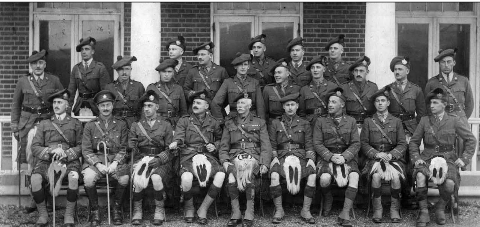
Officers of the Maclean Highlanders pose for a photo with the chief of clan, General Hugh Fitzroy Maclean (seated centre). In New England, the commanding officer of the 236th MacLean Highlanders not only recruited for his own battalion but also the BCRM in June-July 1917.

Whether or not the reciprocal convention had any effect on the manpower pool is impossible to determine although it appears that the CEF had the short end of the stick. In the United States, the Provost Marshal General estimated that about