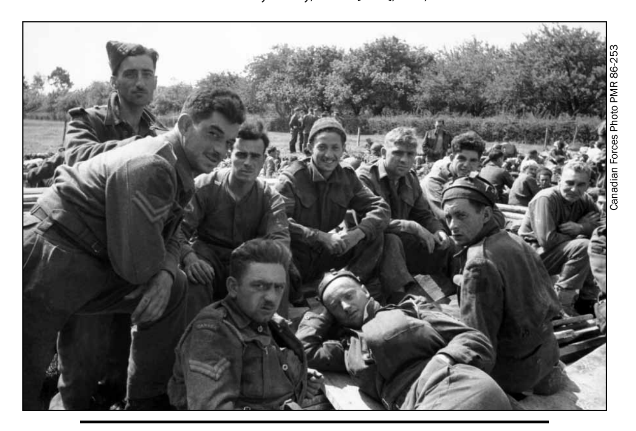
A German photograph of a group of Canadian soliders captured at Dieppe. It is believed that these men are from the Fusiliers Mont-Royal based on their shoulder patches.

two regiments lost in fifteen days [at Hong Kong] or the thousands of men sent to their death in five hours [at Dieppe].<sup>65</sup>