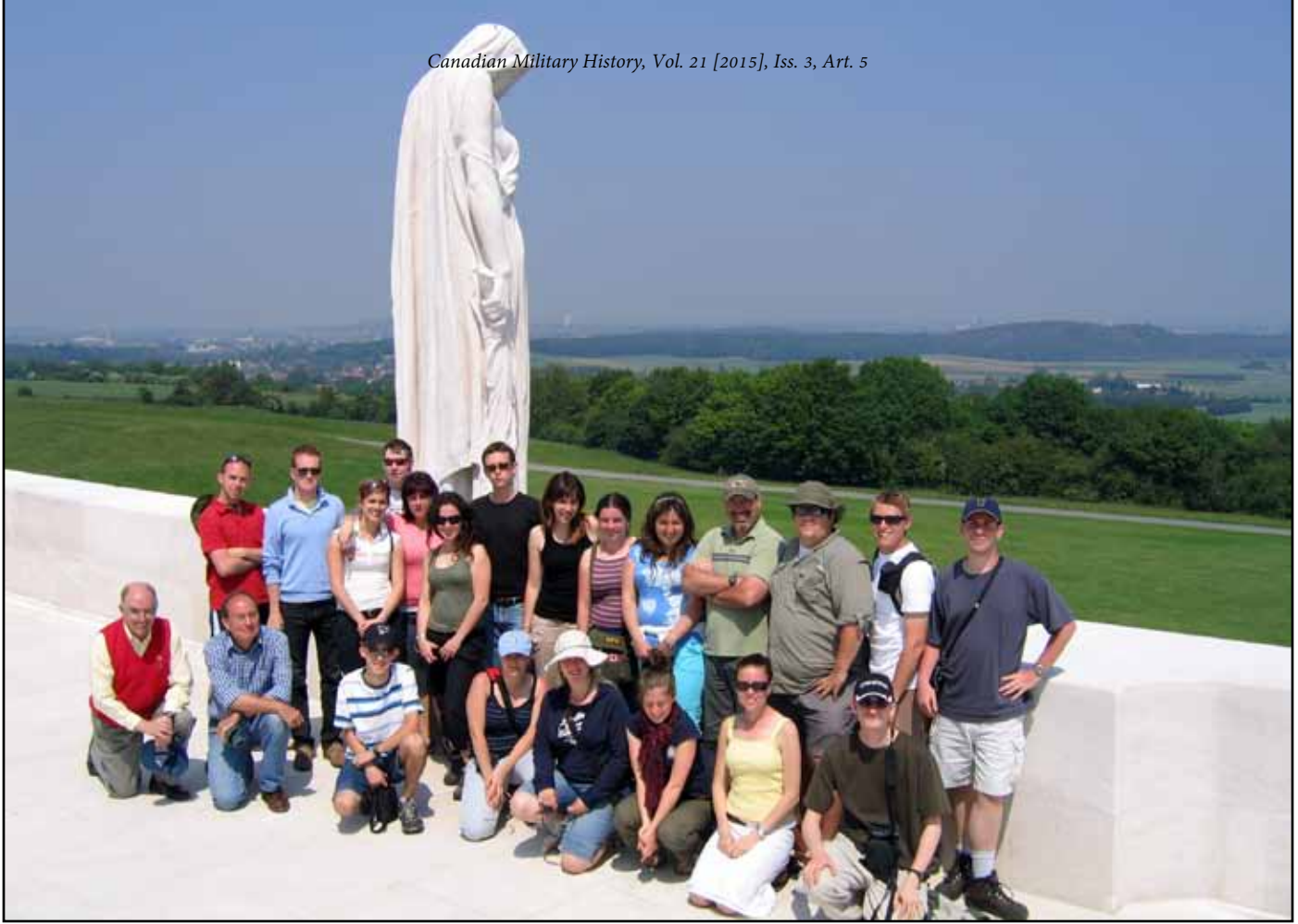
A battlefield study tour group stops at Vimy.

fields of war. A vast monument grew from fiery speeches and shrill commitments against forgetting, its ramparts and soaring figures facing down now-invisible foes, towering above the ghosts of those in whose name it so elegantly stood. Life and commerce and farming soon resumed, but only around Vimy's demarcated margins, the stone evidence of war and remembrance striking upwards like an iceberg's tip amidst the fields, its base grounded far below, in the sullied dirt of violent times.