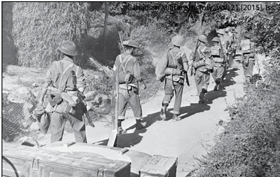
Infantrymen of the 48th Highlanders of Canada advancing on Point 146 during the advance on the Gothic Line near the Foglia River, Italy, 28-29 August 1944.

NCOs to 1 CBRD to assist in the training of personnel remustered to infantry. 50 Other operational units almost certainly did likewise.