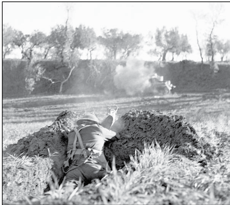
Library and Archives Canada PA 205264

By and large the reinforcements arriving at the 48th Highlanders during the first ten months of 1944 spent enough time training in Britain and Italy to be reasonably well-prepared for combat. This contradicts the mass of anecdotal information which maintains that the army rushed reinforcements into battle before they were ready. Nonetheless, additional research regarding reinforcement training is required to confirm or refine the results presented here. The examination of a larger sample of data, such as for all three infantry units in the 1st Canadian Infantry Brigade, would be valuable. Further