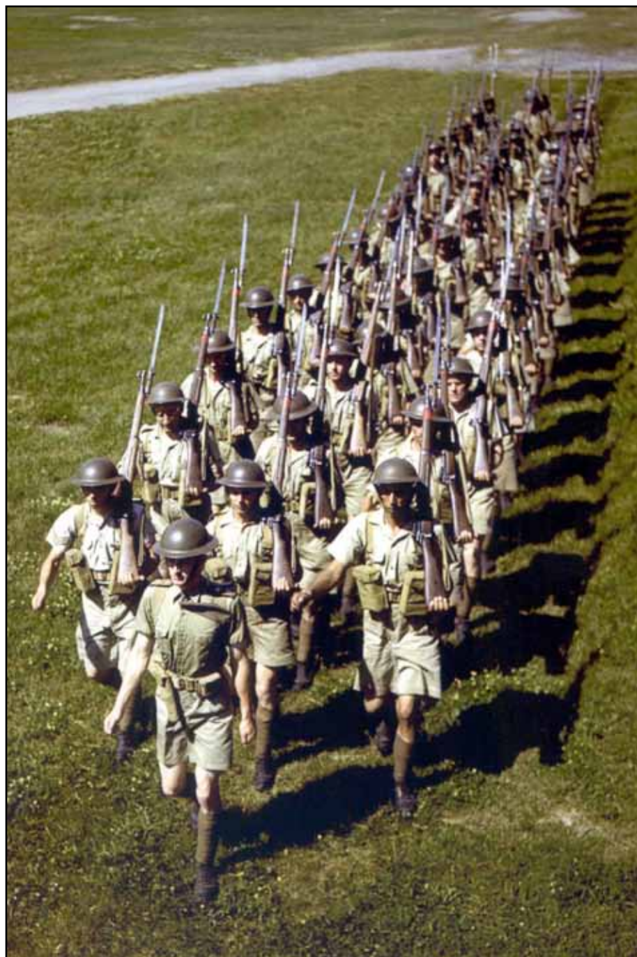
Canadian Forces Joint Imagery Centre ZK 246

"basic refresher courses" of two, four and six weeks duration, and one "advanced training" course. 16 In March 1944, all CIRUs implemented a mandatory two-week refresher course for all new arrivals. All soldiers who completed the course then had to pass weapons handling tests, known as Tests of Elementary Training (TOETs). Soldiers who failed the tests received further basic training, while the rest continued to receive advanced refresher training while awaiting call-up for service in