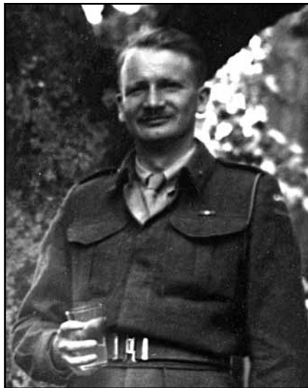
Library and Archives Canada PA 145558