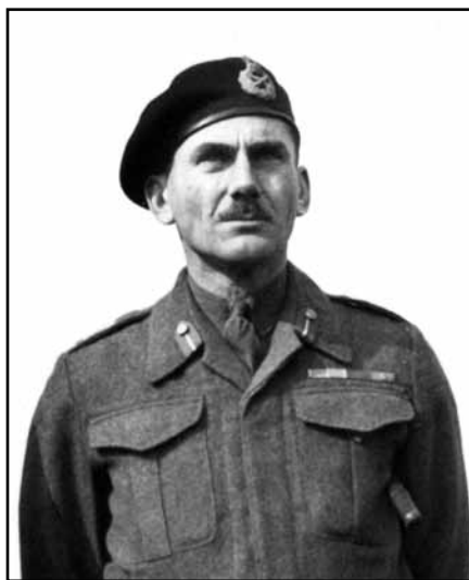
Library and Archives Canada PA 132650