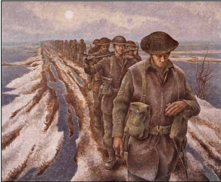
Alex Colville – Infantry Near Nijmegen .

place, in time, though one lives and one has died. I have meant for the key which dangles below his index finger to ask the question, as facile as it may seem: What is the key to all this? The time of the hit, 1325h is lodged between the forearms of the two men. The bomber's face is hard to decipher. It can be read as a visceral mess too. The distressed G-Wagon moves through the upper chest of the Canadian soldier and leads to the medics and soldiers providing initial stabilization to the injured soldiers...Other things are intentionally obscure. Coming out from the LAV III tire are the three hands of two investigators. It is hard to make them out. This is addressing the subversive requirements of intelligence work.