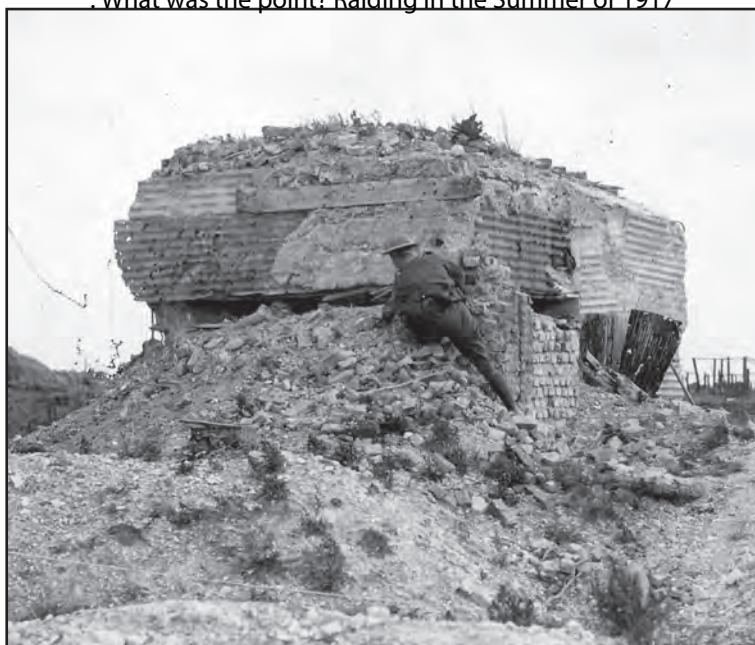
A German bunker near Lens, photographed in September 1917.

During July and the first three weeks of August, raids were dispatched into Lens by one or more of the 4th Division's 12 infantry Battalions about every three days. One private boasted before the attack that "we even know the names of the streets we are to march up and the actual houses we are to mop up" but the troops were mistaken in their belief they had a good feel for the lay