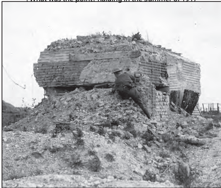
A German bunker near Lens, photographed in September 1917.

Some raids might suffer no casualties at all, such as one on 12 August by the 38th Battalion, though this was a rarity. 39 Examination of the war diaries of the battalions of the 4th Division confirms that the raiding parties usually suffered five or six casualties, though there are instances of much heavier losses. An 87th Battalion raid on 1 August miscarried when the Germans became aware of its presence and dropped gas shells on top of the men, inflicting eleven casualties. 40 In another instance, from the 102nd Battalion's war diary: "a raiding party proceed[ed] up the road ...the crater was entered and their [sic] in successfully bombed, but the lip of the crater facing the wrong way we had no cover and were compelled by heavy machine gun and rifle fire to withdraw." 41 The casualties suffered were four other ranks killed and seven wounded. 42