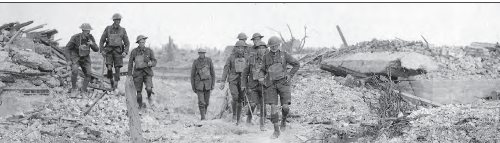
Canadian soldiers examine concrete German gun positions in the destroyed suburbs of Lens following the battle.

The number of troops assigned to a particular raid during the summer of 1917 varied, usually from eight to 30 men. In what was typical for the organization of small raids at the time, on 29 July the 54th Battalion sent out a party comprising one non-commissioned officer, two riflemen, two rifle grenadiers and three bombers. 37 A larger raid would have committed a force of about 30 men led by a lieutenant but