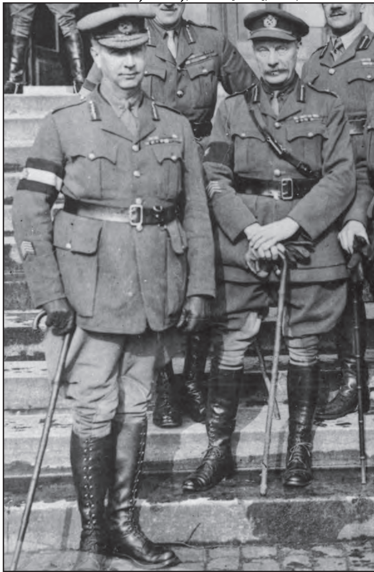
Lieutenant-General Arthur Currie, commander of the Canadian Corps (left) and Major-General David Watson, commander of 4th Canadian Division, both supported trench raids.