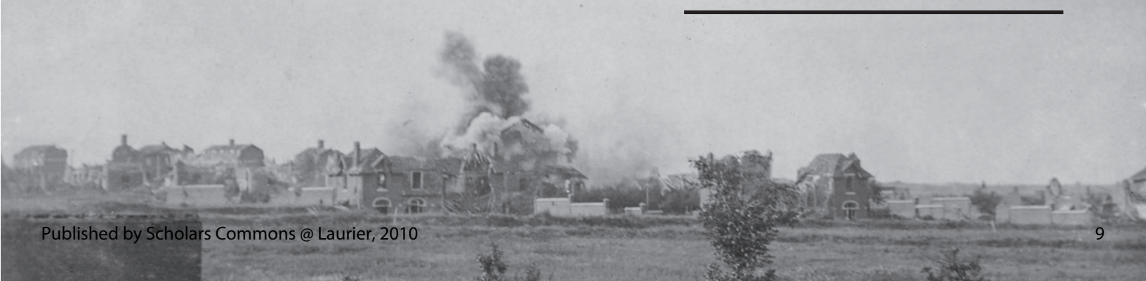
A shell bursts in the outskirts of Lens, August 1917.

This paper solely analyzes a six-week raiding campaign carried out by the 4th Division of the Canadian Corps at Lens in 1917. To establish if these conclusions have validity over a longer period – in other words, that raiding did not serve as vital a role in the CEF as much of the historical wisdom asserts, and that there would have been few adverse effects on the corps' operational effectiveness if it had been reduced or perhaps even eliminated – would require a far more extensive study of raiding operations. What is clear, however, is that the paradigm that raiding was a worthwhile activity must be questioned, as Canadian military historians have recently begun to do. Yet arguments that there was a cult of competitiveness in the Canadian Corps and that raids lost their effectiveness because of increasingly reckless behaviour do not seem relevant in this particular study. The 4th Division raids were carefully planned and carried out with specific goals in mind over a period of weeks. They were viewed as successful, and the information garnered from the raiders was used – it just happened to have had very little of value. It is worth noting that in the summer of 1918, the Canadian Corps did not partake in raiding leading up