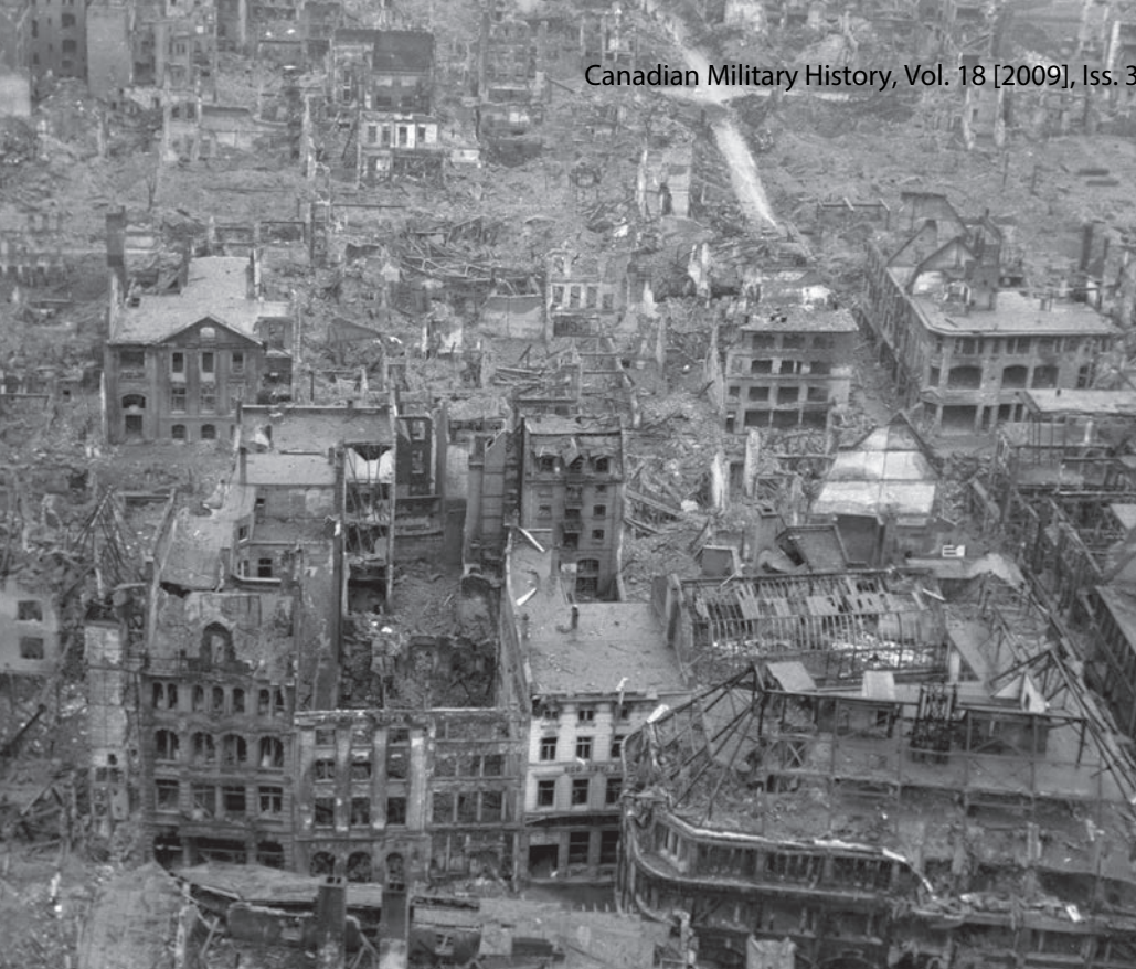
German cities were hard hit from the air, as these postwar photos of Cologne attest.