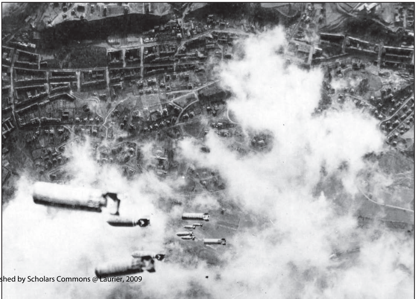
US Army Air Force heavy bombers drop high explosive and incendiary bombs on Dresden, 15 February 1945.

But I would not undervalue the usefulness of having a participant trained, as an historian, consider this matter. On a topic like this one is inclined to get views on air war