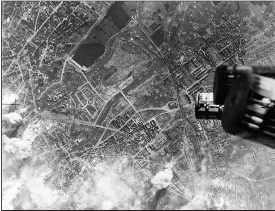
A group of cluster bombs falling towards Hanover, Germany, 25 March 1945.

Airmen, in fact, believed what they wanted. In Spain the horrors of