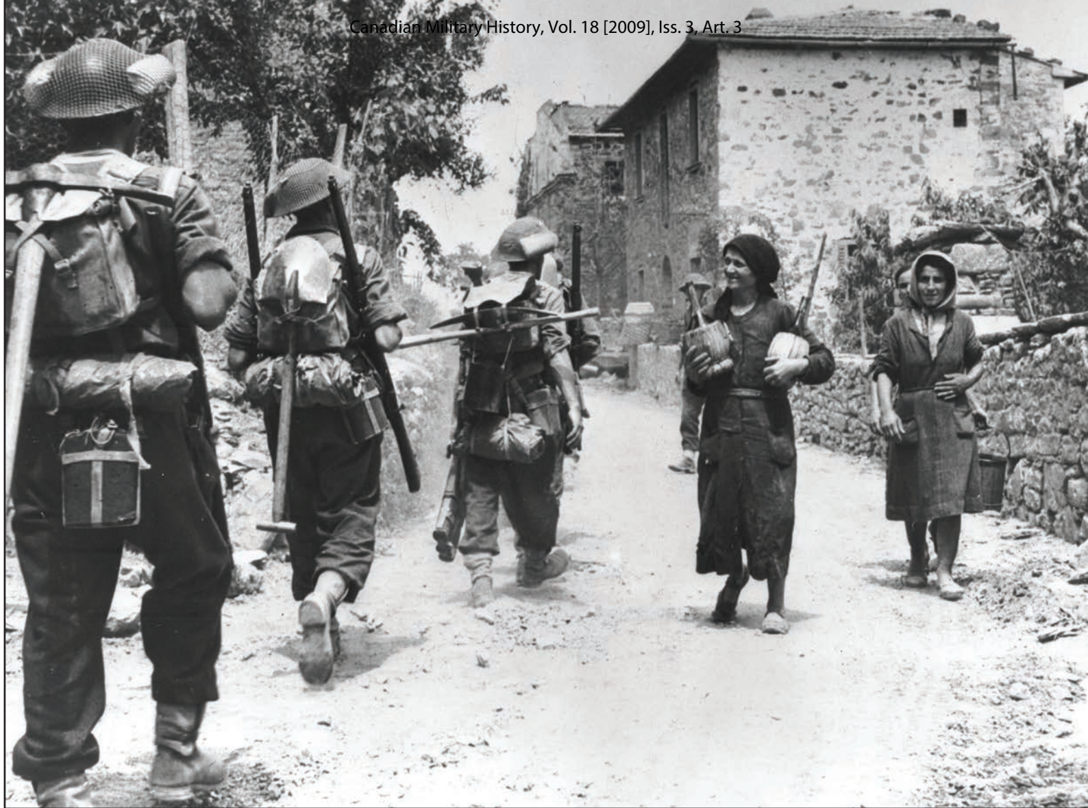
Canadian troops enter the village of San Pancrazio, Italy where the previous week German soldiers had massacred the male inhabitants. The “D-Day Dodgers” fought a gruelling, attritional campaign in Italy where they served in the shadow of events in Northwest Europe, but they were well served by efforts of 1st Canadian Field Historical Section to record their accomplishments.

movement, including blown-bridges, steep roads, vineyards, orchards, stream networks, mountain ranges, narrow valleys, and the ubiquitous and capricious German 88s.