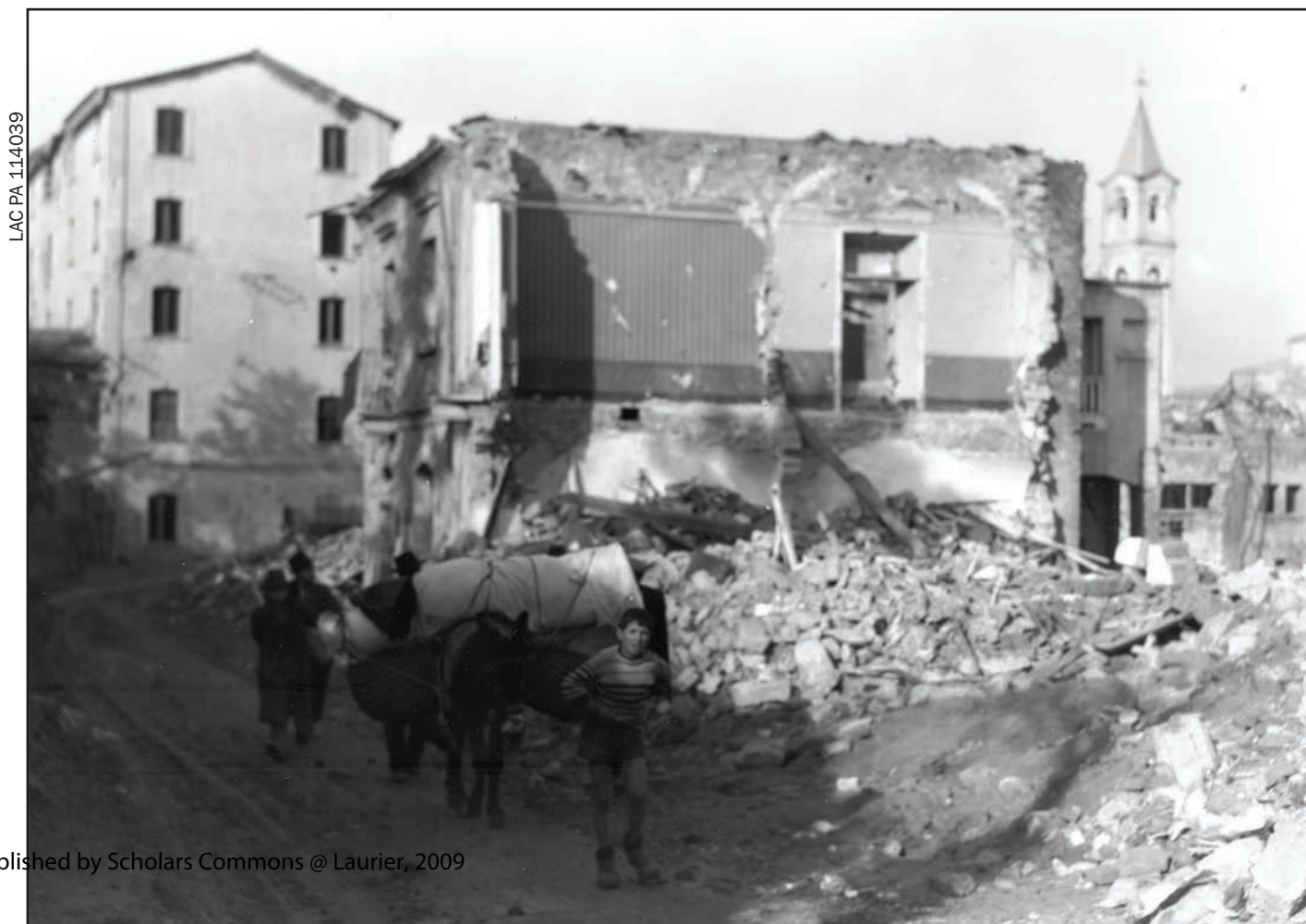
Refugees returning to the ruins of Ortona after the battle, January 1944.