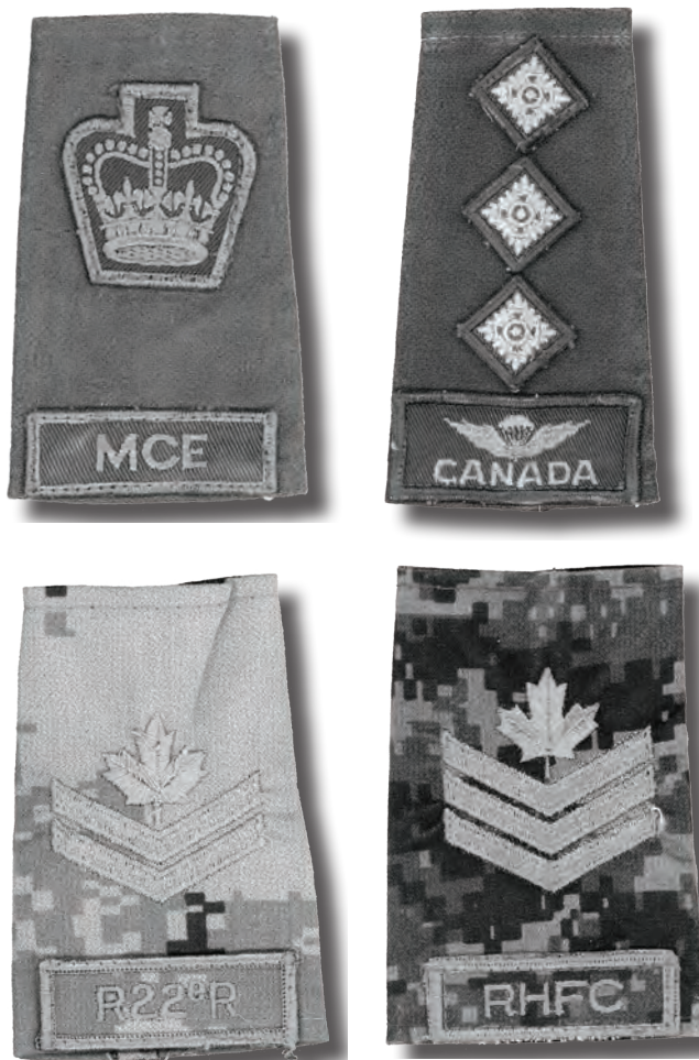
Examples of Canadian Forces shoulder titles (clockwise from top left):

Since 2002, the Canadian Forces, in conjunction with NATO, has been conducting military and reconstruction operations in Afghanistan in order to control insurgents and help bring security and stability to that nation. When initially deployed to Afghanistan, Canadians were wearing CADPAT TR (Temperate Region) green uniforms. By 2003 Canadians were wearing CADPAT AR (Arid Region) tan uniforms which were more fitting for the terrain of the region. Originally these uniforms were identical in cut and style to the CADPAT TR versions. There was a need for more pockets on the upper sleeves and a requirement to wear infrared reflecting Canada flags and patches which led to large pieces of Velcro being added to these new sleeve pockets in order to secure the badges. These large Velcro patches created room for other, non-regulation, "theatre-made" insignia.