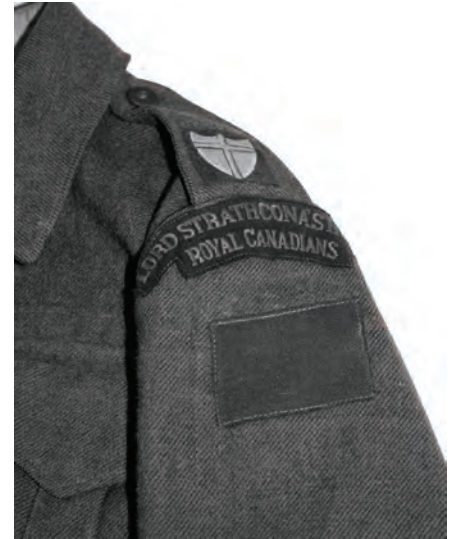
Distinguishing patches of the Lord Strathcona's Horse (Royal Canadians) in the Second World War. The rectangular patch is maroon for the 5th Canadian Armoured Division.

Following the end of hostilities, repatriated troops, like their father's generation, wore their distinctive formation patches home as a symbol of pride in their overseas service. With rapid demobilization of the army, the formation patches fell out