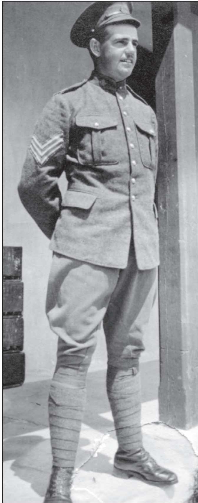
Regimental Museum of The Cameron Highlanders of Ottawa

The 38th Battalion arrived in Bermuda on 12 August 1915,