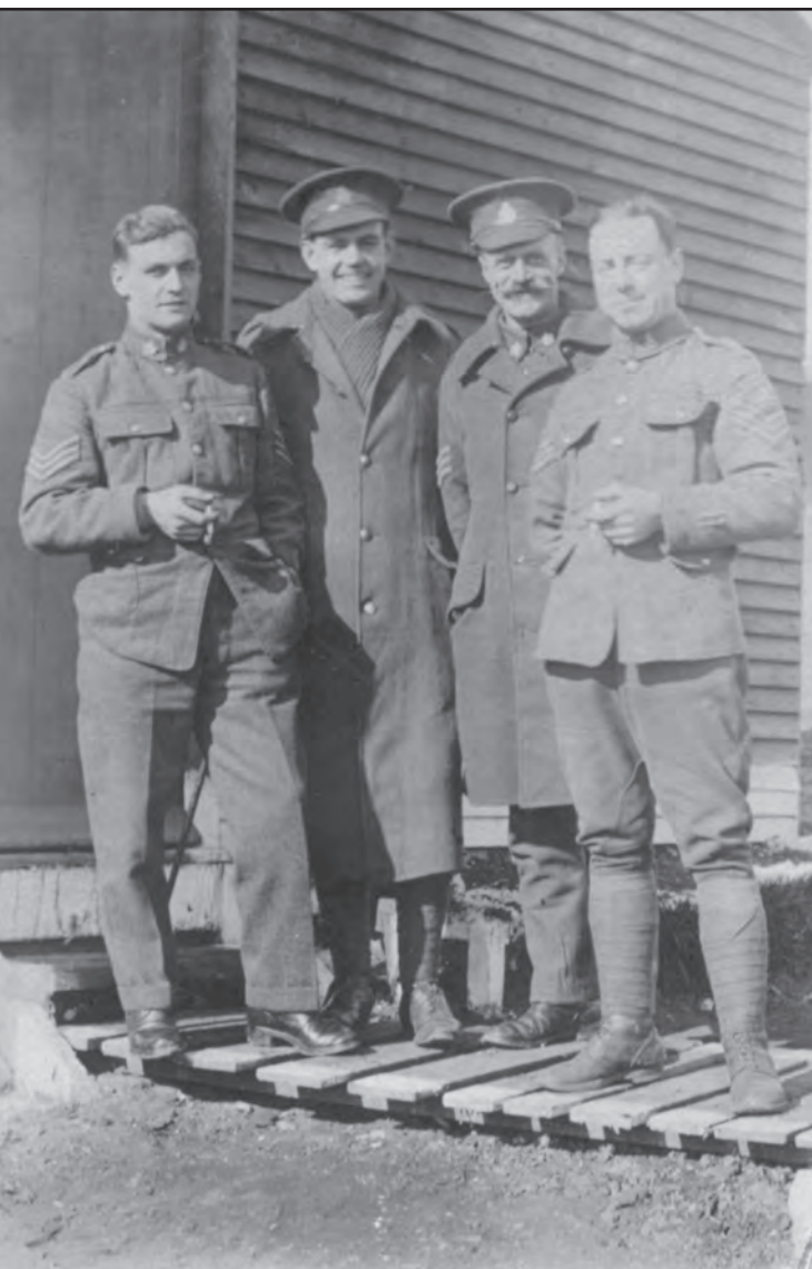
Regimental Museum of The Cameron Highlanders of Ottawa