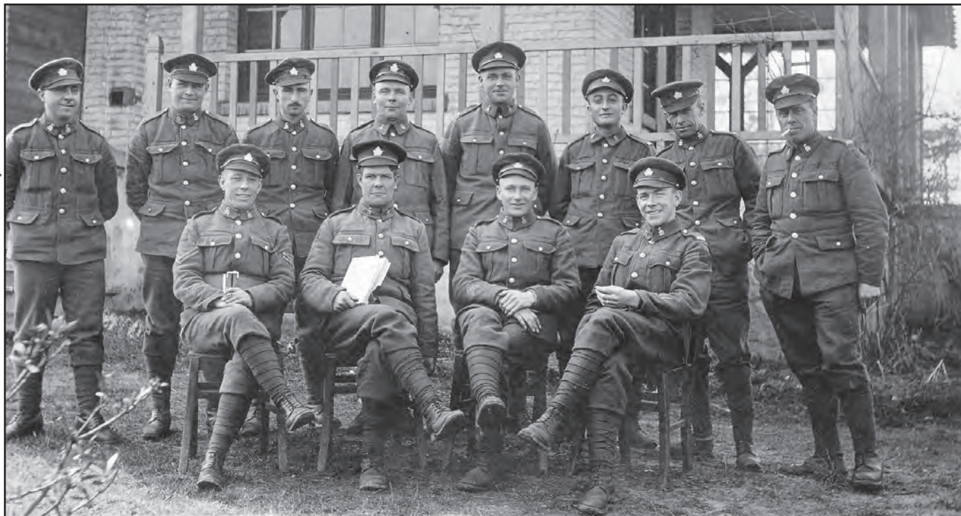
Unidentified members of the 38th Battalion, CEF.

of the 38th Battalion? Think blog as mini-encyclopaedia. The result, Soldiers of the 38th < 38thbattalion.blogspot.com >, is, as I've written on its masthead, an "attempt at an ongoing mass biography of the officers and men of the 38th Battalion, Canadian Expeditionary Force, during the First World War."