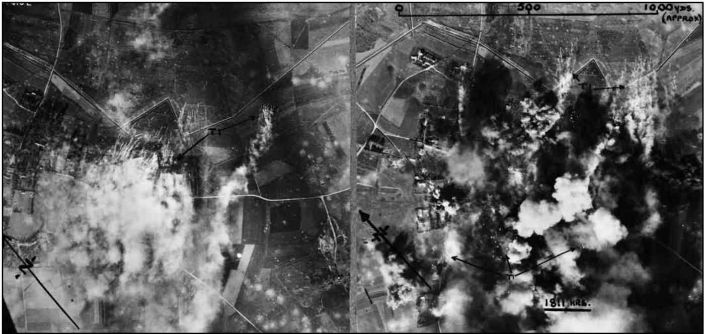
Above: Daylight attack on the area north of Le Havre on 10 September 1944. The anti-tank ditch is visible crossing at the top. The image on the left shows the target indicators (T.I.) while the image on the right shows the later bombing concentration.

statements they did make I should not have discussed the matter any further; in the circumstances I felt, before returning, that it would be as well to make some enquires of my own. It was as well I did. Subsequently I gathered an entirely different viewpoint.