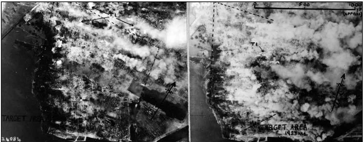
Below: Aerial photos of the second wave of the RAF attack on 5 September. The devastation from the first attack is clearly visible at 1900 hours (left) prior to the bombing concentration of the second attack 20 minutes later.

Atlantic Wall and, as far as I could see, were practically intact.