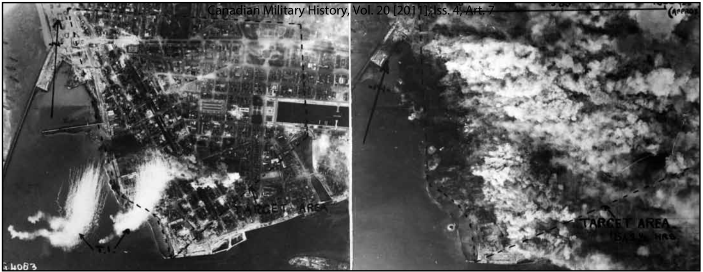
Above: Aerial photos of the first wave of the 5 September 1944 RAF daylight attack on the port area of Le Havre. The image on the left shows target indicators (T.I.) falling at 1808 hours while the photo at left shows the concentrated bombing at 1848 hours.