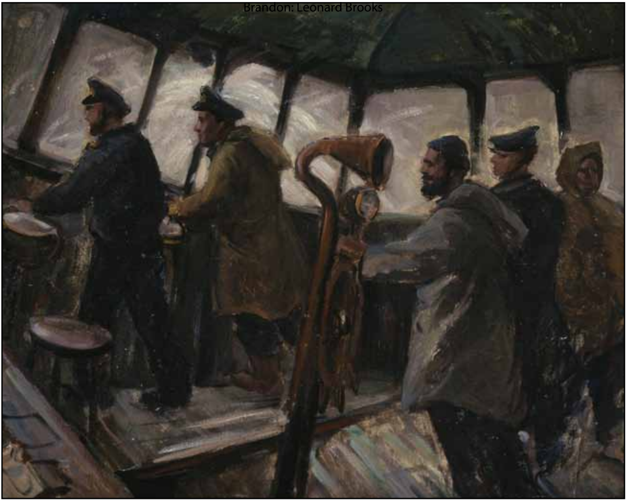
Rough Weather, Minesweeper Bridge (above); Motor Torpedo Boat Base, Felixstowe (below)