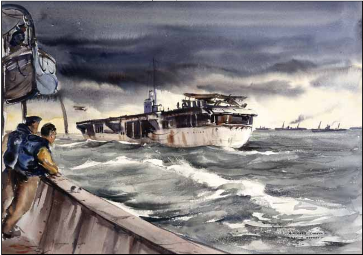
Aircraft Carrier, Atlantic Convoy (above); Peeling Potatoes (below)