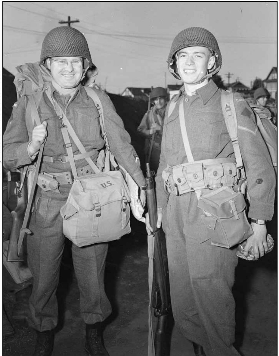
A Canadian officer (left) wears the Second World War service chevrons, while the soldier (right) wears the GS badge. CANADA titles are visible on each man's battledress tunics. These men are members of the 13th Infantry Brigade Group taking part in Operation Cottage, the invasion of Kiska, summer 1943. The 13th Brigade operated under American command at Kiska, and was issued with largely American kit. These men wear Canadian battledress and carry Canadian respirators, but their helmets, rucksacks, and field equipment are otherwise of American pattern. The officer is armed with an American carbine; the soldier is armed with a Canadian rifle.

authorized to wear their chevrons until October 1941 when the practice was discontinued in the Active Army. However, members of the Veterans Guard of Canada were permitted to wear their Great War chevrons until January 1943. 43 Interestingly, British soldiers who earned overseas chevrons during the Great War were