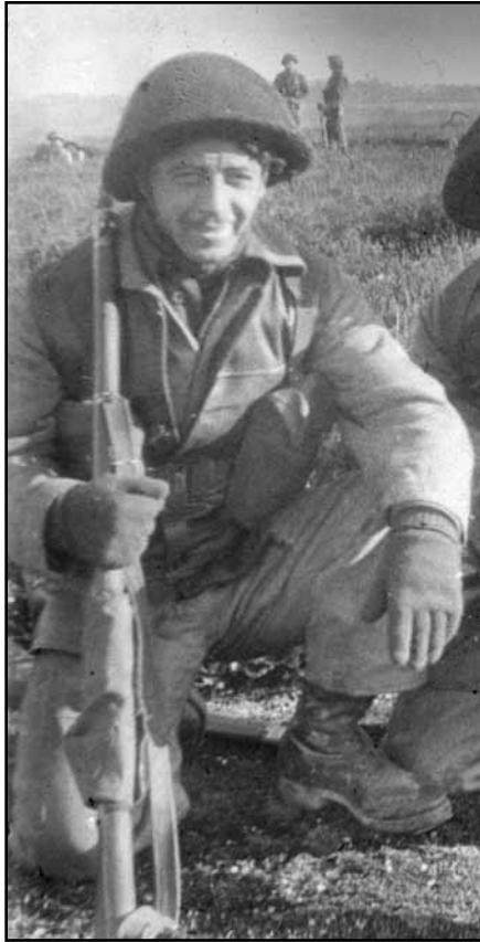
Westlake Family Papers