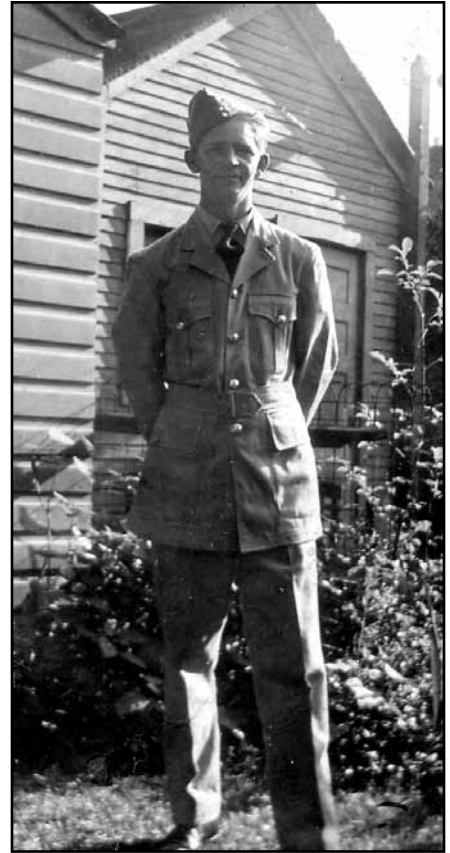
Westlake Family Papers