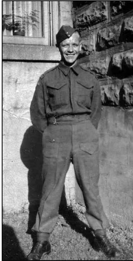
Westlake Family Papers