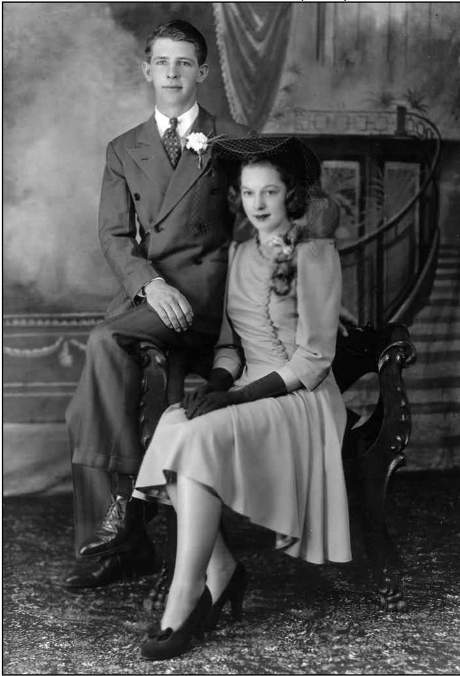
Westlake Family Papers