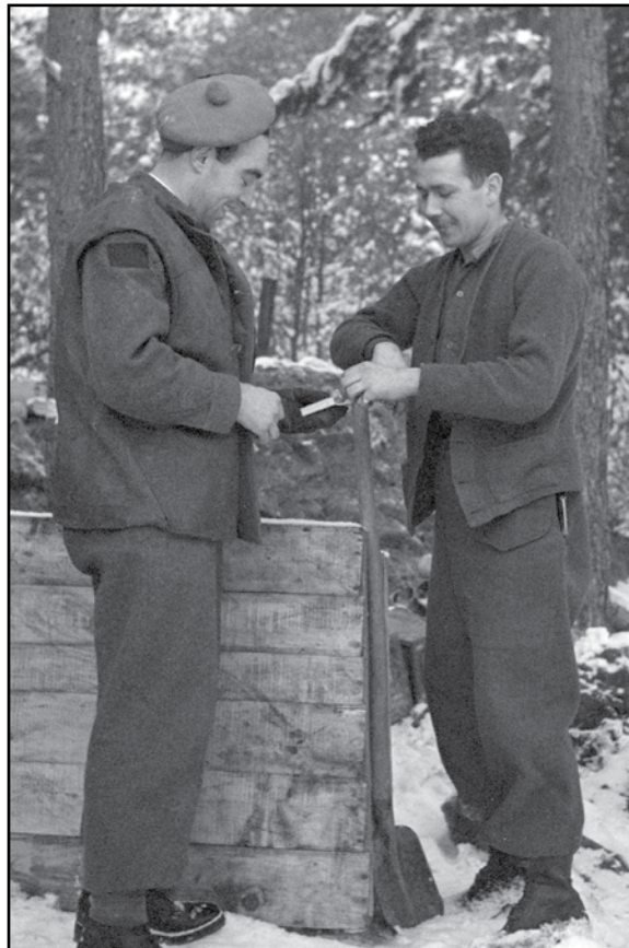
Top: The Putte Delft china plate is now on display at Laurier House in Ottawa.

An examination of the men's military service files allows us to glimpse what Cardy knew about them. They had all been born in Canada, hailed from urban and rural parts of five provinces and ranged in age from 19 to 36. Four were married, while one was divorced. Ten were Protestant and two Catholic. The least educated had achieved grade two, while none had completed high school. One had joined in 1939, but most had spent less than two years in uniform. None had taken part in the Dieppe raid or risen higher than lance corporal. Only two had been charged with minor military offences and none was ever decorated for conspicuous service. In other words, any