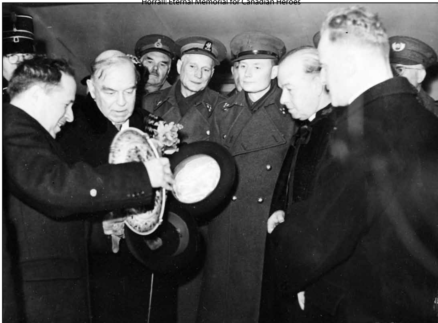
The mayor of Putte (left) presents the Delft china plate honouring the 12 men of the Essex Scottish Regiment killed in the liberation of their village to Prime Minister Mackenzie King, 12 November 1947.

1945, King had not yet visited Belgium or the Netherlands. He arrived in Brussels on 10 November to accept an honorary degree from the city's Université Libre on behalf, as he put it, "of the people of Canada and as a sign of the abiding friendship and good will between our countries." On the following morning King took part in Belgium's national Remembrance Day ceremony, telling his royal hosts at dinner that night that he accepted that country's honours on behalf of Canada's armed forces. 45 He received a second degree on the 12th, proclaiming to the University of Louvain that the honour attested to the "place her (Canada's) sons held in the hearts and minds of the people of this land in their struggle for freedom," and insisting he would