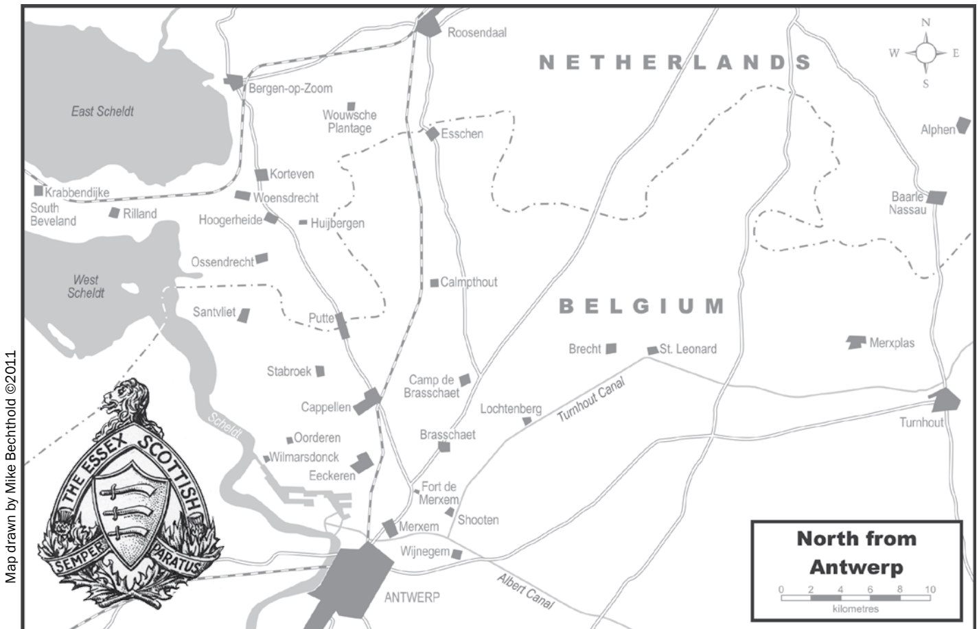
Map drawn by Mike Bechthold ©2011

By mid-afternoon the Essex Scottish had advanced approximately ten kilometres and established their headquarters in the town of Stabroek, while four kilometres to the south-east, the 4th Field Regiment, Royal Canadian Artillery, set up its guns near the town of Cappellen. The day’s