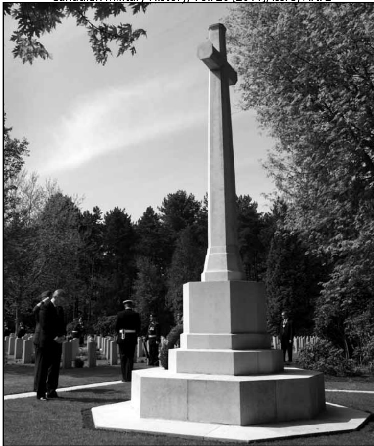
Prime Minister Stephen Harper pays his respects during a May 2010 visit to the Bergen-op-Zoom Canadian War Cemetery in the Netherlands

The intervening years have compounded this difficulty by obscuring the men's names, their connections to one another, and to the town they liberated. Putte does not hold a place in the Canadian public memory, leaving little impetus to trace the ways in which it has been commemorated. The silver plaque is affixed to the back of the plate, meaning that when it is displayed, the dedication and the men's names are not visible. Though the men served in a single regiment, they hailed from disparate parts of a vast country and are buried in three different sections of the Bergen-op-Zoom cemetery. Their military service files are preserved in the National Capital Region, geographically close to the plate, but they are part of an alphabetically