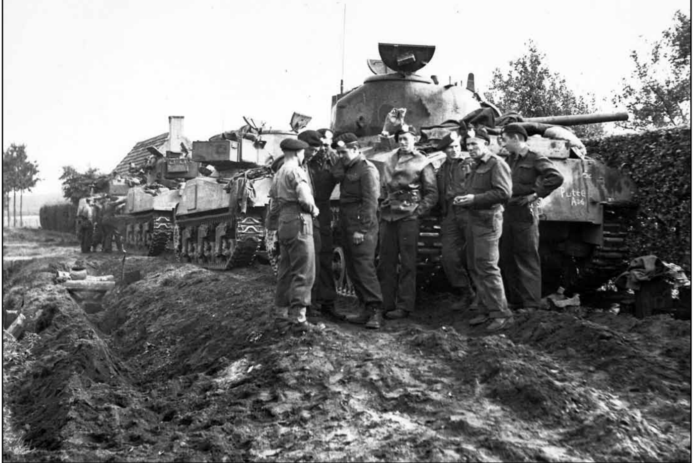
A line of Sherman tanks from the Fort Garry Horse sit outside of Putte on 6 October 1944.

the sight of malnourished children and as one veteran remembered, it "was like crossing from daylight into darkness....Until we crossed into Holland, we had never seen starvation." 25