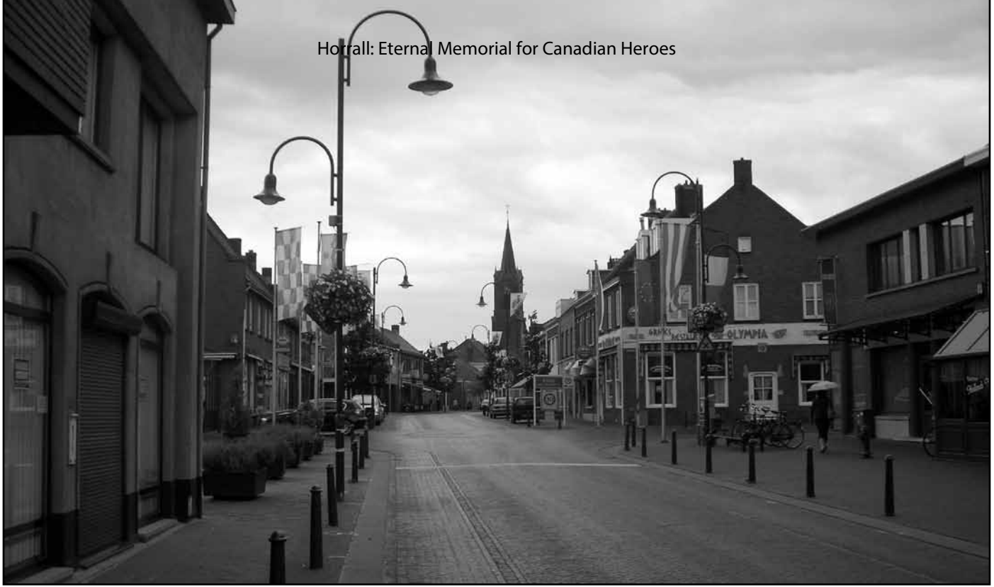
Looking north along the main road through Putte as it appeared in 2007. The Belgian-Dutch border crosses the middle of the photo and is marked by the flags on the right. The Essex Scottish advanced up this street clearing German machine gun nests before entering the Netherlands at the intersection. The street entering from the left is Canadalaan, "Canada Avenue."

one of them could have illustrated the average Canadian soldier. Their heroism was not embedded in individual deeds, but in having died on military service, which Canada had recognized by interring them among their comrades at Bergen-op-Zoom. At the same time, Cardy perceived that by dying together, these otherwise unexceptional men had imprinted themselves lastingly on a small town that they had seen at most for a few terrifying hours, and where they had been buried for over a year. They were: