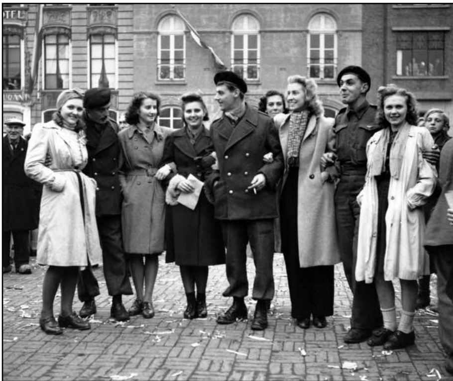
LAC PA 137920