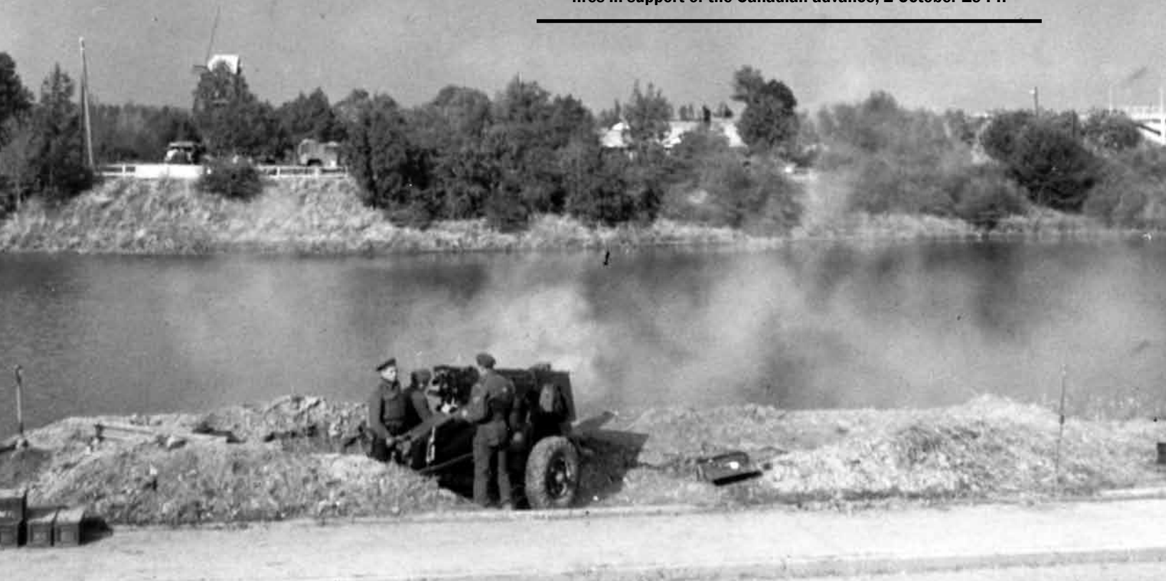
A 25-pounder on the bank of the Scheldt River north of Antwerp fires in support of the Canadian advance, 2 October 1944.

Canadian newspapers briefly trumpeted the place where the nation’s forces had first entered the Netherlands, causing one wit to send this quip to the Toronto Star : “The Canadian Forces have reached Putte. But they won’t stay Putte.” 23 He was right. On the bright sunny morning following the battle, the Essex Scottish began clearing the fields to the east of town, while other units pressed north towards Woensdrecht. The war became grimmer with these first footsteps on Dutch soil, because by deliberately flooding the country’s agricultural heart, the Germans had caused acute food shortages. 24 Troops were shocked by