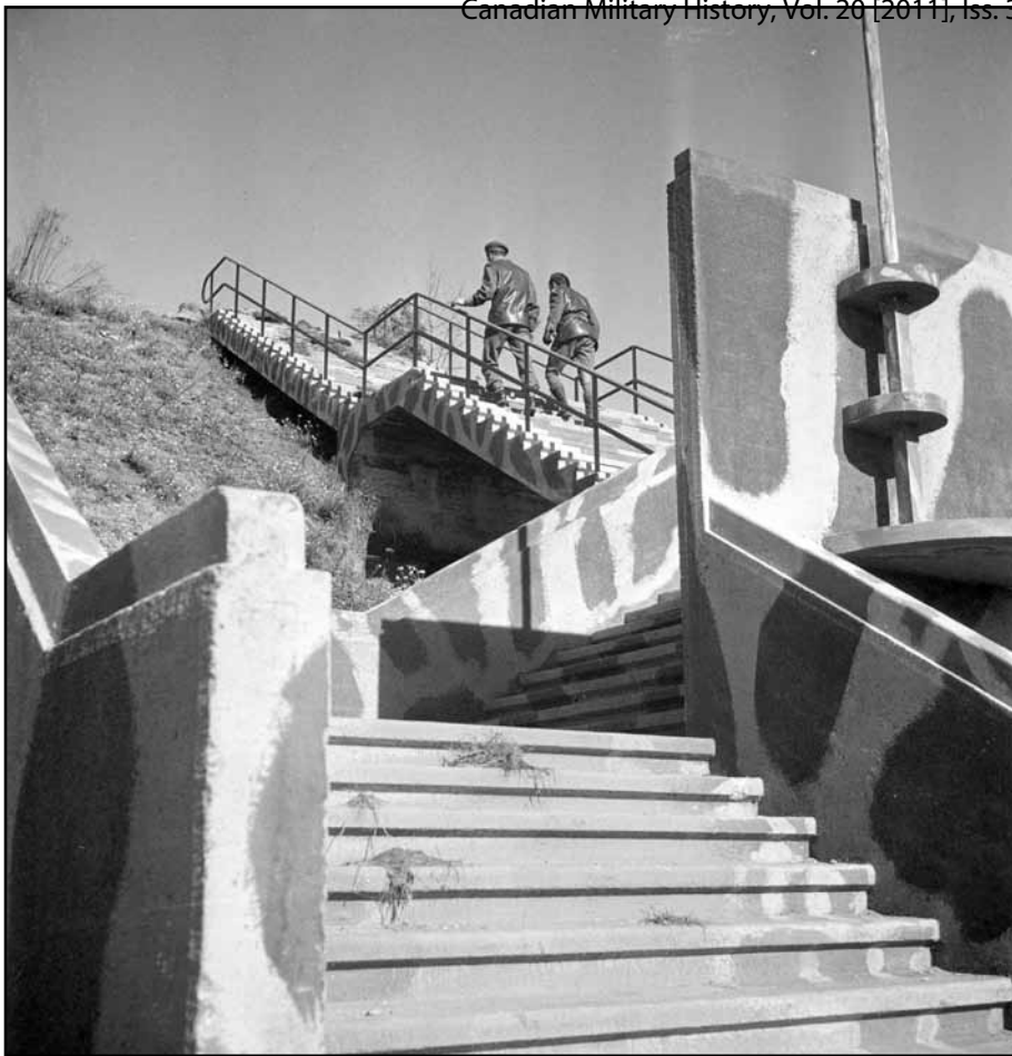
Library and Archives Canada (LAC) PA 168683