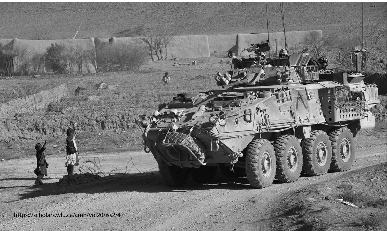
Local Afghan children wave as Canadian soldiers from Task Force Kandahar pass by in a LAV III, January 2011.

DDGM started manufacturing the first batch of 240 LAV-III's for the Canadian Forces in 1998, and a wargame that same year, "Iron Renaissance," compared the LAV-III against the other APC of the Canadian Army, the M113. The study found that the LAV-III was much more effective and versatile than the M113 despite some limitations in mobility