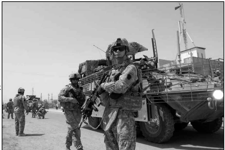
US Army soldiers patrol through Sab al Bour, a town north of Baghdad, with a column of Strykers providing support, July 2009.

another workshop in London, and the subcontractor Militex Coatings Inc have done much of the refurbishment and reworking for these vehicles. The shared experience of the Canadian, American, Australian, New Zealand, and Saudi Arabian militaries reduces the maintenance burden in NATO or ABCA, and the LAV User Nations Group was created to build on this shared knowledge. 49