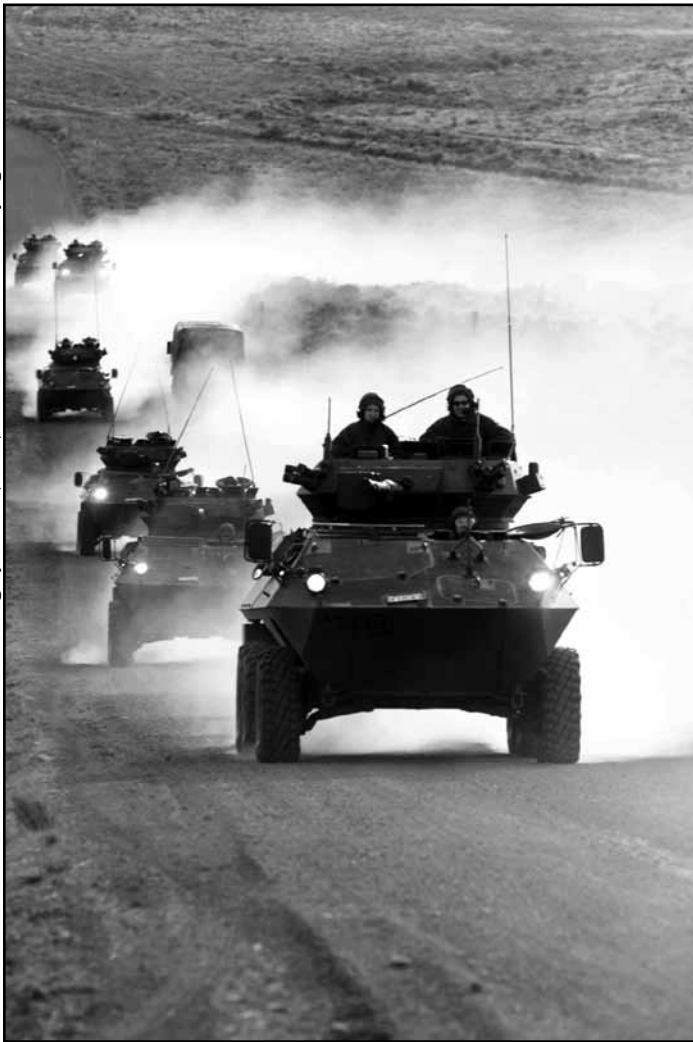
Top: Three variants of the Armoured Vehicle General Purpose (AVGP), a six-wheeled vehicle, were introduced into Canadian service in 1976. (l. to r.) the Cougar fire support vehicle, the Grizzly infantry carrier, and the Husky maintenance vehicle.