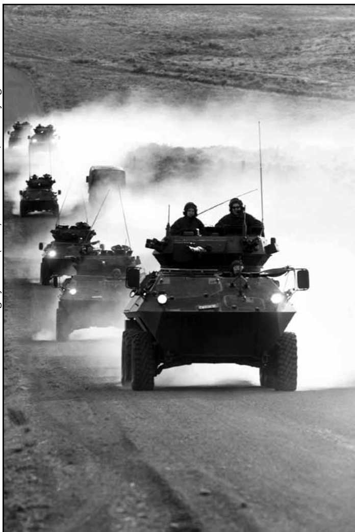
Top: Three variants of the Armoured Vehicle General Purpose (AVGP), a six-wheeled vehicle, were introduced into Canadian service in 1976. (l. to r.) the Cougar fire support vehicle, the Grizzly infantry carrier, and the Husky maintenance vehicle.