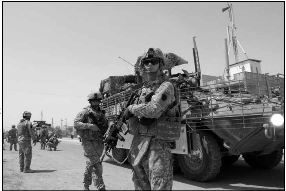
US Army soldiers patrol through Sab al Bour, a town north of Baghdad, with a column of Strykers providing support, July 2009.

another workshop in London, and the subcontractor Militex Coatings Inc have done much of the refurbishment and reworking for these vehicles. The shared experience of the Canadian, American, Australian, New Zealand, and Saudi Arabian militaries reduces the maintenance burden in NATO or ABCA, and the LAV User Nations Group was created to build on this shared knowledge. 49