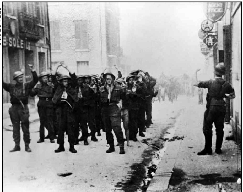
Canadian prisoners of war led through Dieppe by German soldiers. These men made up the bulk of the "missing" casualties held back from publication for a month at British insistence.