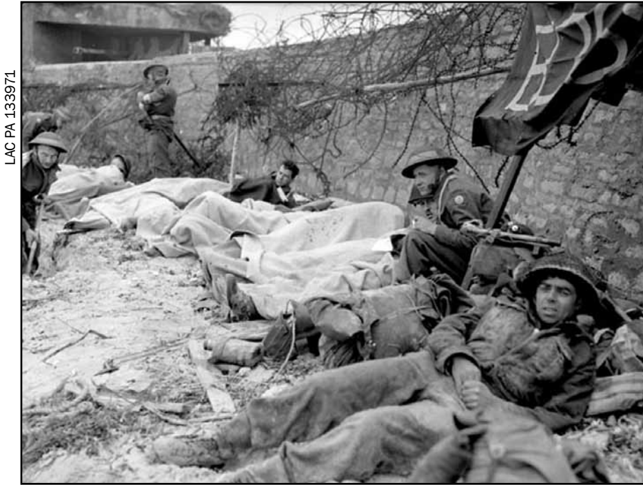
The wounded await evacuation to a Casualty Clearing Station of the Royal Canadian Army Medical Corps in the Normandy beachhead, France, 6 June 1944. Canadians became impatient to know the D-Day casualty numbers, especially after the Americans announced theirs.

right to alter this policy if conditions changed, after consulting the War Office. 72 Nonetheless, the competing motivations behind the NDHQ and War Office – worry over public criticism versus security concerns – guaranteed continued conflict.