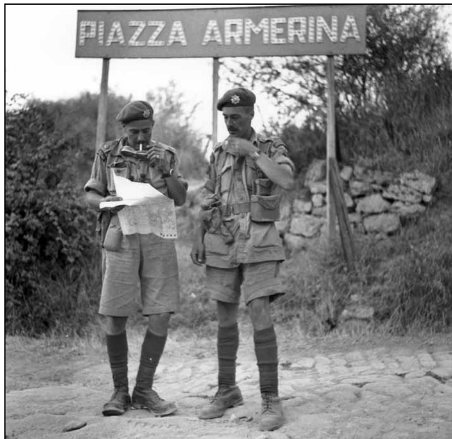
Library and Archives Canada (LAC) PA 132777

A similar situation occurred during the Sicily campaign with the casualty notifications hampered by the lack of a Second Echelon radio frequency. Additionally, mountainous terrain, poor quality batteries, and a lack of radio equipment due to the loss of supply ships meant that communications between Canadian units proved difficult, adding to casualty reporting delays. 21 This resulted in the inevitable informal revelations. The most conspicuous case, which the Conservative Globe and Mail attempted to turn into a government embarrassing cause célèbre , involved the family of Lieutenant-Colonel Ralph Crowe of the Royal Canadian Regiment, killed on 24 July. On 6 August several journalists asked the family for pictures of Crowe, explaining they wanted pictures of all members of the regiment. The family later learned that stories of Crowe's death began circulating at the local military district headquarters that