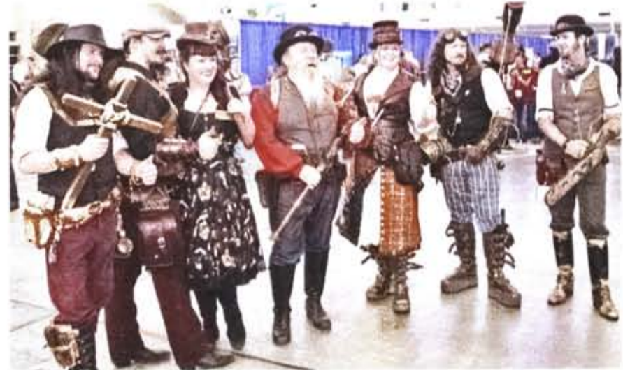
Steven Spielberg and Peter Jackson (top) share their upcoming collaboration, The Adventures of Tintin while elsewhere fans embrace the Comic-Con experience by posing for photos in their costumes.