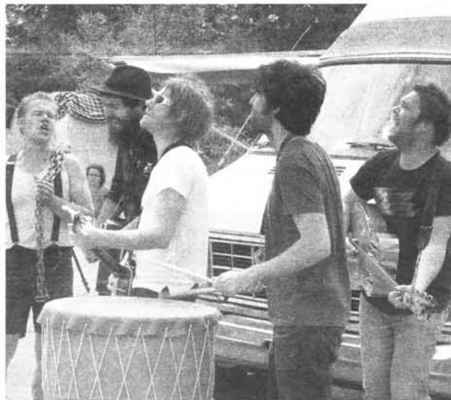
KATE TURNER LEAD PHOTOGRAPHER