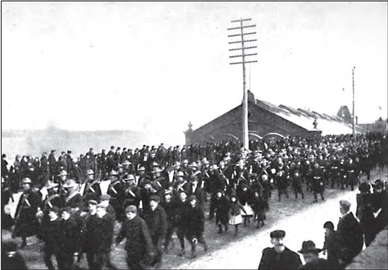
Soldiers from the Canadian Mounted Rifles, part of the second contingent sent to South Africa, on their way to embark for their voyage overseas.

On 9 October, the Boer ultimatum to Britain expired, and war was declared. Two days later, Boer troops moved into British territory. On 13 October, Minto, at the conclusion of a lengthy cabinet meeting, telegraphed Chamberlain advising him that the Canadian government had agreed to offer 1,000 infantry based on the terms proposed in the Colonial Office telegram. Now that the government had agreed to despatch a respectable Canadian contribution, Minto and Hutton devoted all their efforts to influence the organization and command of the contingent.