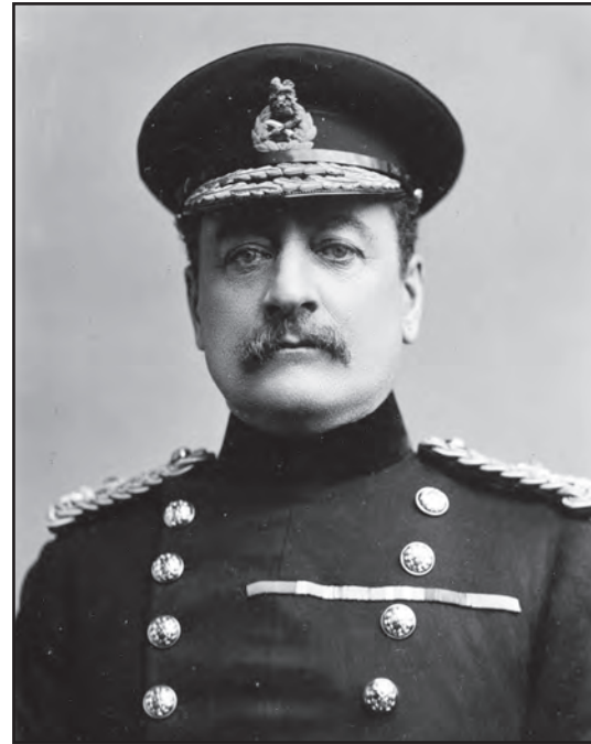
Joseph Chamberlain, secretary of state for the colonies, 1895-1903 (left); Sir Gilbert John Murray Kynynmound Elliot, 4th Earl of Minto, governor-general of Canada, 1898-1904 (centre); Major-General Edward T.H. Hutton, general officer commanding the Canadian militia, 1898-1900 (right). Though not Canadian, these three men played a major role in Canada's decision to send troops to support Britain during the South African War, a precedent which would shape all future Canadian overseas military deployments.

in the war would promote a closer relationship within the empire and might sway Britain to compromise on the issue of the preferential tariff for Canadian goods exported within the empire. 21 If Britain were willing to recruit Canadians and pay for their participation in the war, Laurier would not object. Major-General Hutton, however, had other ideas, consistent with his desire for a more robust Canadian army and for greater Canadian participation in imperial military affairs.