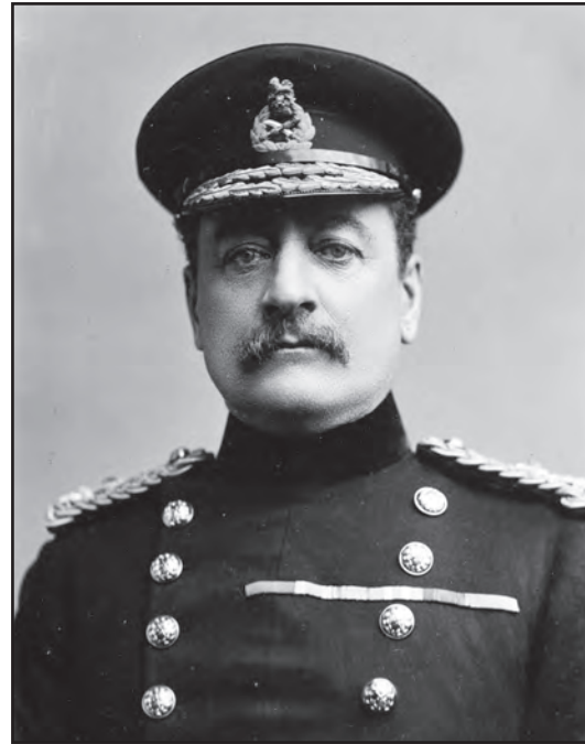
Joseph Chamberlain, secretary of state for the colonies, 1895-1903 (left); Sir Gilbert John Murray Kynynmound Elliot, 4th Earl of Minto, governor-general of Canada, 1898-1904 (centre); Major-General Edward T.H. Hutton, general officer commanding the Canadian militia, 1898-1900 (right). Though not Canadian, these three men played a major role in Canada's decision to send troops to support Britain during the South African War, a precedent which would shape all future Canadian overseas military deployments.

in the war would promote a closer relationship within the empire and might sway Britain to compromise on the issue of the preferential tariff for Canadian goods exported within the empire. 21 If Britain were willing to recruit Canadians and pay for their participation in the war, Laurier would not object. Major-General Hutton, however, had other ideas, consistent with his desire for a more robust Canadian army and for greater Canadian participation in imperial military affairs.