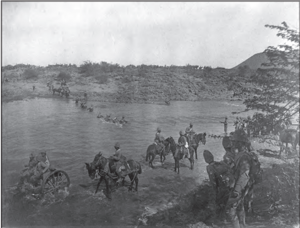
CROSSING..... PAARDEBERG..... DRIFT The 1 st Gordon Highlanders and Royal Canadian Reg't, mingled together, fording the Modder River on Sunday morning 18 th February, 1900 This is the upper of the two crossing places. The River flows from right to left. Paardeberg in the right background. Boers up stream. 82 nd Battery on the skyline, moving against the enemy. The last of the Battery in the foreground, entering lower crossing place.

further made that the retention of Canadians in one single infantry unit would, if circumstances admit, be more consistent with the wishes of Canadian Troops. 54