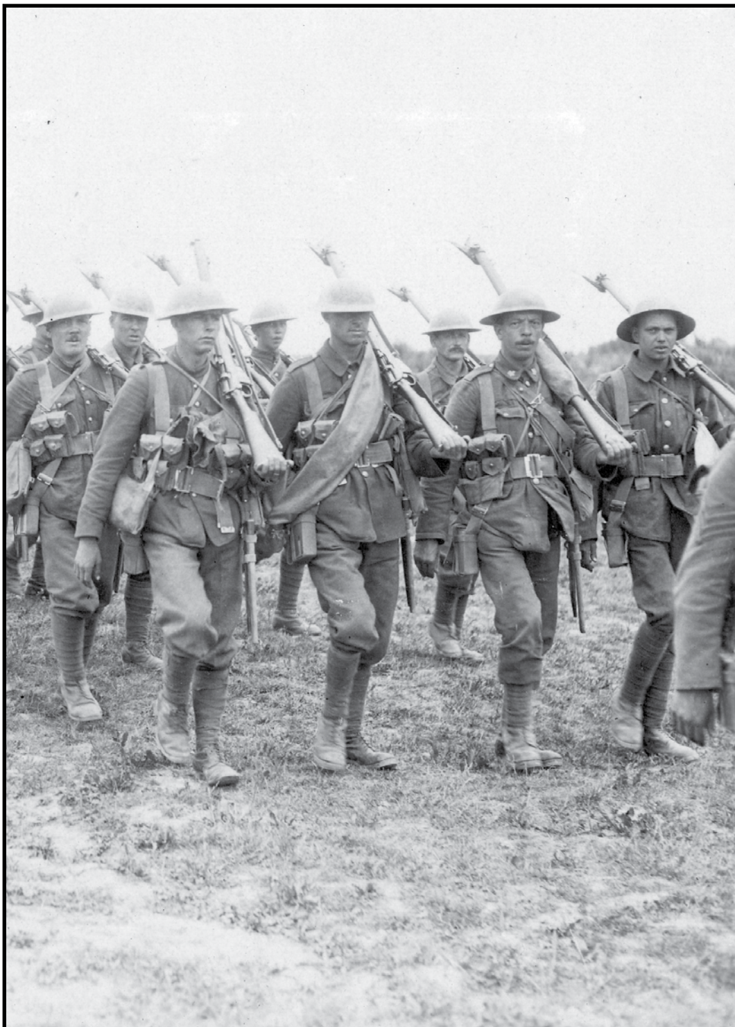
Soldiers of the 58th Battalion on their way to the trenches, June 1917.