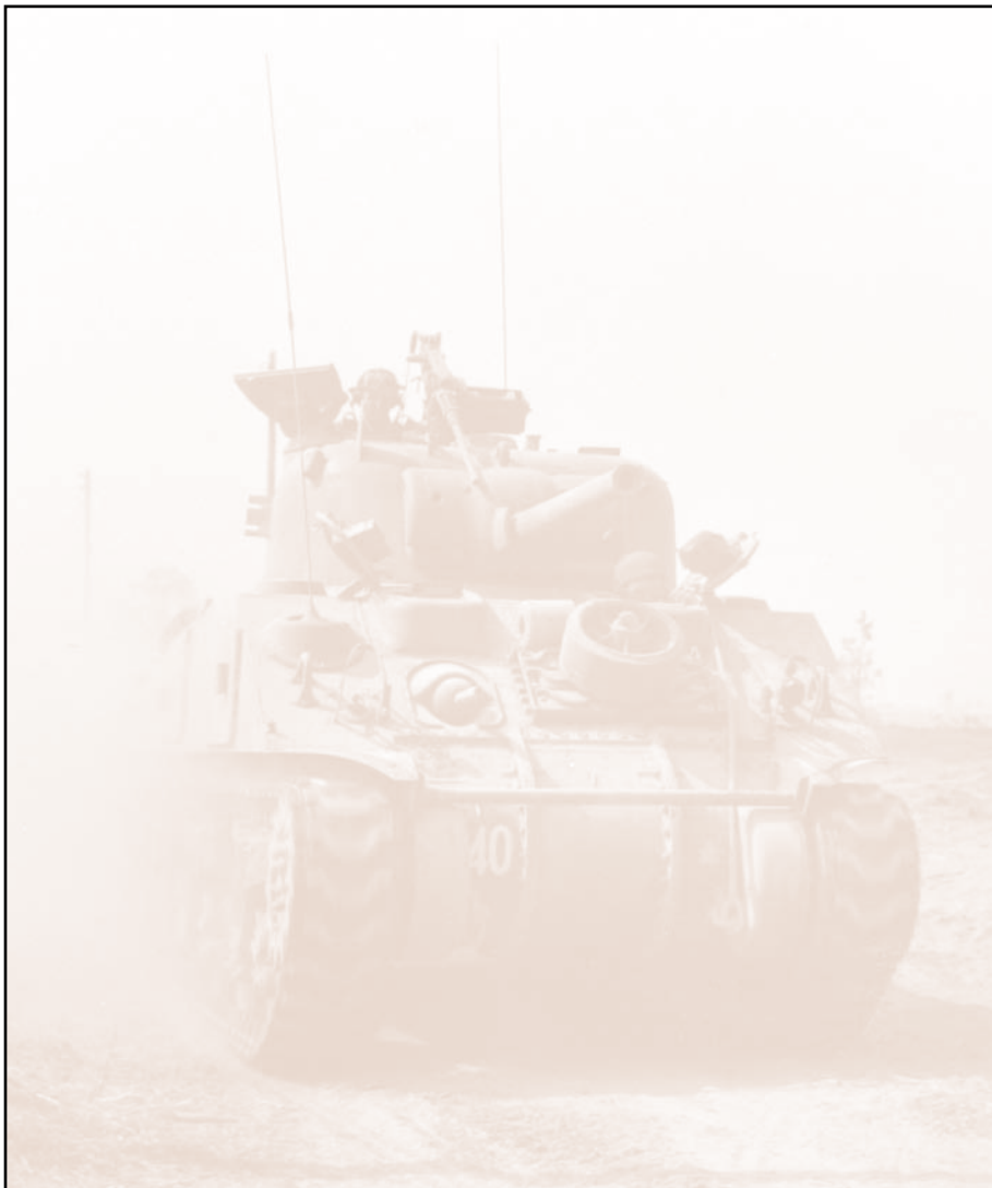
LAC PA 131373

Sherman tanks of the Sherbrooke Fusiliers were positioned behind Verrières Ridge but Brigadier Young never gave the order to commit them to battle.