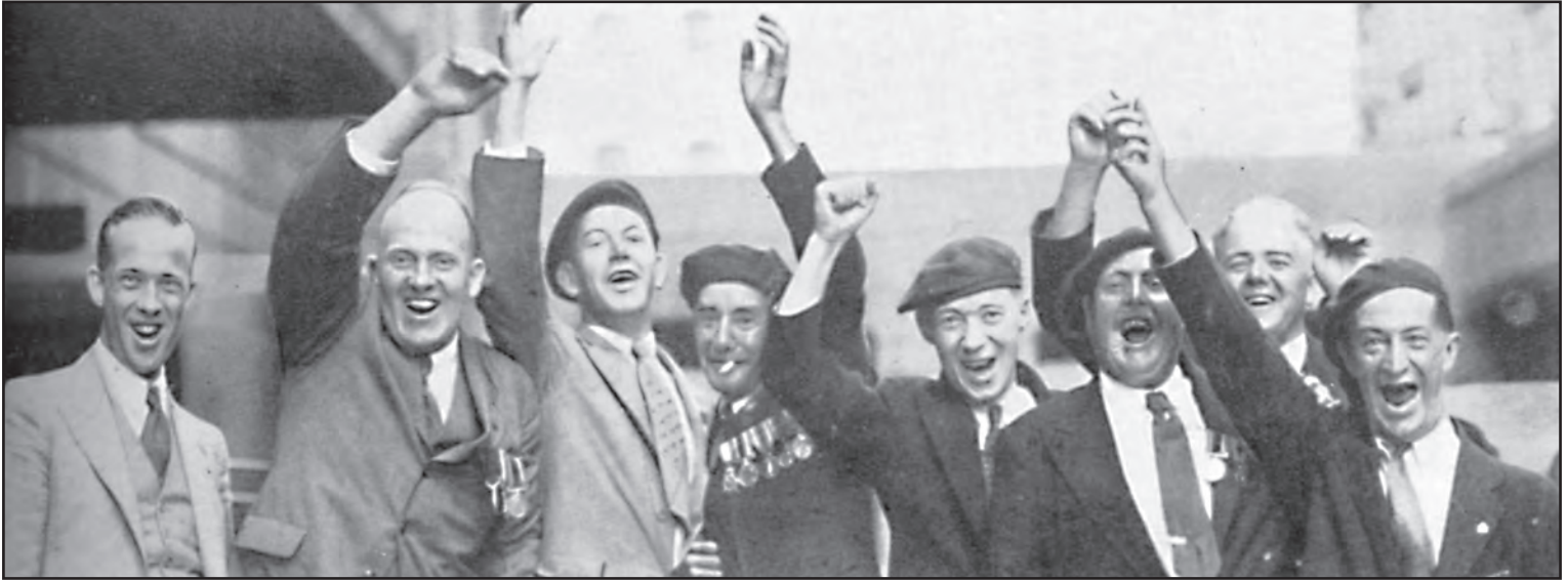
“Old Boys” gathered in Toronto in 1934 for a Canadian Corps reunion.

cabled dispatches this week that the international situation in Europe today is practically what it was in 1913 on the eve of the late war. And the rest of the world, like Europe, is haunted by the fear of war, a stalking fear, which for the past nine or ten months has dominated the press and