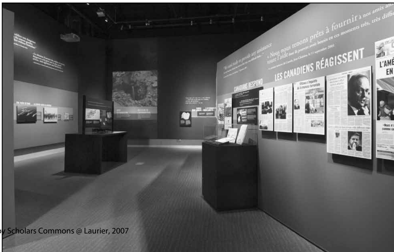
Reproductions of newspaper headlines, artifacts, and first-hand accounts highlight Canada’s response to the 9/11 attacks.

The CWM applied the same standards of scholarship and historical oversight in the