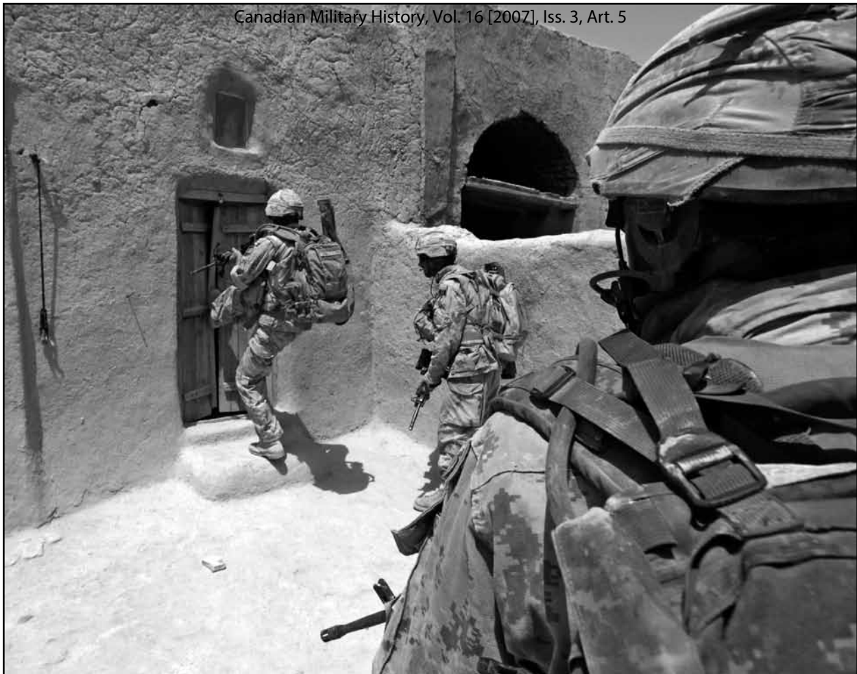
Canadian soldiers sweeping a compound in the Zhari district as part of coalition counterinsurgency operations, July 2006.

about their combat experience gathered from media reports and other sources. 9