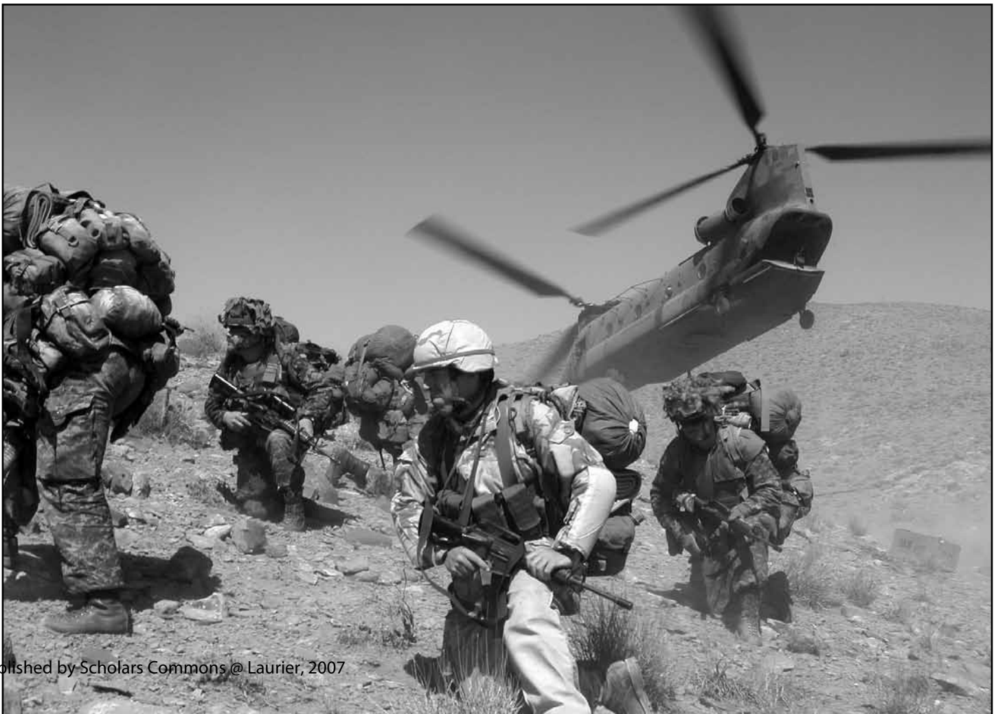
Canadian soldiers secure their landing site on the “Whale’s Back” ridgeline as part of Operation Harpoon, March 2002.