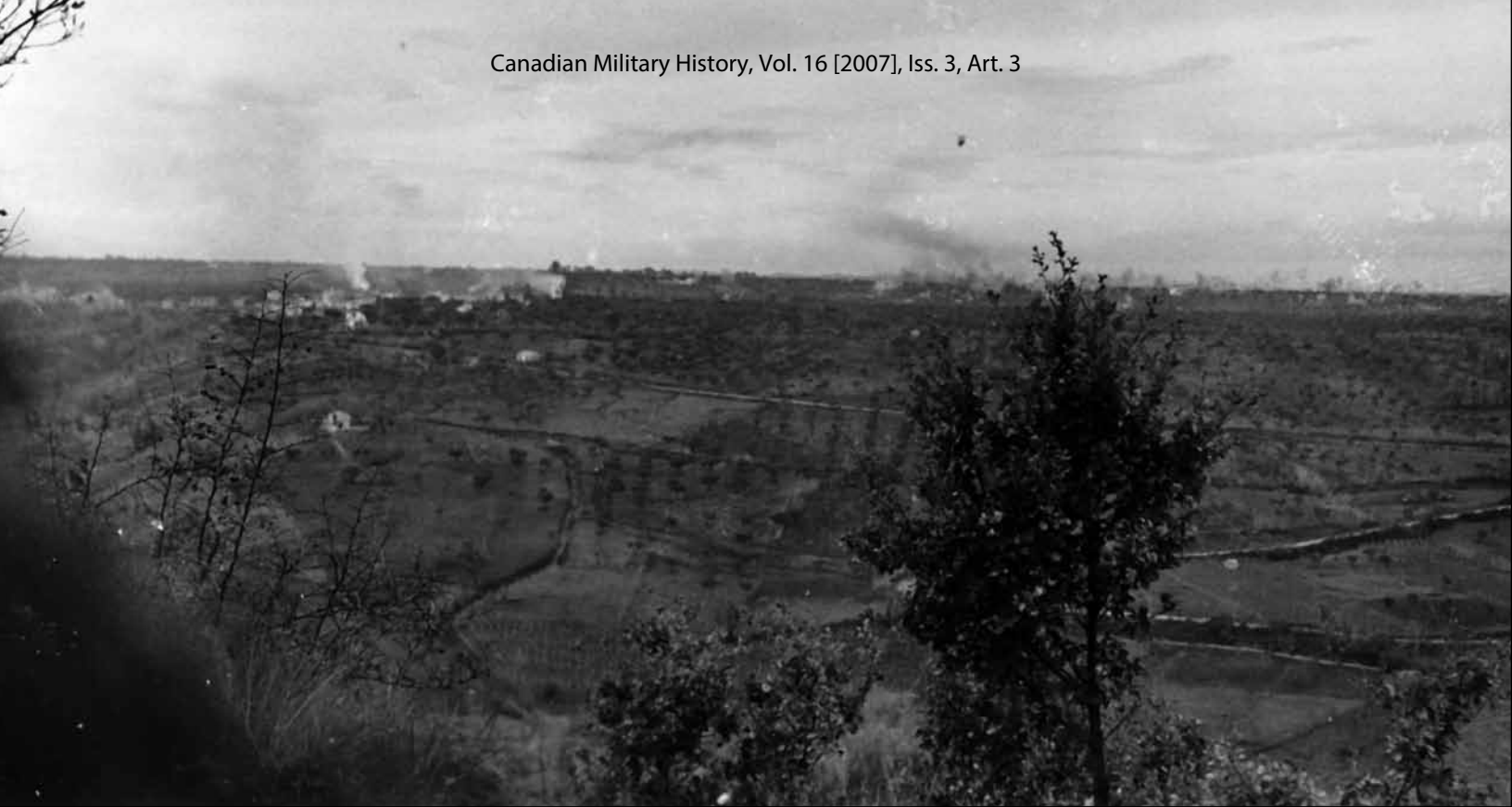
An aerial view of the Canadian artillery barrage which preceded the attack on the Moro River by 1st Canadian Infantry Division, 8 December 1943.

dismounted infantry in mountainous terrain, 32 the amount that the mules could actually carry was limited. The mules could only augment, not replace, wheeled transport.