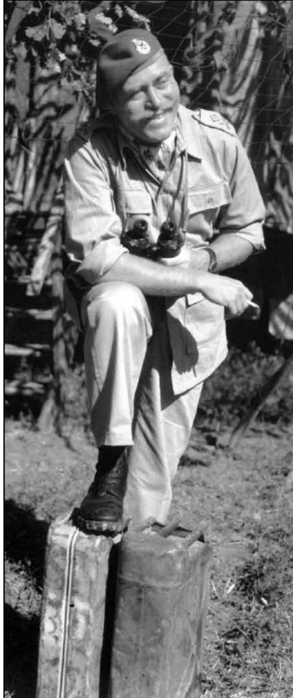
Major-General Chris Vokes, general officer commanding, 1st Canadian Infantry Division.

Decisions made at the theatre level also shaped the future Canadian battles. Rome was the next major objective, but taking it presented a significant problem for the Allied ground commander in Italy, General Sir Harold Alexander, who commanded the 15th Army Group. Geographically separated by the Apennine Mountains, the Eighth and Fifth Armies were operating practically independently of each other, with the former advancing in the centre and along the Adriatic coast while in the west the Americans were nearing Naples. Given the estimated German strength in Italy, it was clear that the Fifth Army lacked sufficient combat power to take Rome on its own, and so by 8 November 1943 Headquarters 15th Army Group, with considerable input from Montgomery, produced a coordinated plan of attack that would involve both formations. 7 The Eighth Army operation, code-named Encroach, was intended to begin on 20 November. Lieutenant-General