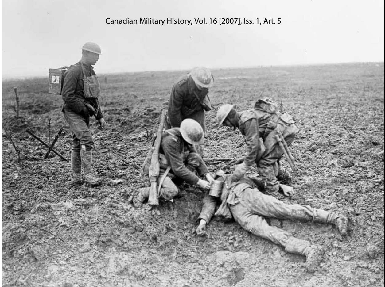
Library and Archives Canada (LAC) PA 1121