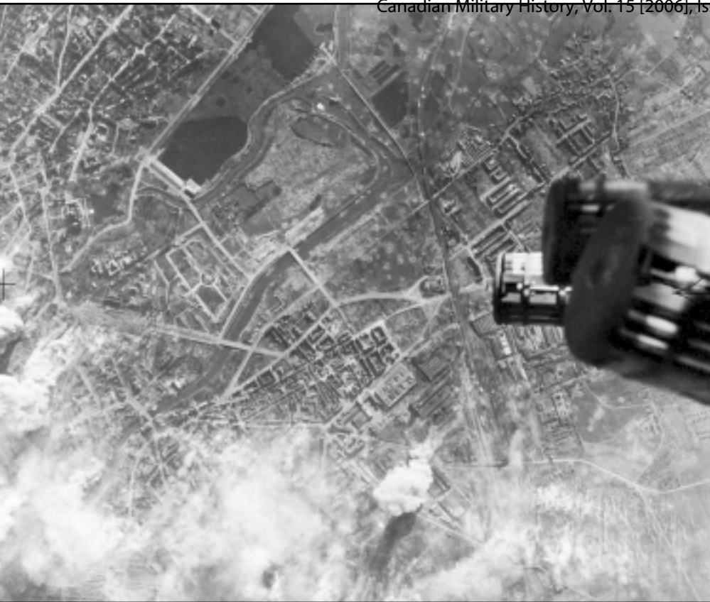
These two photographs show the daylight raid on Hannover, Germany. This was one of three daylight attacks carried out by Bomber Command on 25 March 1945 (the others were against Münster and Osnabrück) designed to interdict the main reinforcement routes into the Rhine battle area. The attack on Hannover was carried out by 267 Lancasters and 8 Mosquitos from 1, 6 and 8 Groups. One Lancaster was lost.