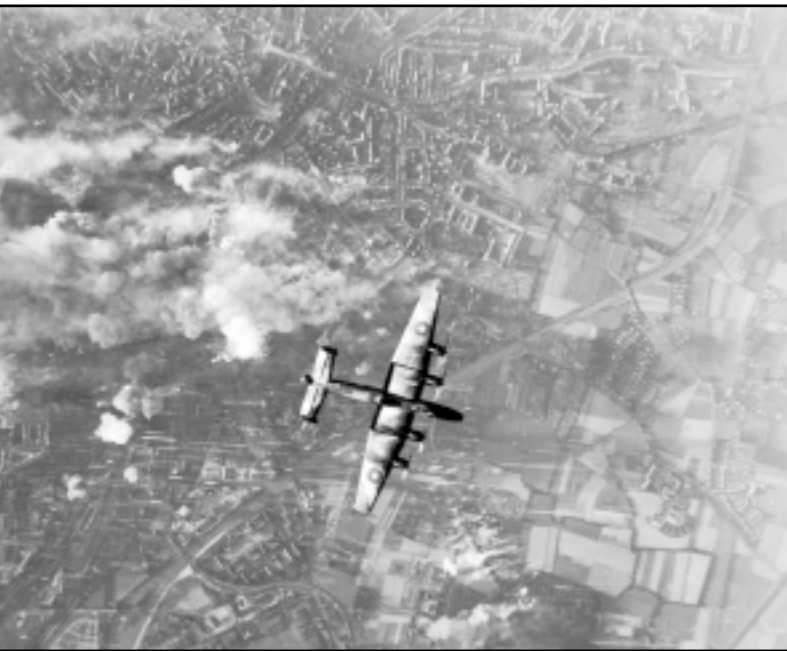
Canadian Forces Joint Imagery Centre (CFJIC) PL 144277