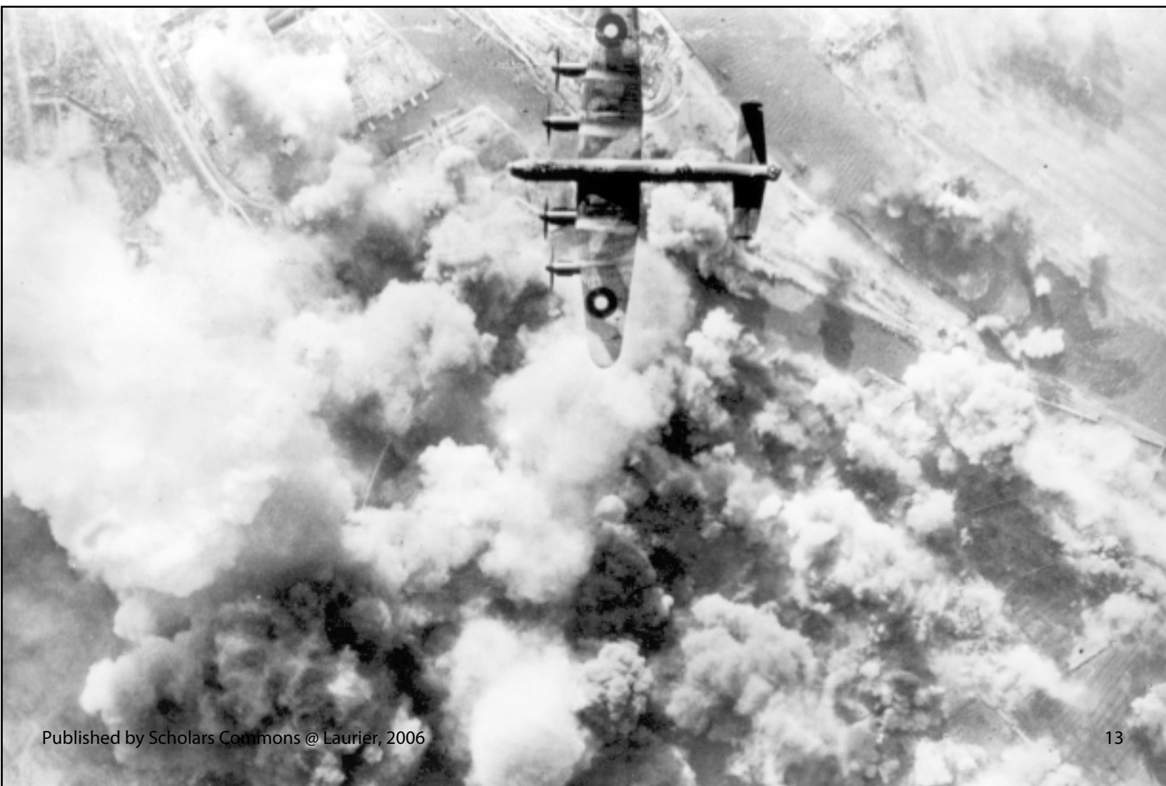
A Lancaster makes a daylight raid against an enemy dockworks.

According to one recent study, RAF crews were more successful than their counterparts in the USAAF in locating and striking a target when visual aiming was not possible. 114 This ability was a direct result of the extensive training British crews received on navigation aids. The devices which allowed Bomber Command crews to find a target at night proved equally as effective in