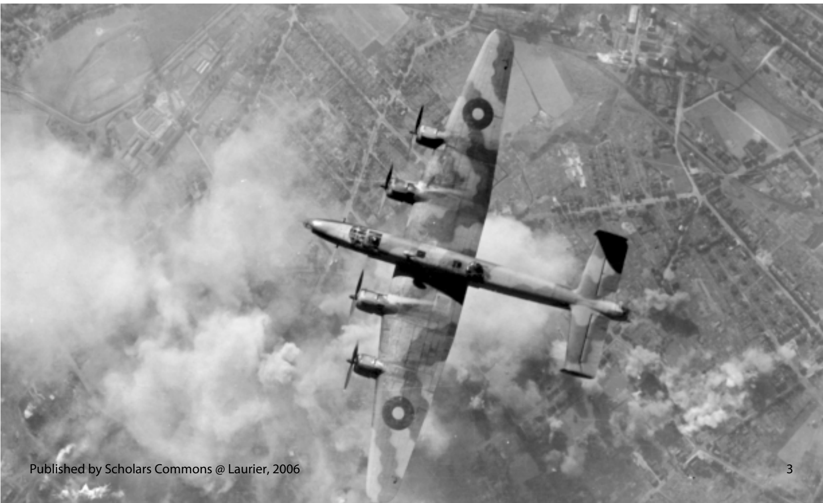
A Halifax of 6 Group RCAF makes a daylight attack on an oil refinery in the Ruhr during October 1944.

With the Allied victory in Normandy control of Bomber Command returned from General Eisenhower's headquarters to the Royal Air Force, which reassessed its strategy. There were important new opportunities, because the progress of Allied ground forces deprived the Luftwaffe of its forward air defence radars, meaning that Allied bombers would encounter much less effective interception. 15 The debate as to what should have priority turned on three major target systems: oil, communications and transport, and industrial areas. Air Chief