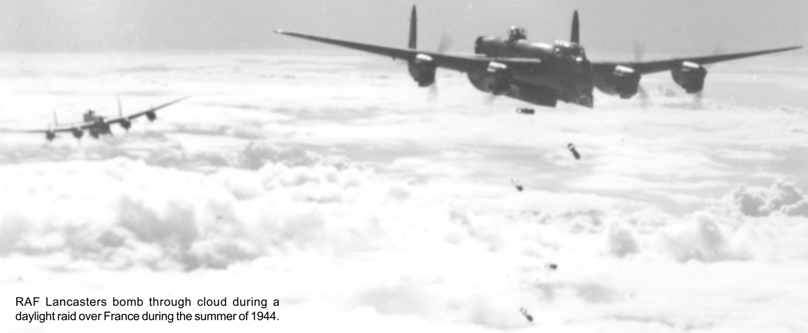
RAF Lancasters bomb through cloud during a daylight raid over France during the summer of 1944.

returned to large-scale daylight operations in 1944-1945. The availability of aircraft and crews had increased from 506 in November 1941 to 1,609 by April 1945. The light, two-engined bombers had been completely replaced by heavy four-engined aircraft that could carry much larger payloads further, with the formidable Avro Lancaster accounting for the majority of planes available (1,087) by the last few months of the war. 8 The lightweight wooden de Havilland Mosquito was also available in large numbers. Originally put into service to find and mark targets, the speed (350 mph) and ceiling (33,000 feet) of the Mosquito made it invaluable as a bomber as well. 9