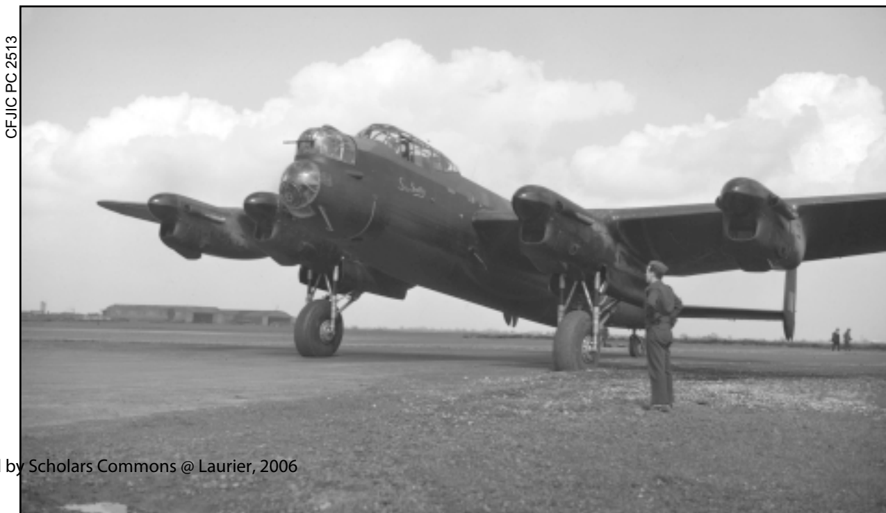
A 434 Squadron Lancaster X, 'S for Smitty,' photographed late in the war.

Additional evidence that all was not well with the Halifax III was not long in coming, as on 21