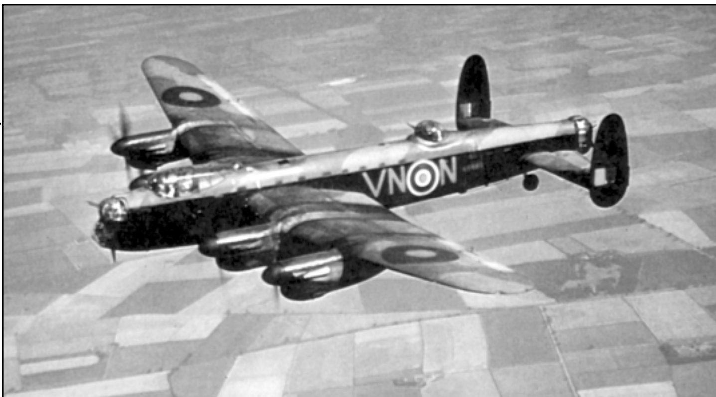
An Avro Lancaster I.

American B-29. Vickers took up the challenge and produced, in the words of one authority, “the most elegant of British heavy bomber designs,” and one which was “the ultimate expression of British concepts for piston-engine design in its class.” 6 But the third – and last – prototype of