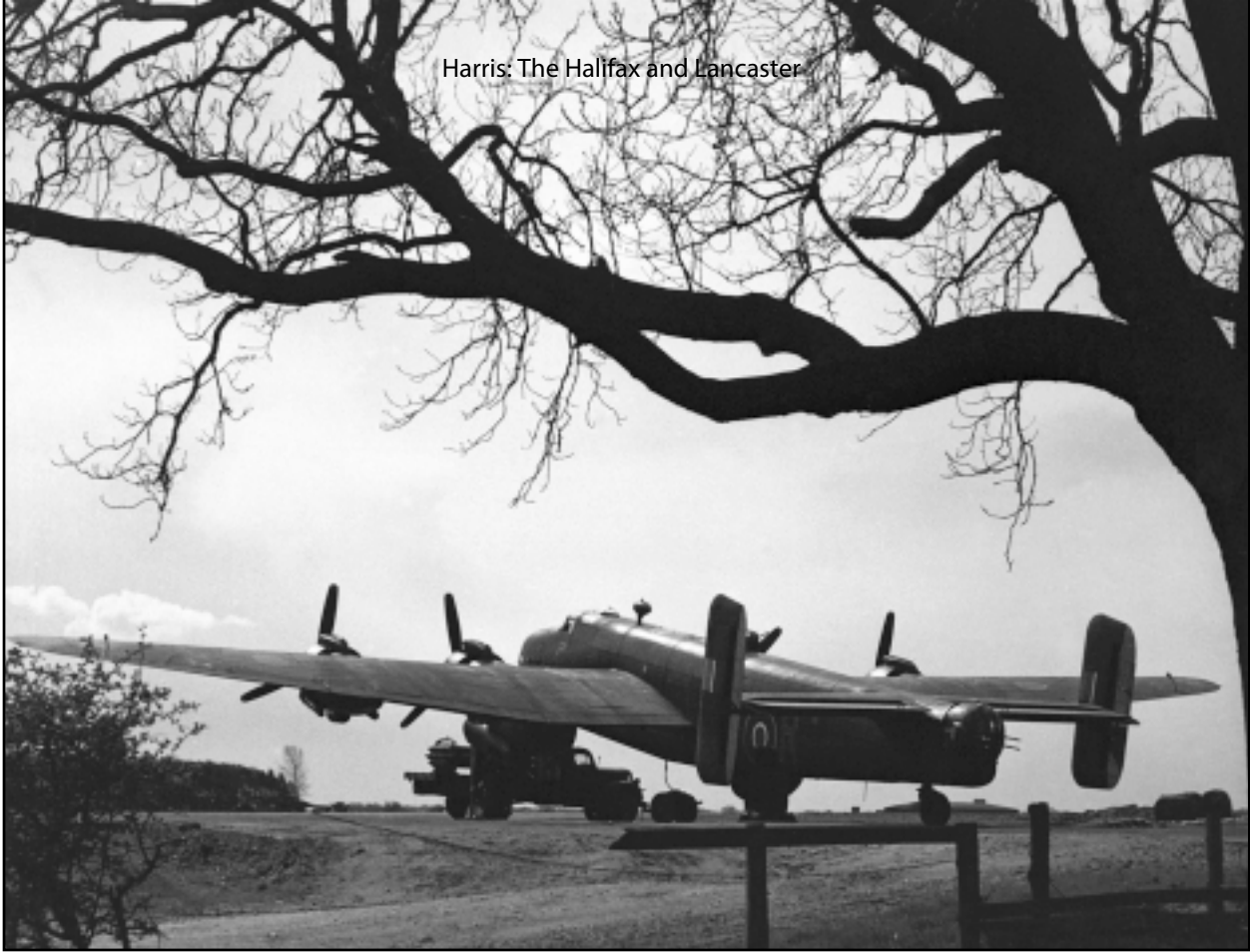
A Handley-Page Halifax Mark III of 426 Squadron at dispersal.

miserable manoeuvrability at altitude, too little speed for evasive turns, and a nasty tendency to roll over if the turrets were rotated (to follow a night fighter) while the pilot was engaging in evasive manoeuvres. 21 Moreover, the exhaust shrouds were so ineffective that Halifaxes could be seen from as far away as five hundred yards from dead astern. Unhappily, Portal informed the prime minister, finding ways to reduce the visibility of exhaust flames was a major problem of “considerable difficulty.” 22