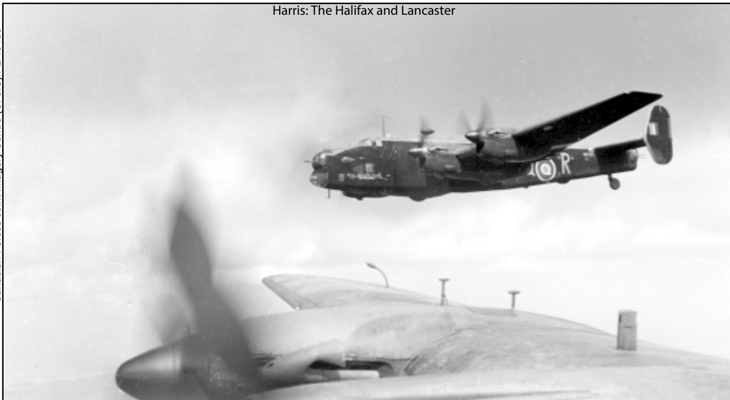
A Handley-Page Halifax Mark I or II of 405 Squadron RCAF, with early style vertical stabilizers and the nose-mounted Boulton Paul turret, in flight.

service ceiling of 38,500 feet, a speed of 345 miles per hour at 31,000 feet, a bomb load of 8,000 pounds, and remote-controlled, cannon-equipped, and radar-directed barbettes as defensive armament – a machine that would have been comparable in every respect to the