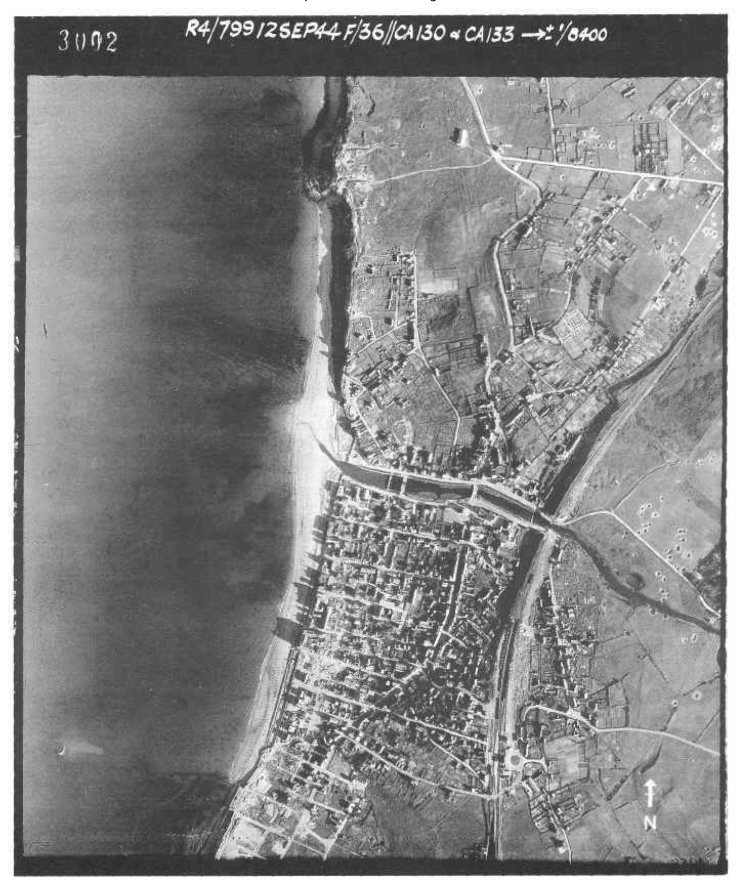
The town of Wimereux captured by the North Shore Regiment on 21/22 September 1944. The high railway embankment is evident just behind the town.