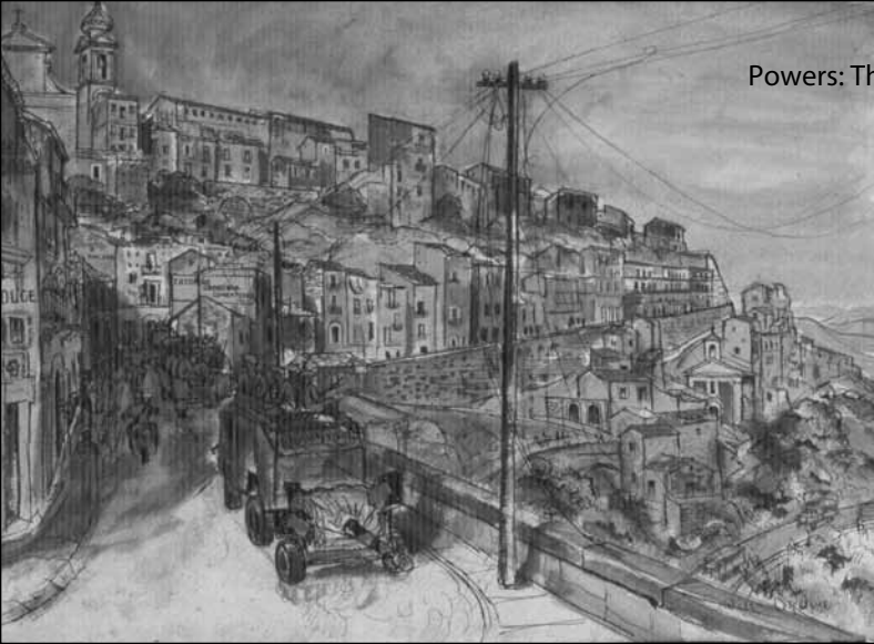
Powers: The RCRs in Sicily