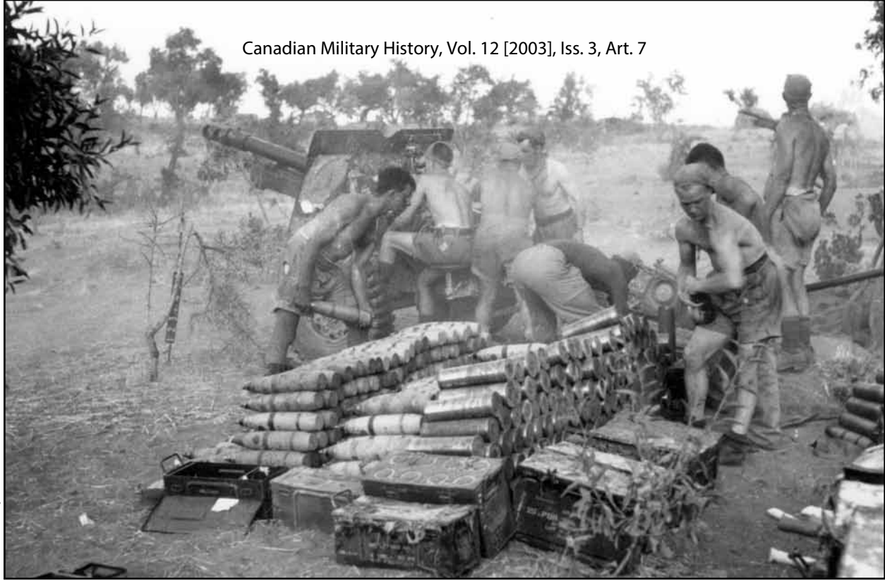
Gunners from the 7th Battery, 2nd Field Regiment, Royal Canadian Artillery firing their 25-pounder gun at enemy positions near Nissoria, July 1943.